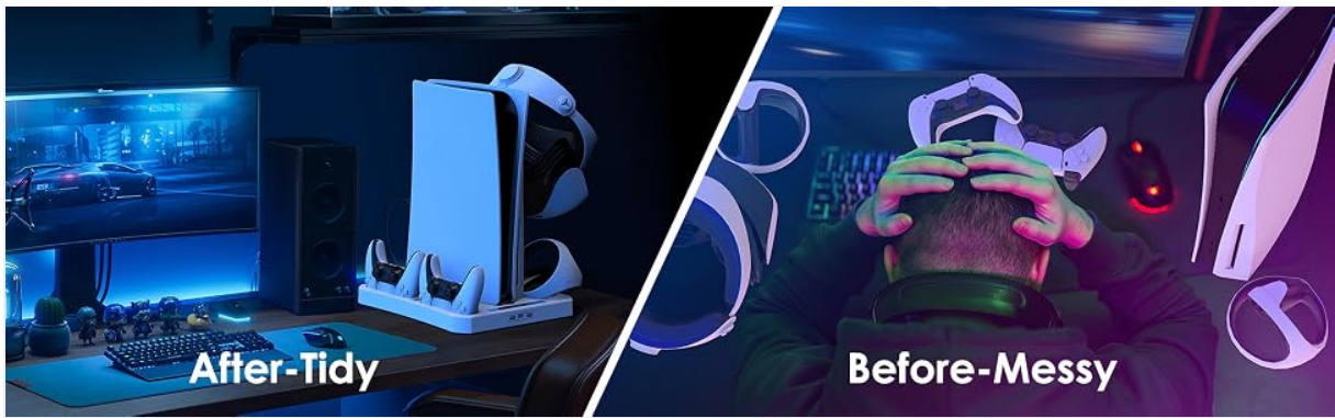
Image: A 'Before and After' comparison showing a messy desktop with gaming accessories versus a neat and orderly desktop with the HAPAW PS-5 Cooling Stand organizing all devices.