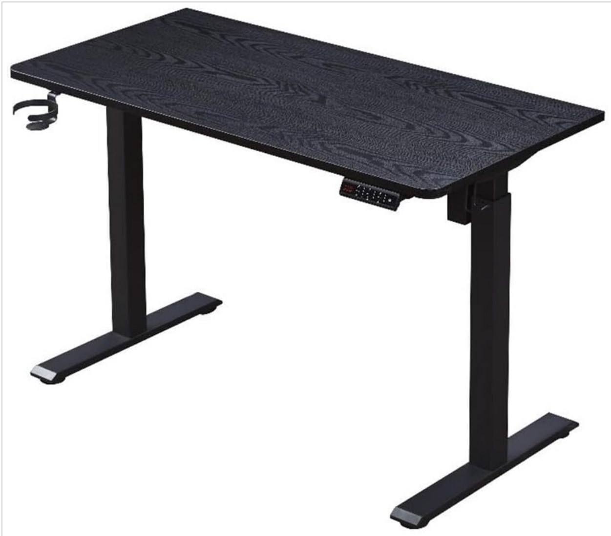
Figure 1.1: The kowo Electric Height Adjustable Standing Desk, featuring a black oak desktop and black frame.