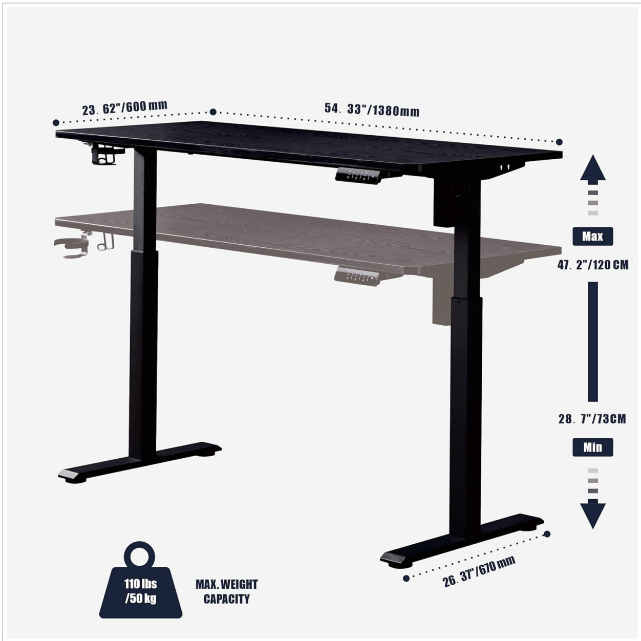
Figure 8.1: Dimensional diagram illustrating the desk's width, depth, and adjustable height range.