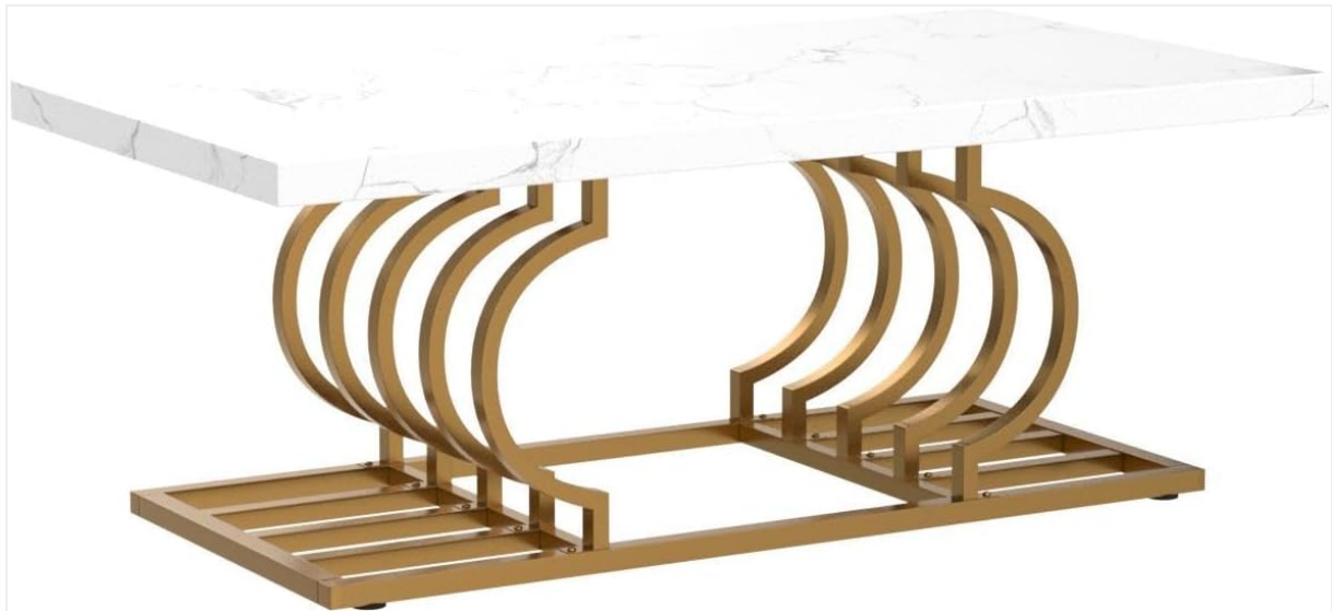
Image 4.1: Dimensional overview of the Tribesigns Modern Coffee Table. Dimensions are approximately 120cm (47.24") W x 50cm (19.68") D x 50cm (19.68") H.