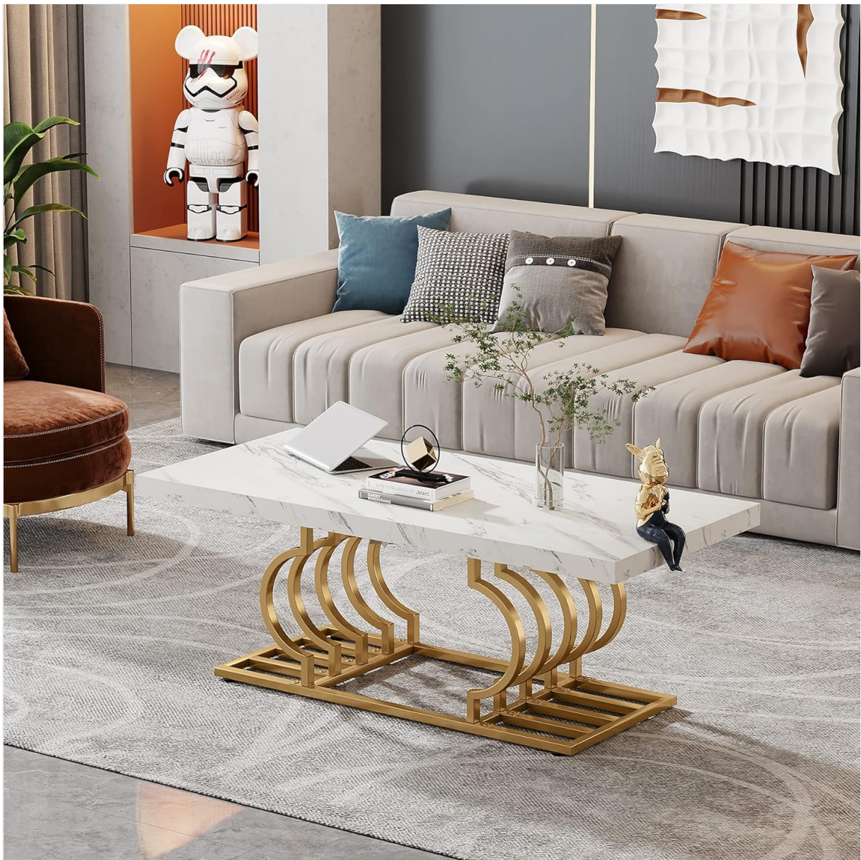
Image 1.1: The Tribesigns Modern Coffee Table (HOGA-C0733) in a contemporary living room environment.