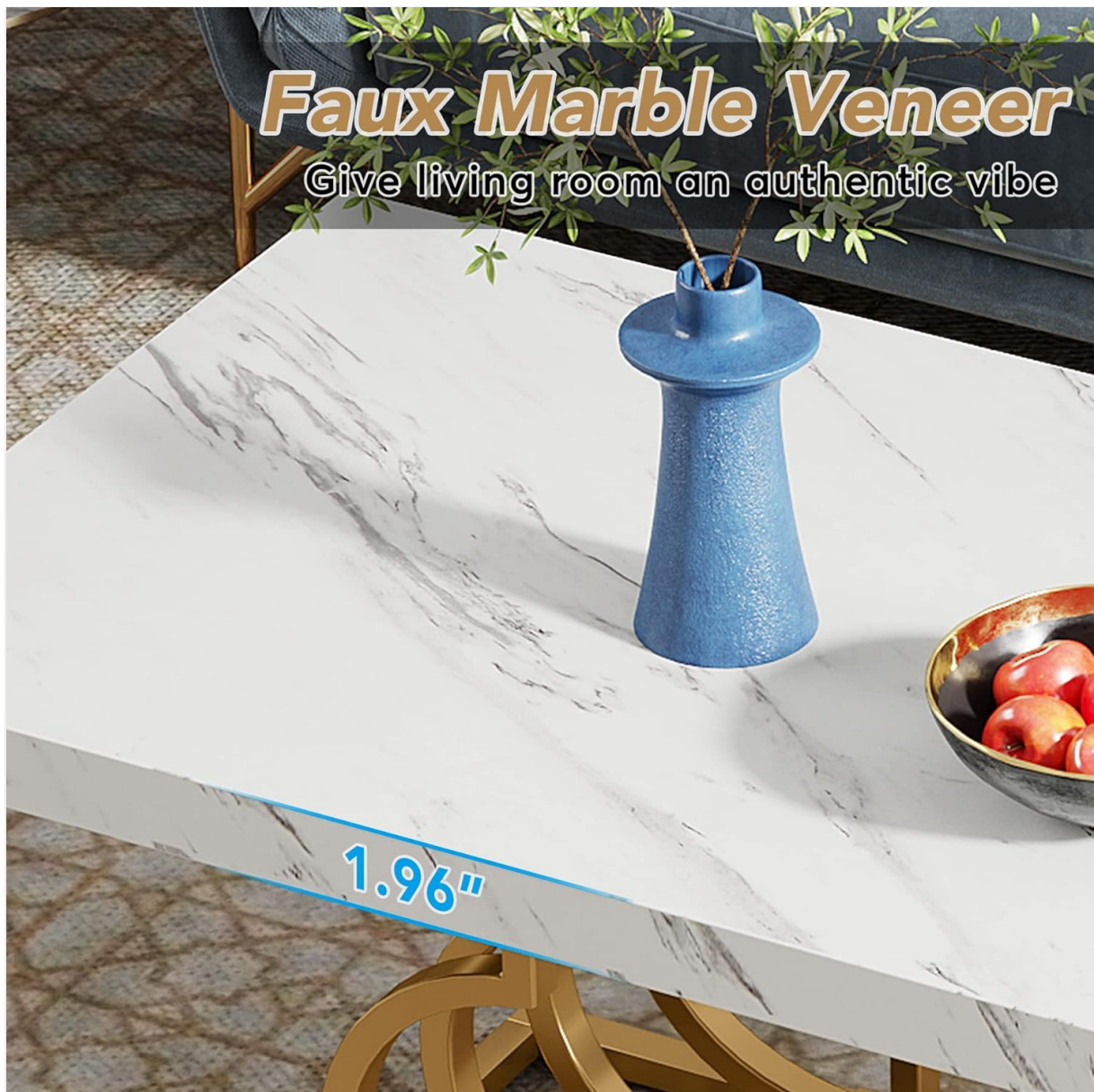
Image 6.1: Detail of the faux marble veneer, highlighting its smooth and easy-to-clean surface.