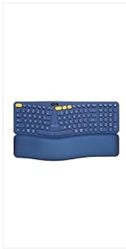
Image: The 2.4G, BT1, and BT2 keys for switching between connected devices.