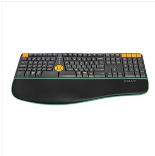
Image: Top view of the DELUX GM905 keyboard.