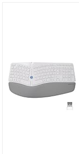
Image: The integrated padded wrist rest provides comfort and support.