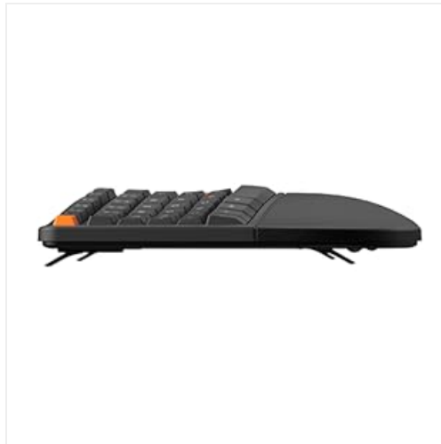
Image: Side view of the keyboard showing its ergonomic profile and dimensions.