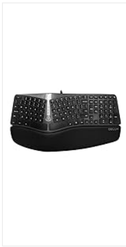
Image: The full-size, full-function layout with an ergonomic form factor.