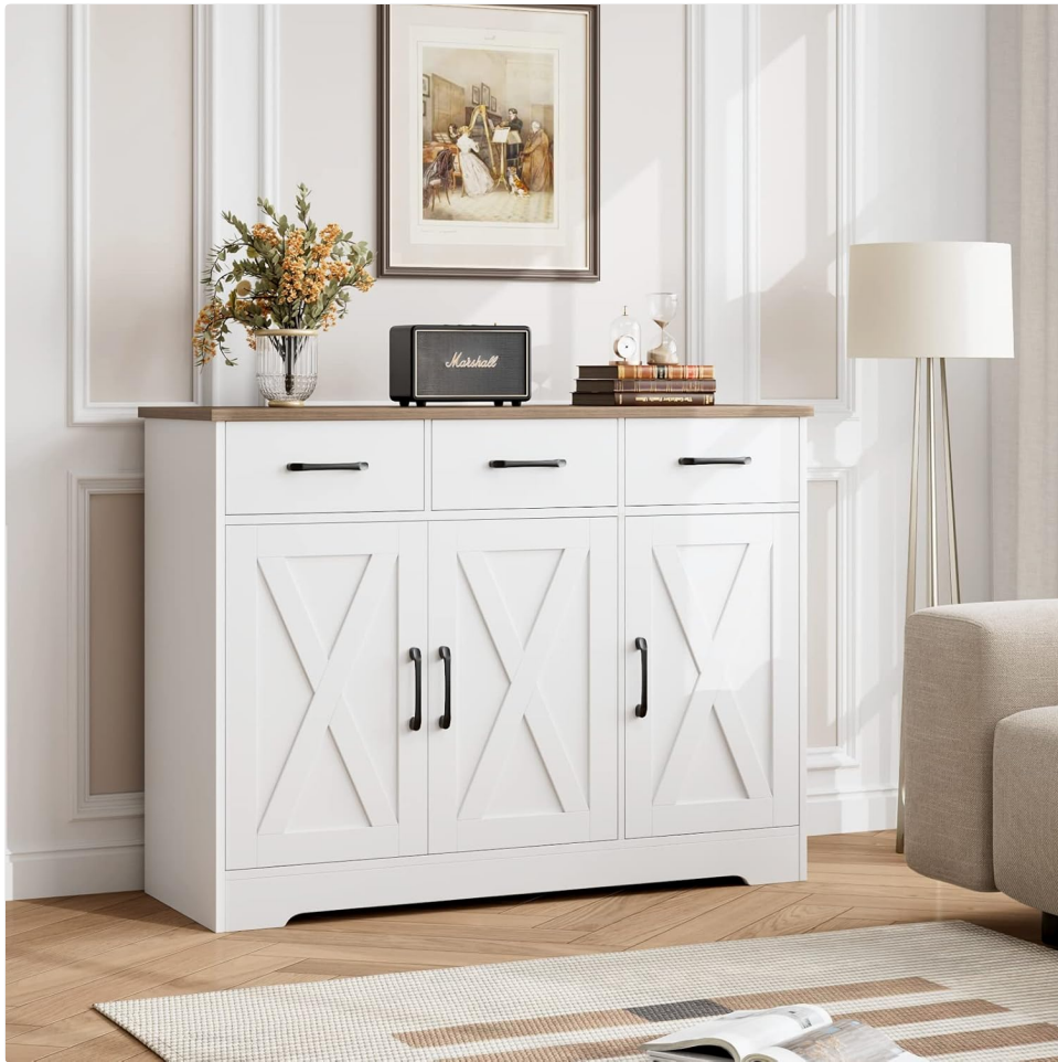
Figure 1: Assembled HOSTACK Sideboard Buffet Cabinet in a living room setting.