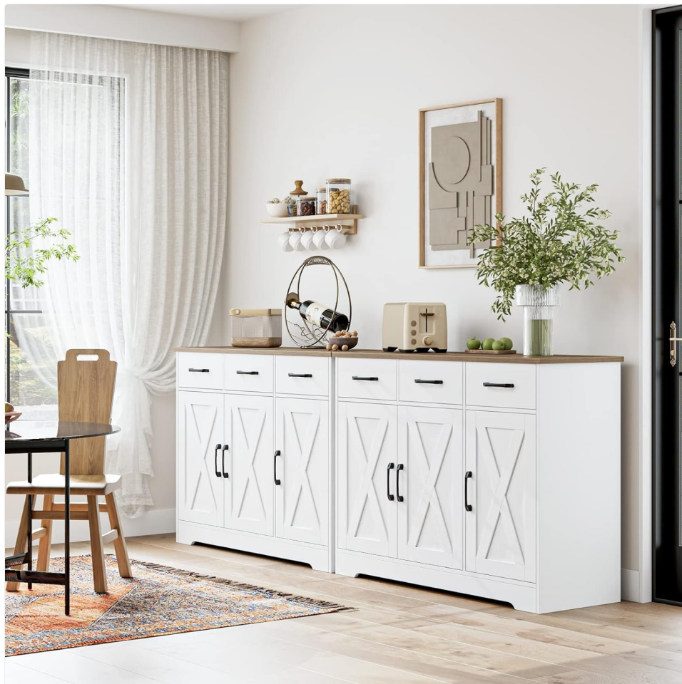
Figure 3: The cabinet functions effectively as a coffee bar or kitchen storage.