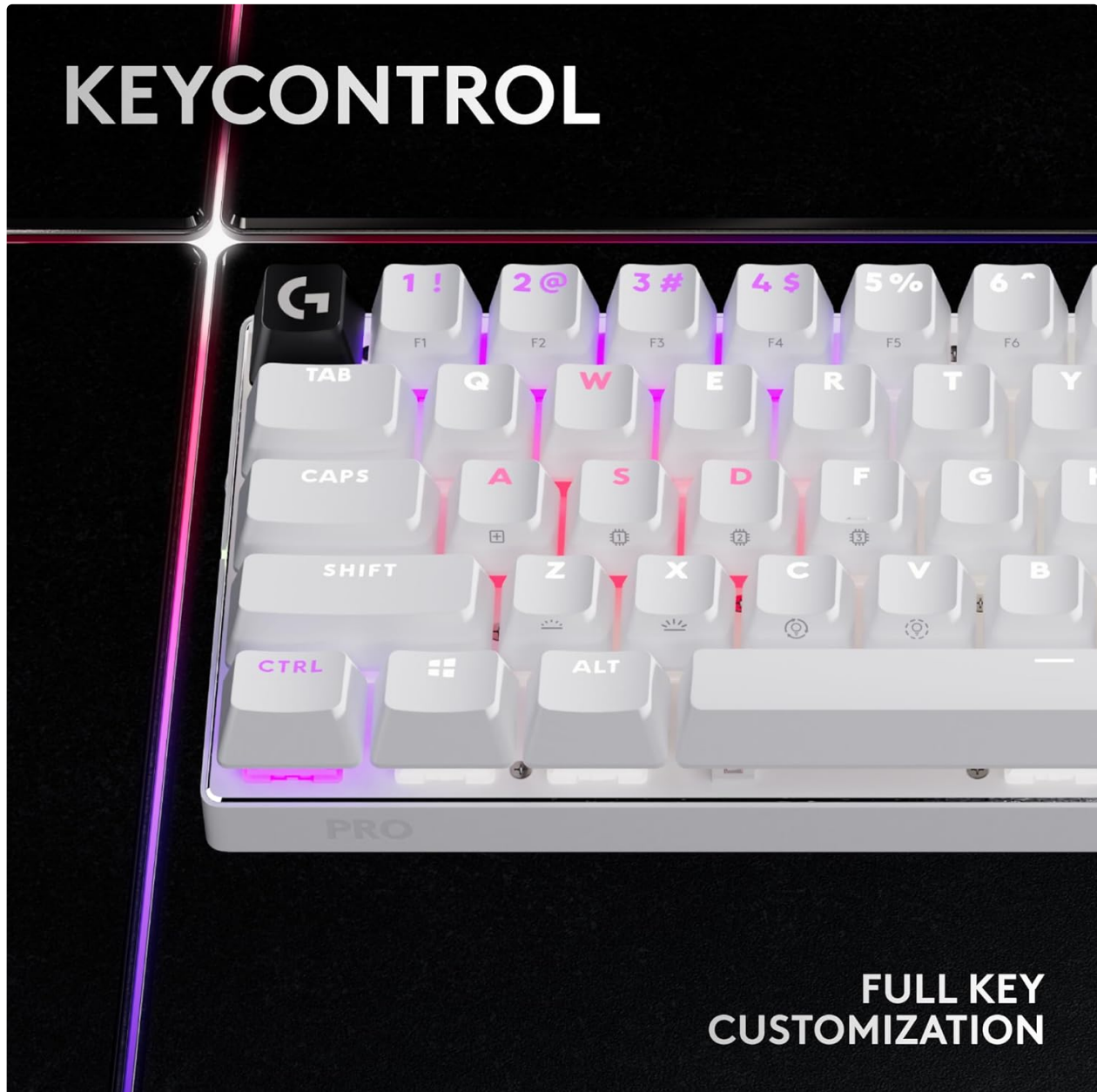
Image: KEYCONTROL feature for full key customization.

Personalize your keyboard's aesthetics with customizable LIGHTSYNC RGB backlighting. Access a spectrum of 16.8 million colors and various lighting effects through the G HUB software to match your setup or mood.