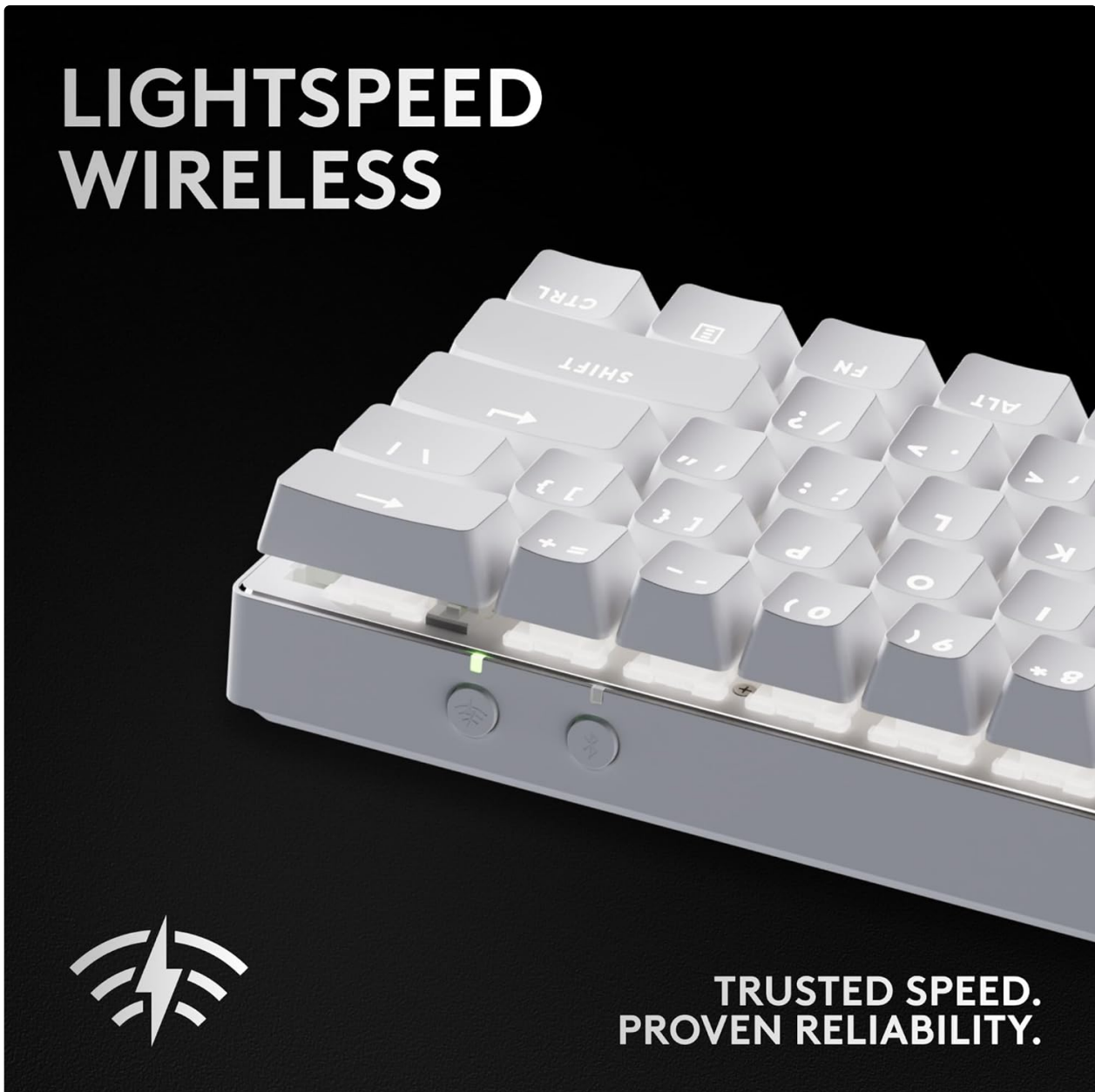
Image: Side view of the keyboard showing the LIGHTSPEED wireless indicator and power switch.