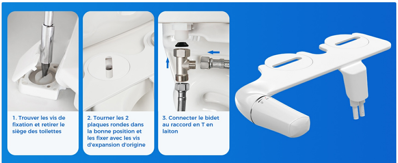
Image: Overview of the PENDEJATO bidet attachment and its components, including the main bidet unit, a braided metal hose, and a T-adapter for water connection.