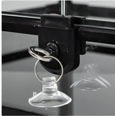
Image 3.1: Step-by-step visual guide for assembling the terrarium.

Ensure all glass panels are securely seated and the frame is stable before proceeding to add substrate or your pet.