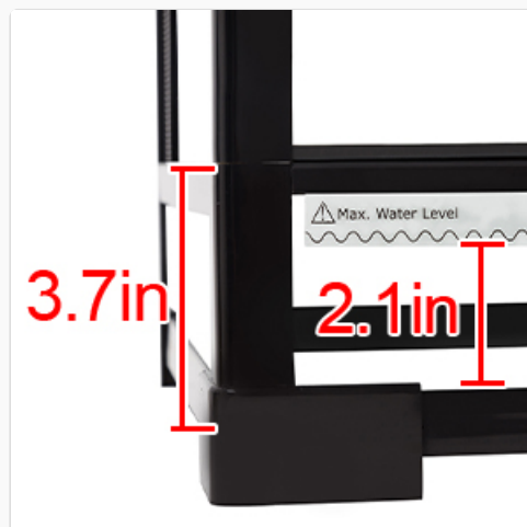
Image 2.3: Detail of the raised bottom frame, designed to accommodate an under-tank heater.