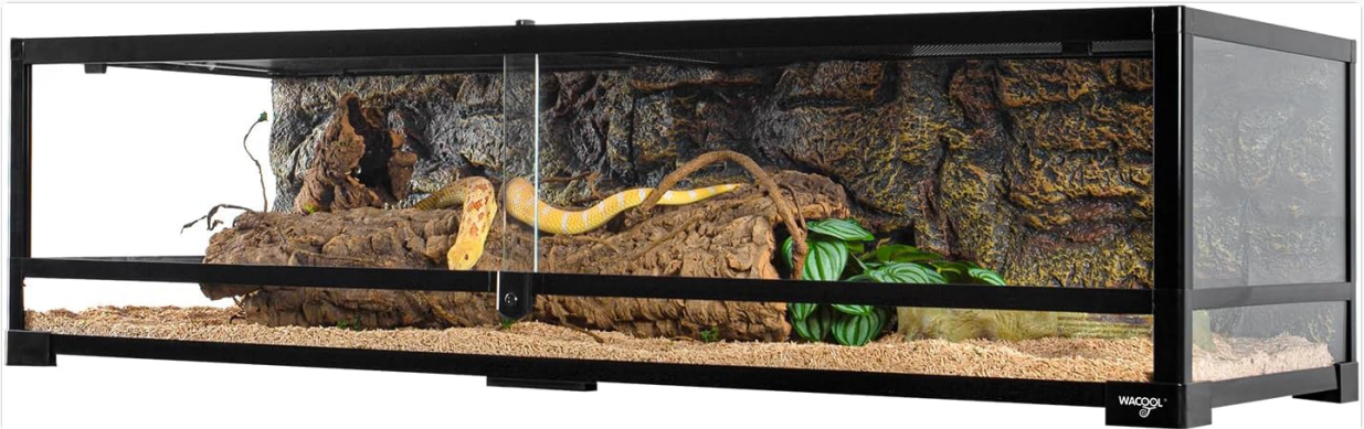
Image 1.1: The WACOOOL TERRA 45 Gallon Glass Reptile Terrarium, showcasing its full glass design and suitable for various reptile species.

This instruction manual provides essential information for the assembly, operation, and maintenance of your WACOOOL TERRA 45 Gallon Glass Reptile Terrarium, Model RK0221. Designed for various reptiles and amphibians such as corn snakes, tortoises, geckos, and ball pythons, this terrarium offers a secure and spacious habitat. Please read these instructions thoroughly before assembly and use to ensure proper setup and the well-being of your pet.