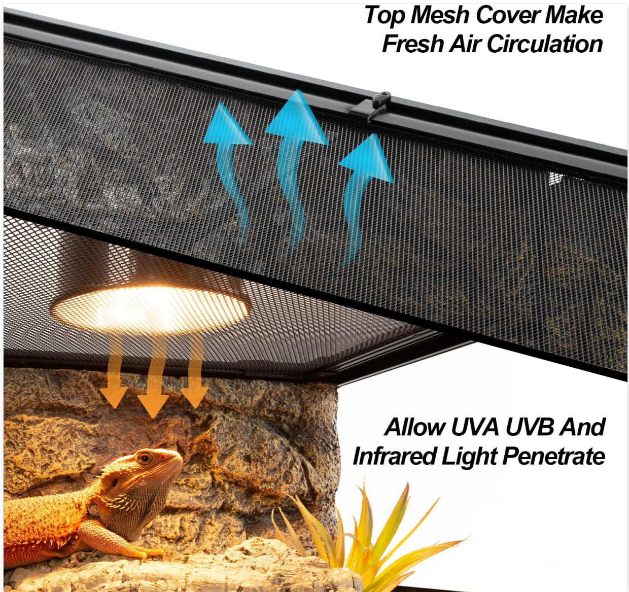
Image 2.2: Illustration of fresh air circulation and UVA/UVB light penetration through the mesh top.