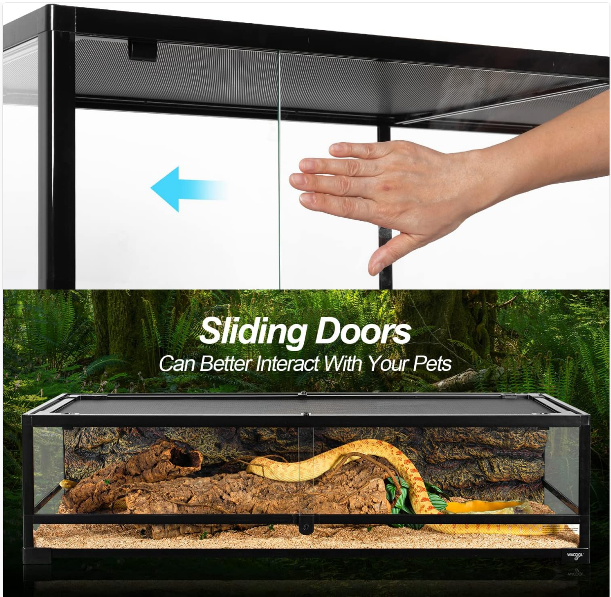
Image 4.1: A hand demonstrating the operation of the sliding front doors.