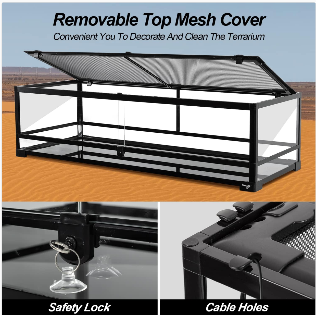
Image 5.1: The terrarium with its mesh top in an open position, facilitating access for cleaning and decorating.