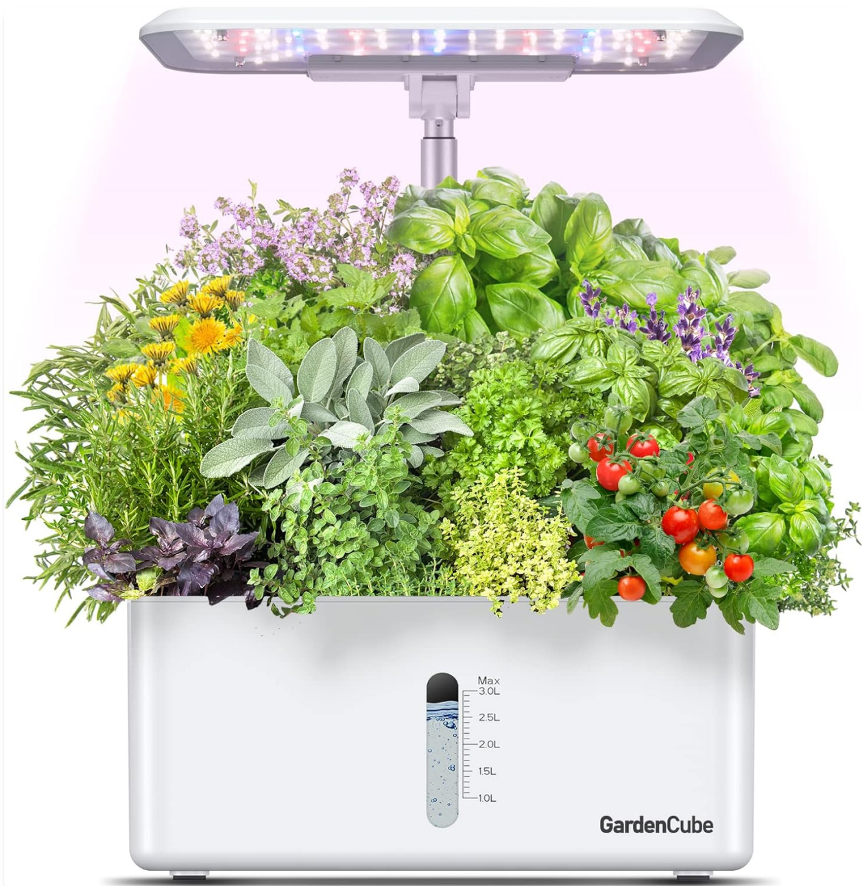
The GARDENCUBE Hydroponics Growing System, ready for cultivation.