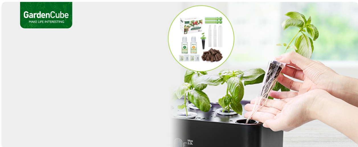
All components included in the GARDENCUBE Hydroponics Growing System kit.