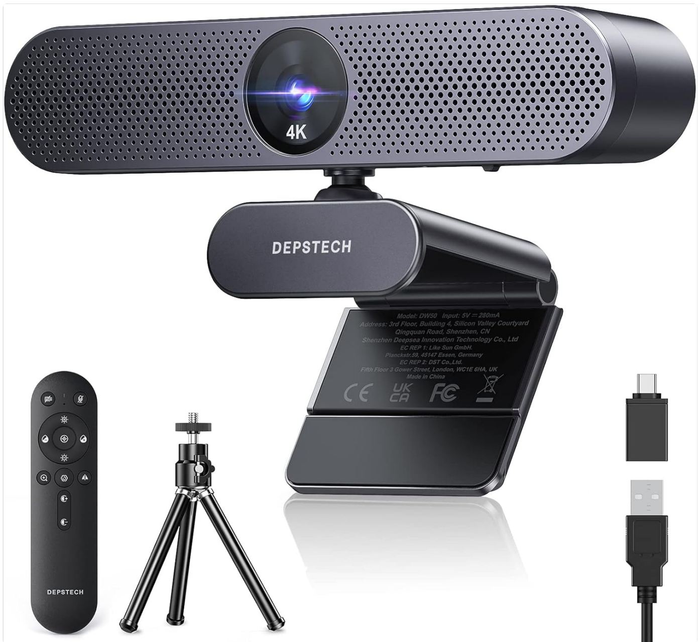
Image: The DEPSTECH DW50 Pro Webcam, remote control, USB-C adapter, and mini tripod included in the package.