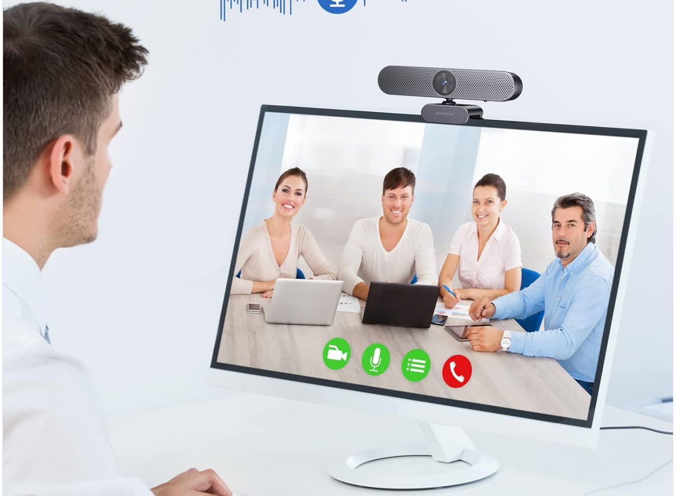
Image: A person participating in a video conference, illustrating the noise-canceling dual microphones capturing clear audio.