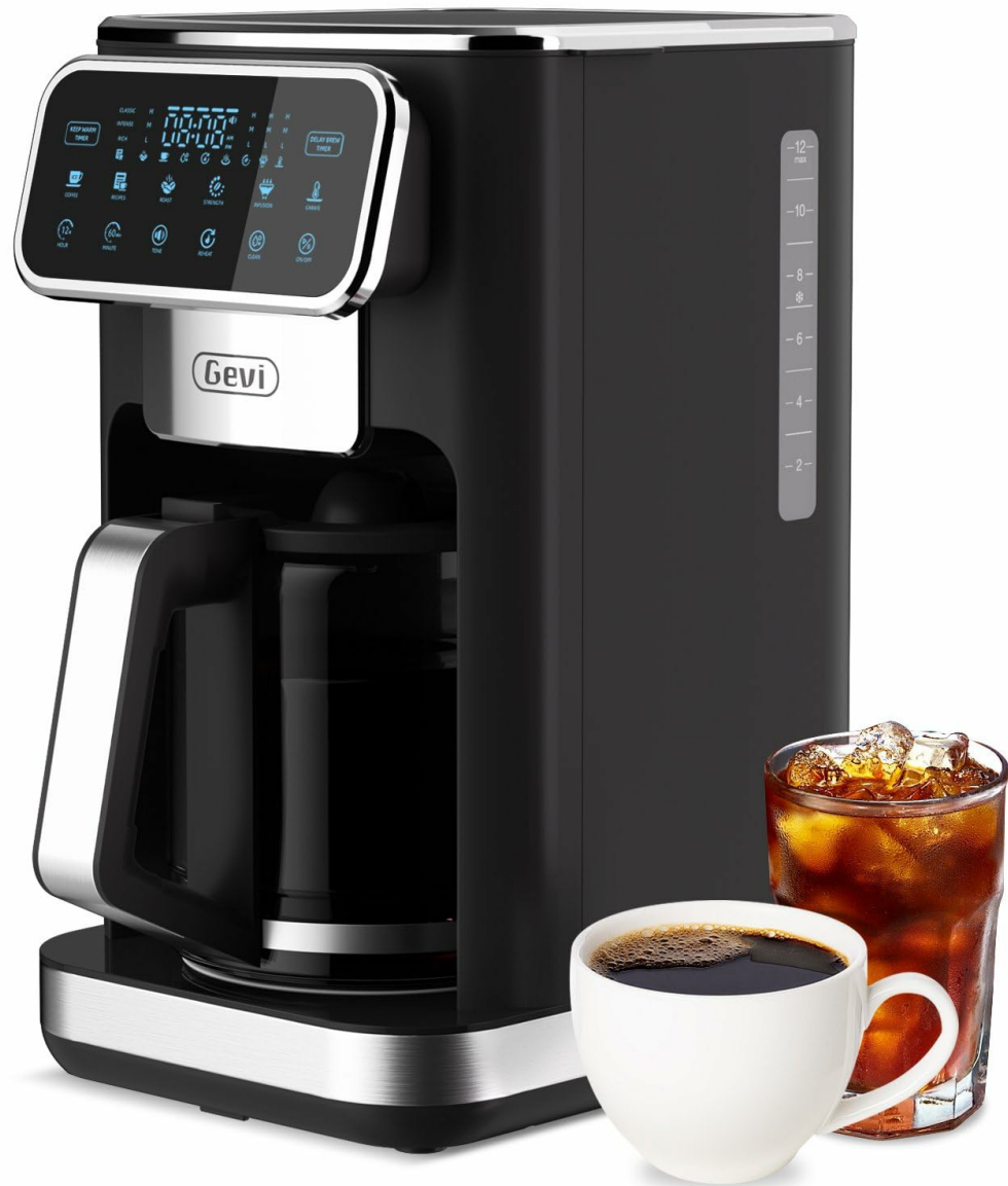
Image: The Gevi 12 Cup Programmable Drip Coffee Maker, showcasing its sleek design and digital display, ready to brew coffee.