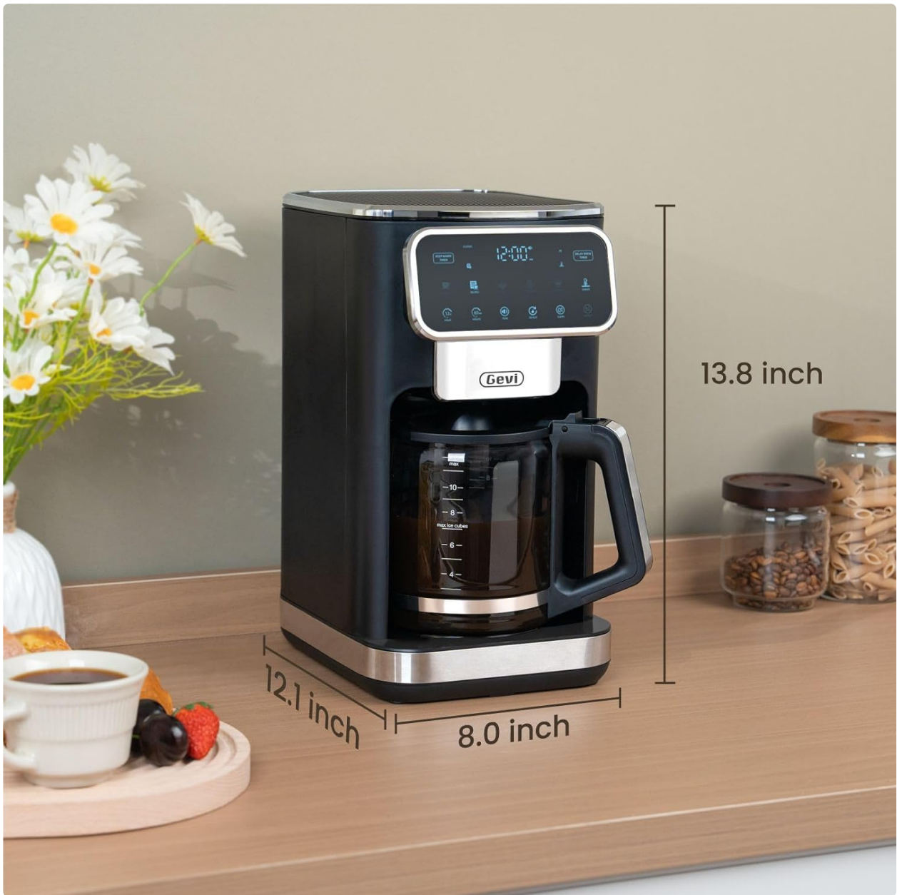
Image: The Gevi coffee maker with its physical dimensions (depth, width, height) clearly indicated.