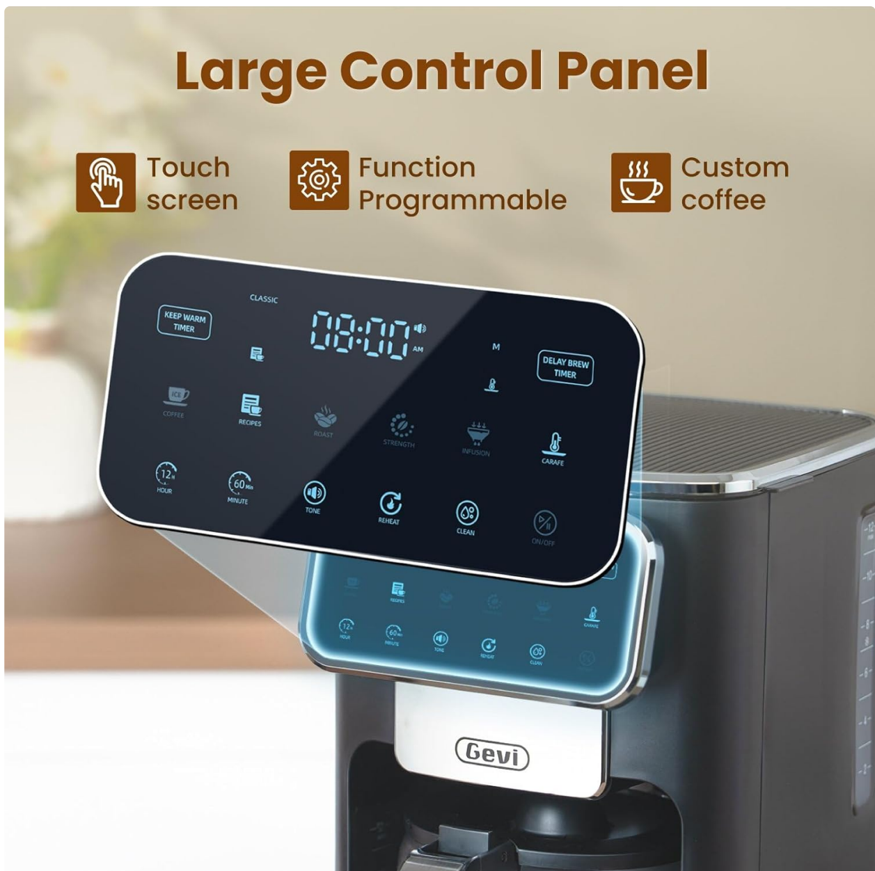
Image: A detailed view of the coffee maker's large touch control panel, showing various settings and the digital clock display.