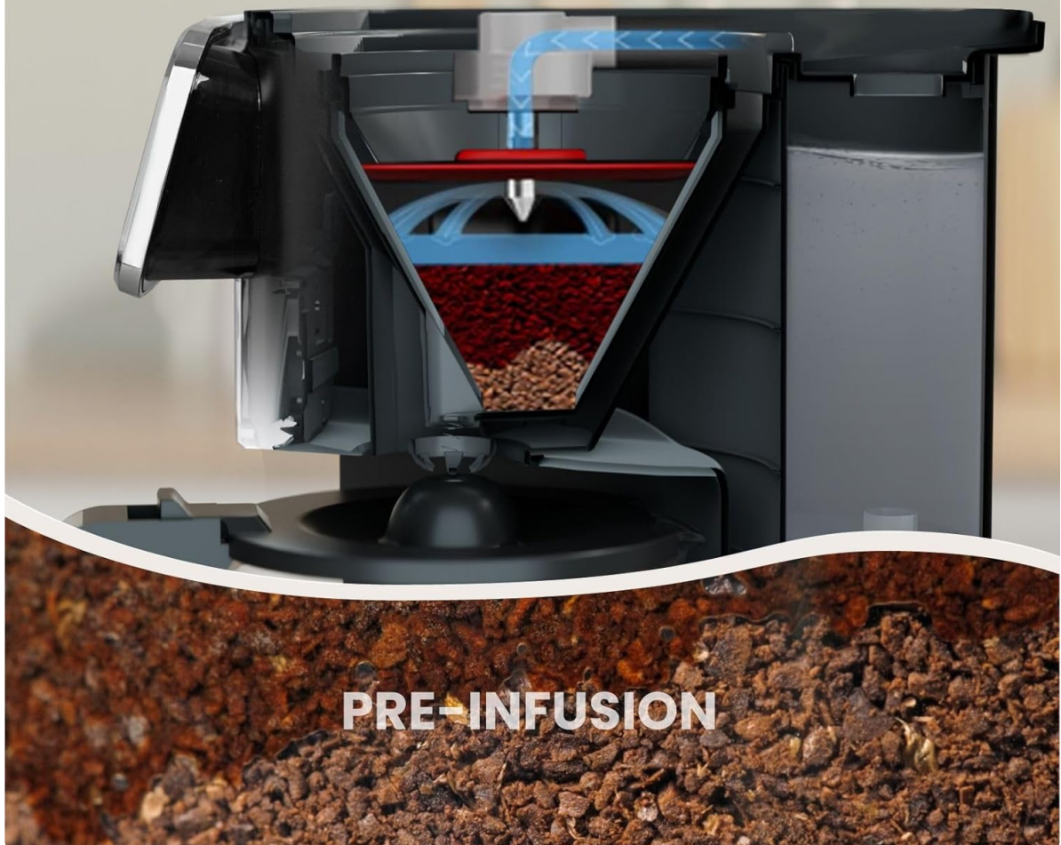
Image: A cutaway diagram showing the pre-infusion process, where water is evenly distributed over coffee grounds for deep extraction.

Ensure the coffee grounds are evenly extracted