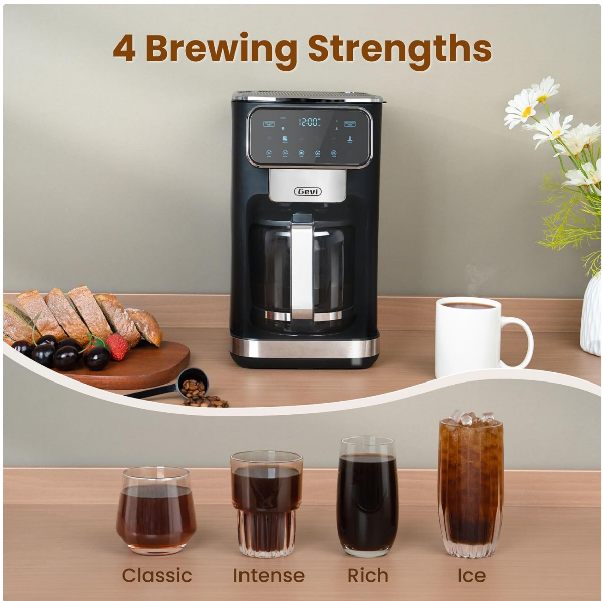
Image: Four different coffee preparations: Classic, Intense, Rich, and Iced, demonstrating the various brewing strengths and options.