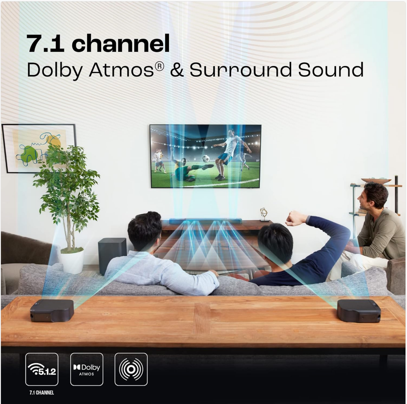
Image: A visual representation of the recommended speaker placement for the JBL Bar 800 Pro to achieve immersive 7.1 channel Dolby Atmos and surround sound.