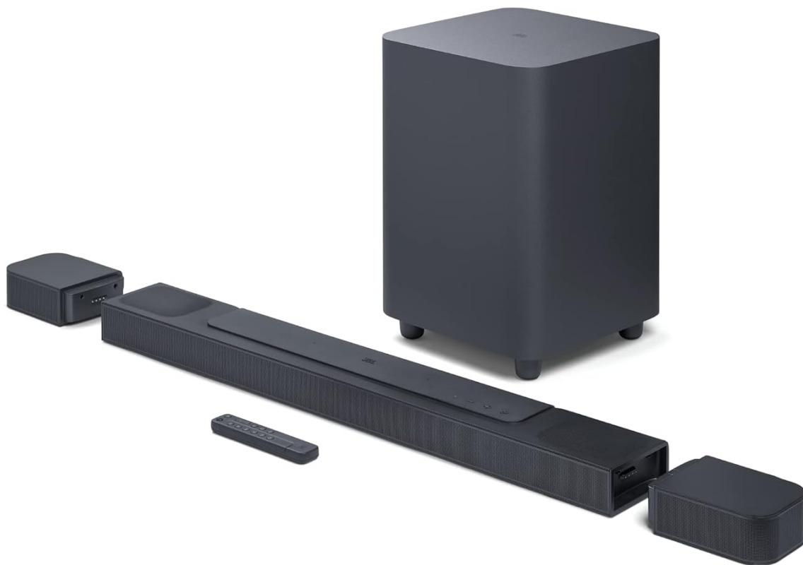
Image: The complete JBL Bar 800 Pro system, showcasing the main soundbar, wireless subwoofer, and the two compact detachable surround speakers.

The JBL Bar 800 Pro system consists of a main soundbar, a wireless subwoofer, and two detachable wireless surround speakers. Familiarize yourself with the main components: