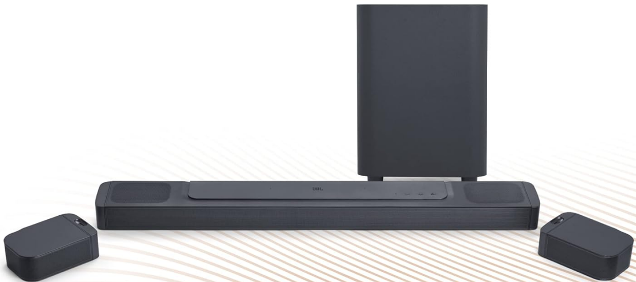
Image: The JBL Bar 800 Pro components separated, illustrating the soundbar, subwoofer, and the two detachable surround speakers, emphasizing the system's 720W total output power.