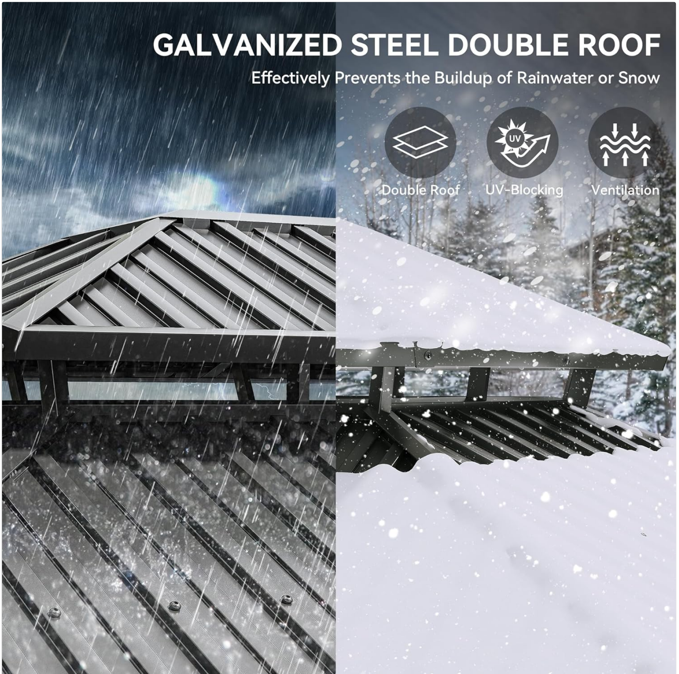
Image: Illustration of the galvanized steel double roof, demonstrating its effectiveness in preventing rainwater or snow buildup, UV-blocking, and ventilation.