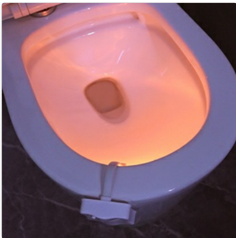
Image: The flexible arm of the toilet light, which allows for easy adjustment and removal for cleaning.