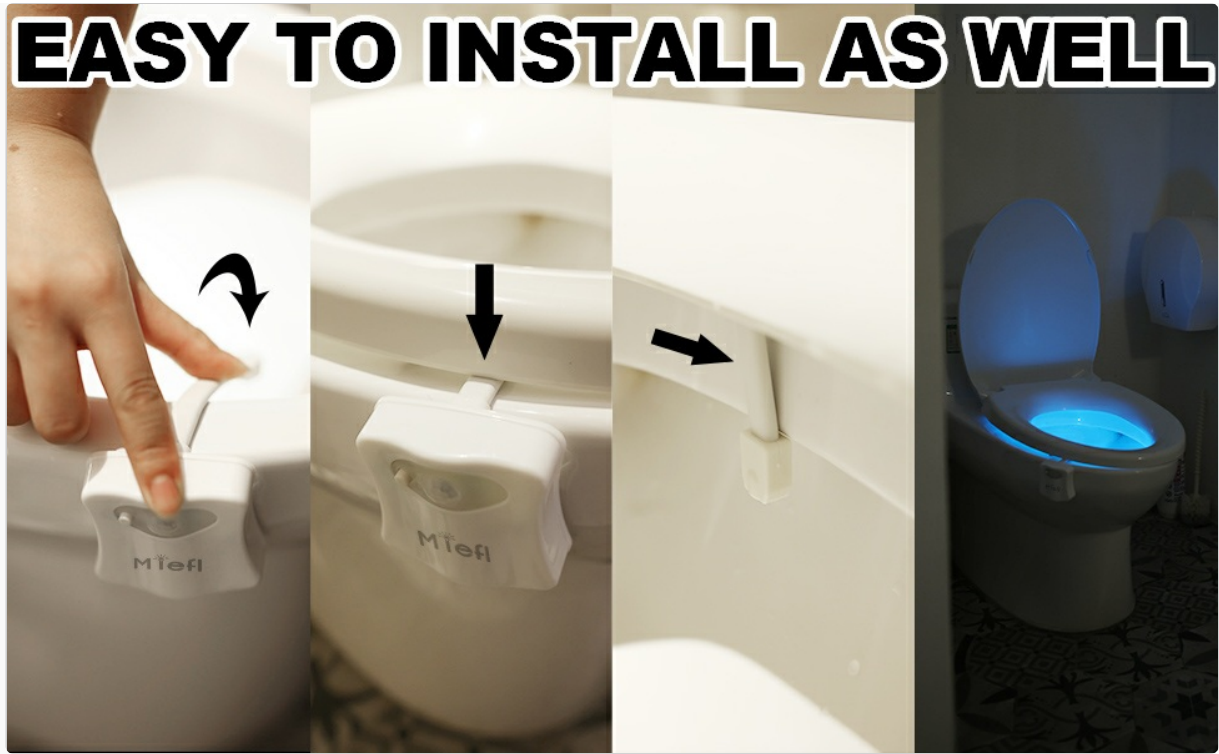
Image: A visual guide demonstrating the simple steps to attach the MIEFL LED Toilet Light to the toilet rim, ensuring the light is inside the bowl and the sensor is outside.