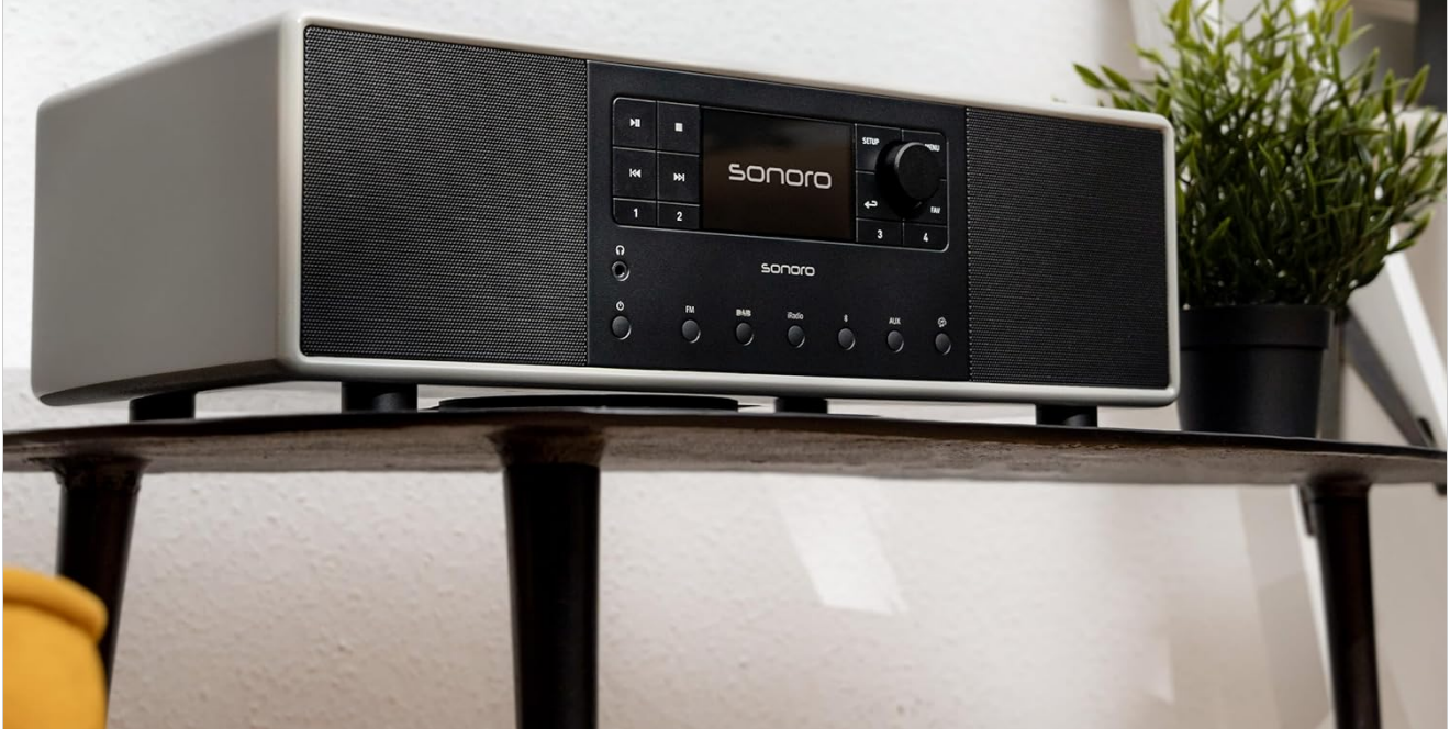
Image: Front view of the sonoro Primus, displaying the central screen, control knobs, and various buttons for media playback and source selection.