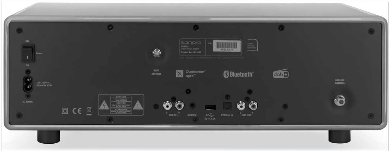
Image: Rear panel of the sonoro Primus, highlighting the power input and other connectivity options like AUX-in, Optical-in, and antenna connections.

Connect the provided power adapter to the AC IN port on the rear of the unit. Plug the other end into a suitable wall outlet. The unit will enter standby mode.