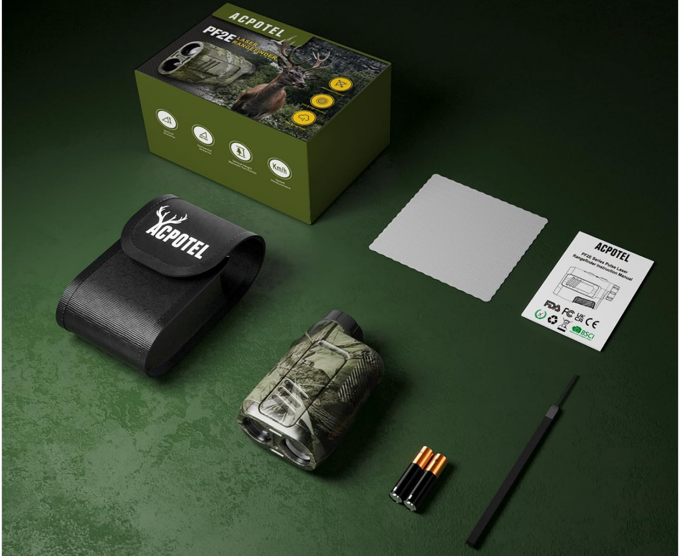
Image: All components included in the product packaging: the rangefinder, two AAA batteries, a lanyard, a storage bag, and the user manual.