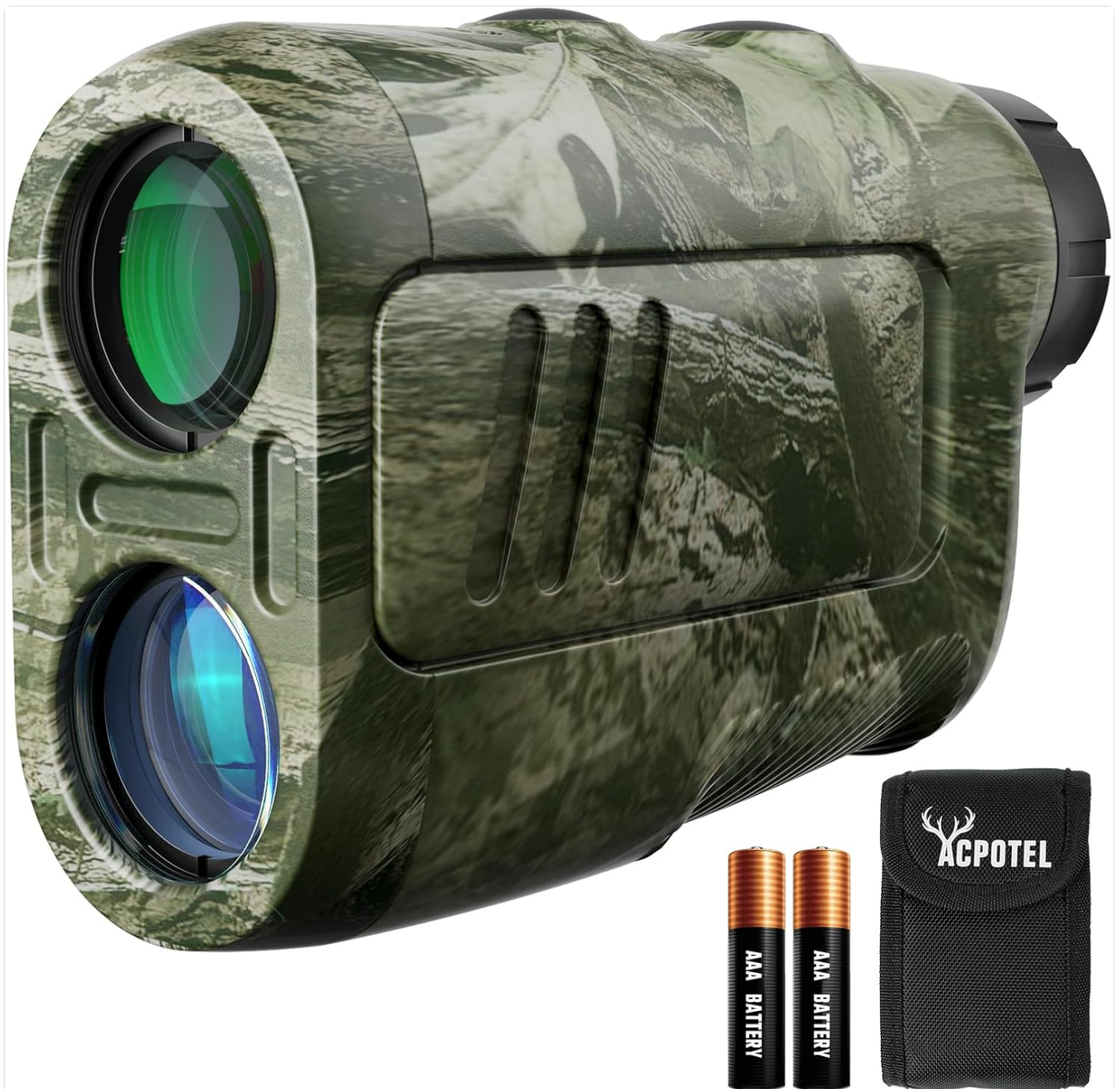
Image: The ACPOTEL Precision Hunting Range Finder, showcasing its camouflage design, lenses, and included accessories (batteries and pouch).