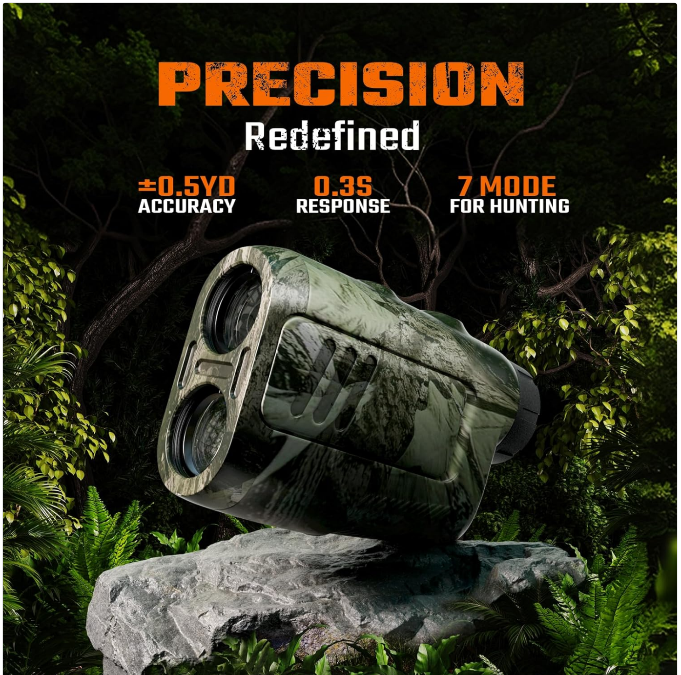
Image: Graphic highlighting the rangefinder's key features: \pm 0.5 yd accuracy, 0.3s response time, and 7 modes for hunting.