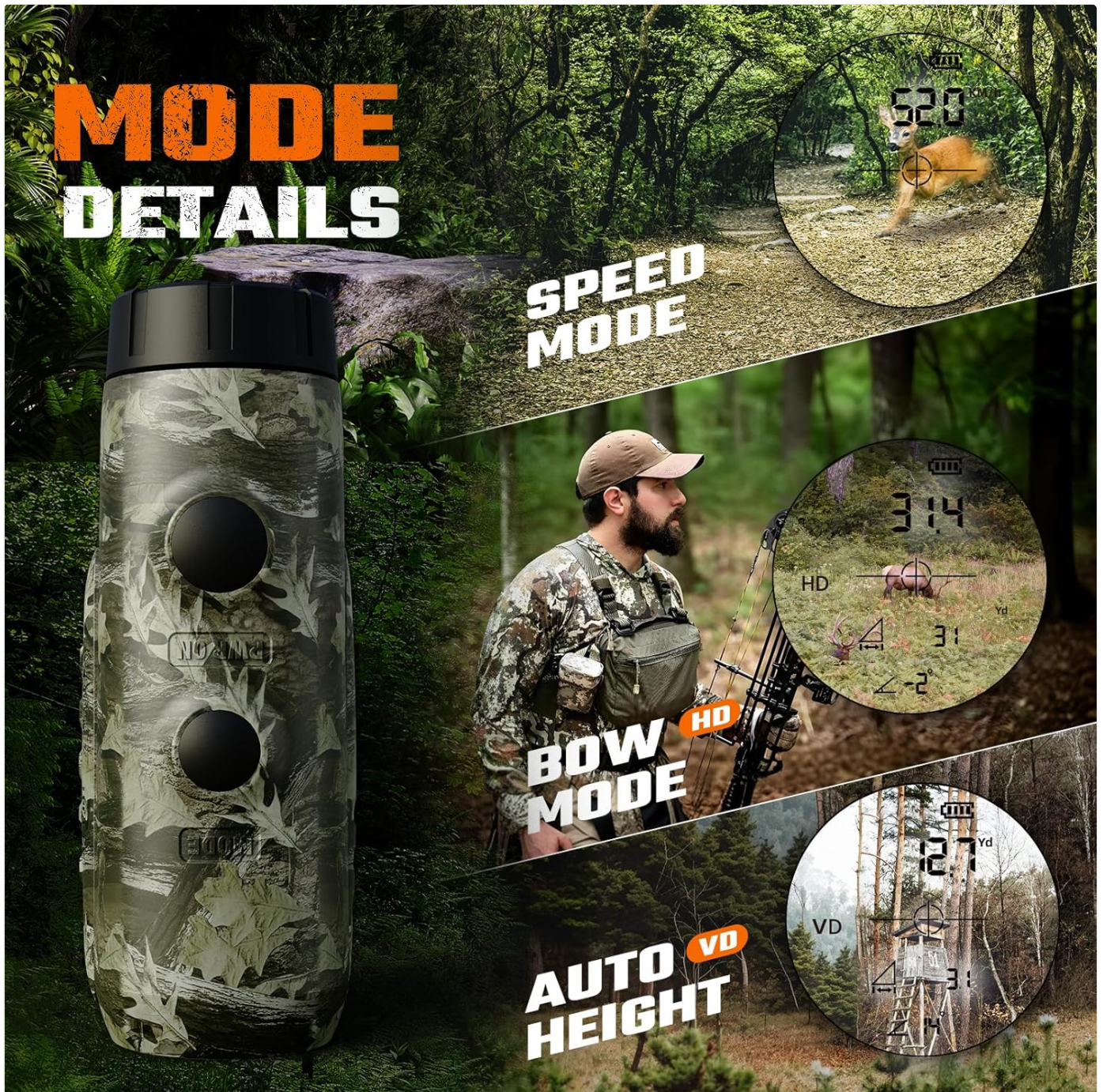
Image: A collage showing the rangefinder's various modes in action, including Speed Mode, Bow Mode, and Auto Height Mode, with corresponding display readouts.