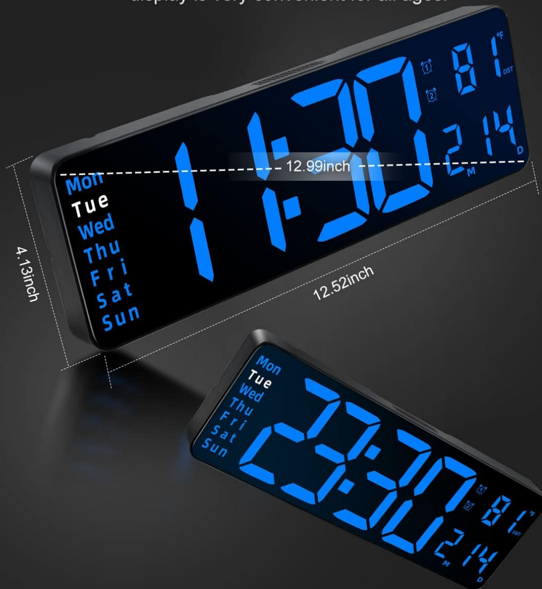
Image: The JoFomp 13-inch Digital LED Alarm Clock displaying the time, date, day of the week, and temperature. The clock is shown in a desk setup.

The large digital clock's large display is very convenient for all ages.