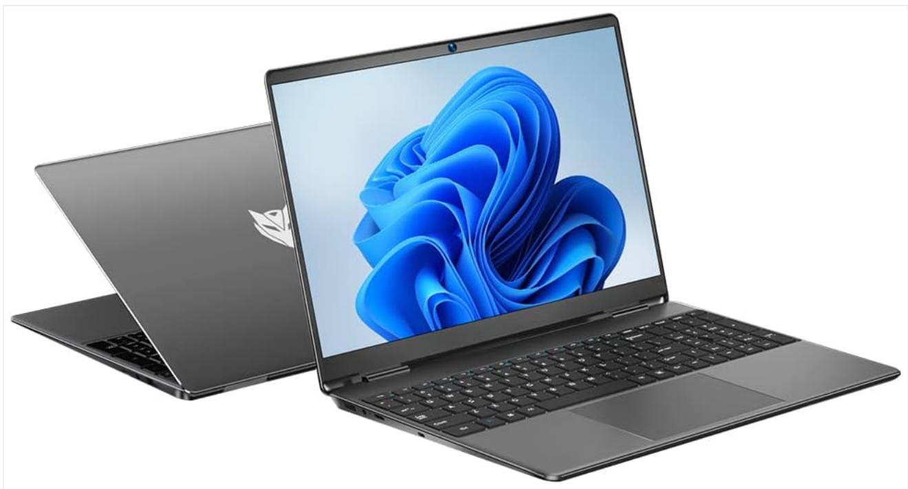
Image: The Bmax X15 Plus laptop displayed open, showing the screen and keyboard.