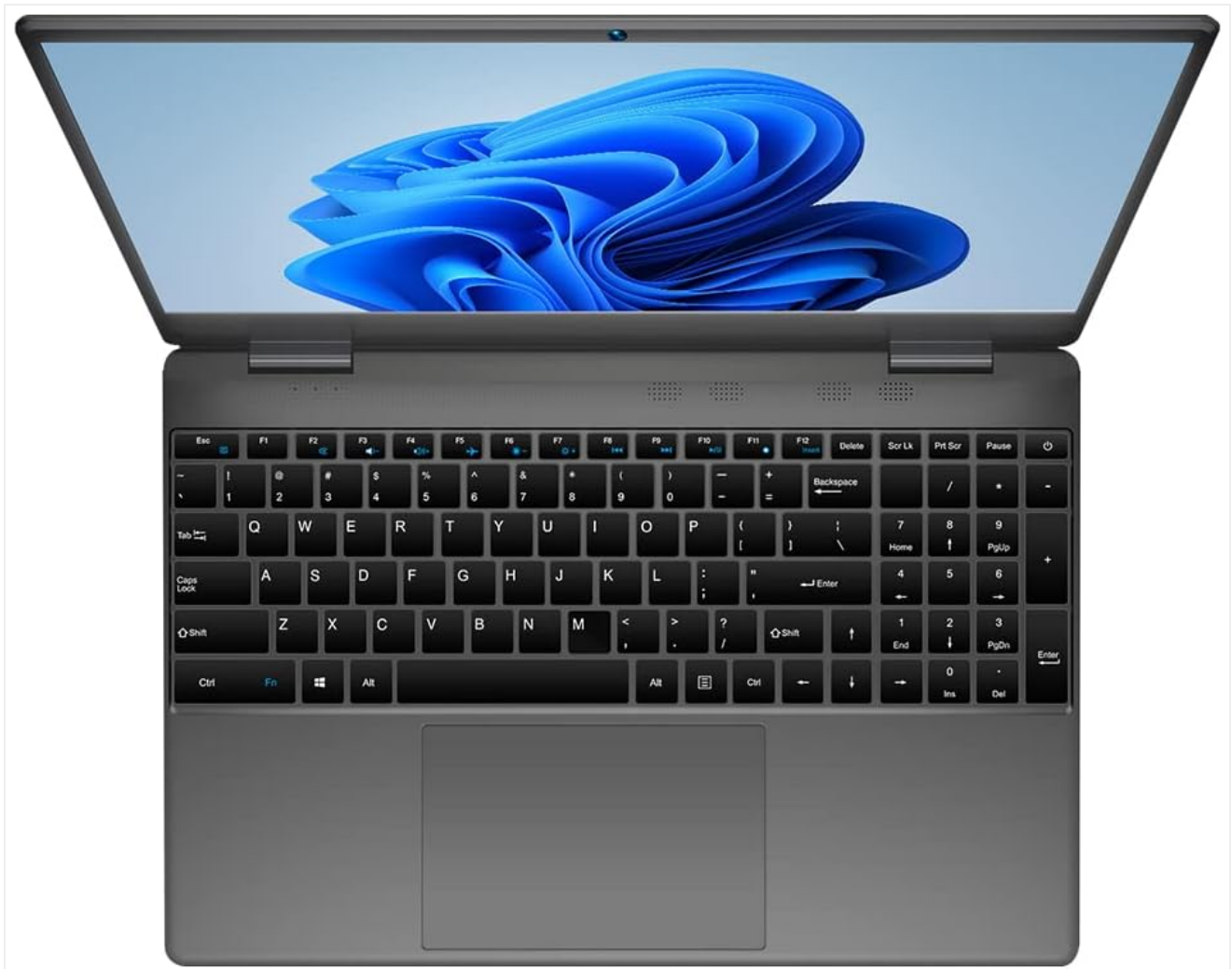
Image: Top-down view of the Bmax X15 Plus laptop, showcasing the full keyboard with numeric pad and large touchpad.

The Bmax X15 Plus features a full-sized keyboard with a numeric keypad and a large trackpad for comfortable navigation and input.