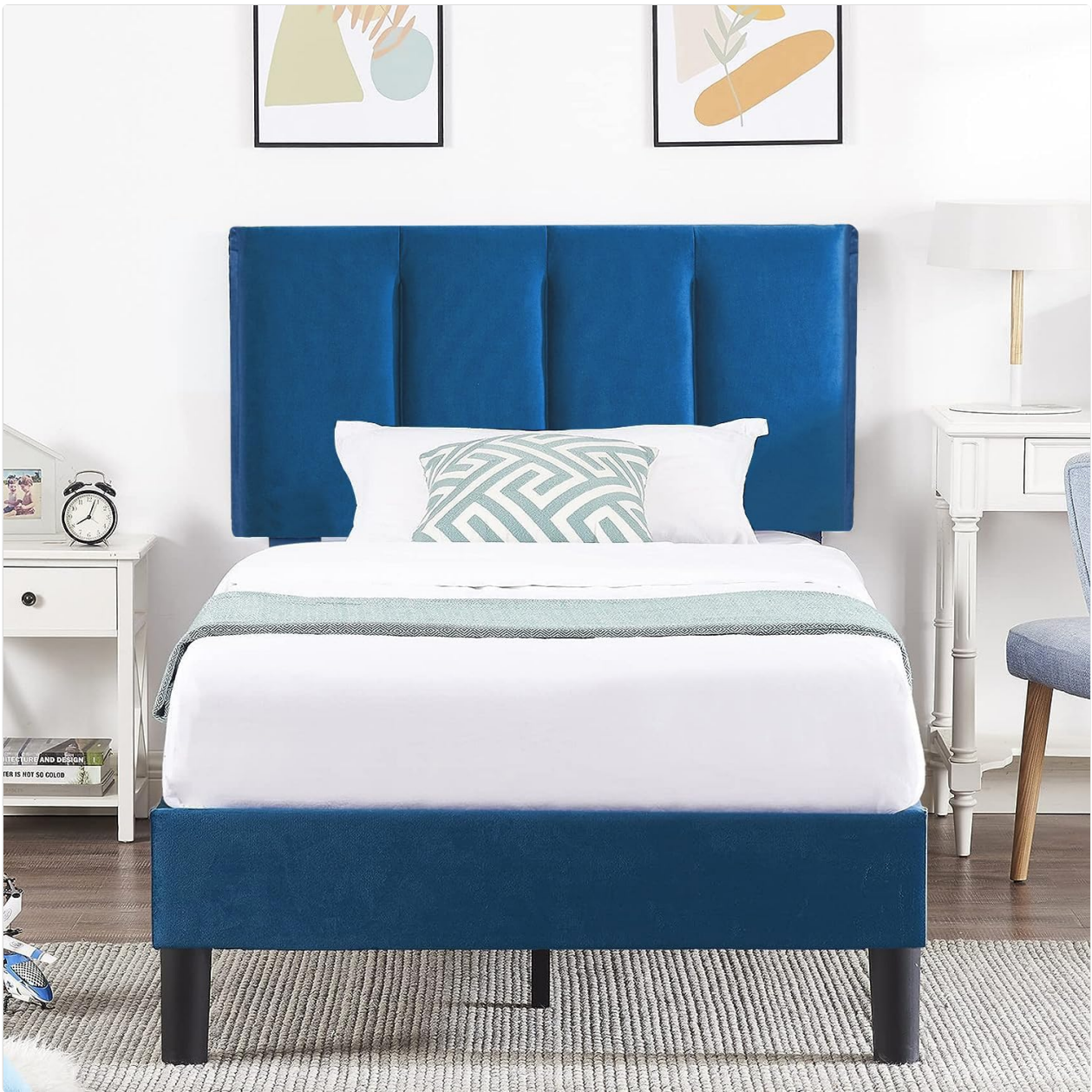
Image 1.1: Fully assembled VECELO Twin Size Upholstered Platform Bed Frame, featuring a blue velvet finish and an adjustable headboard, shown with bedding in a bedroom setting.