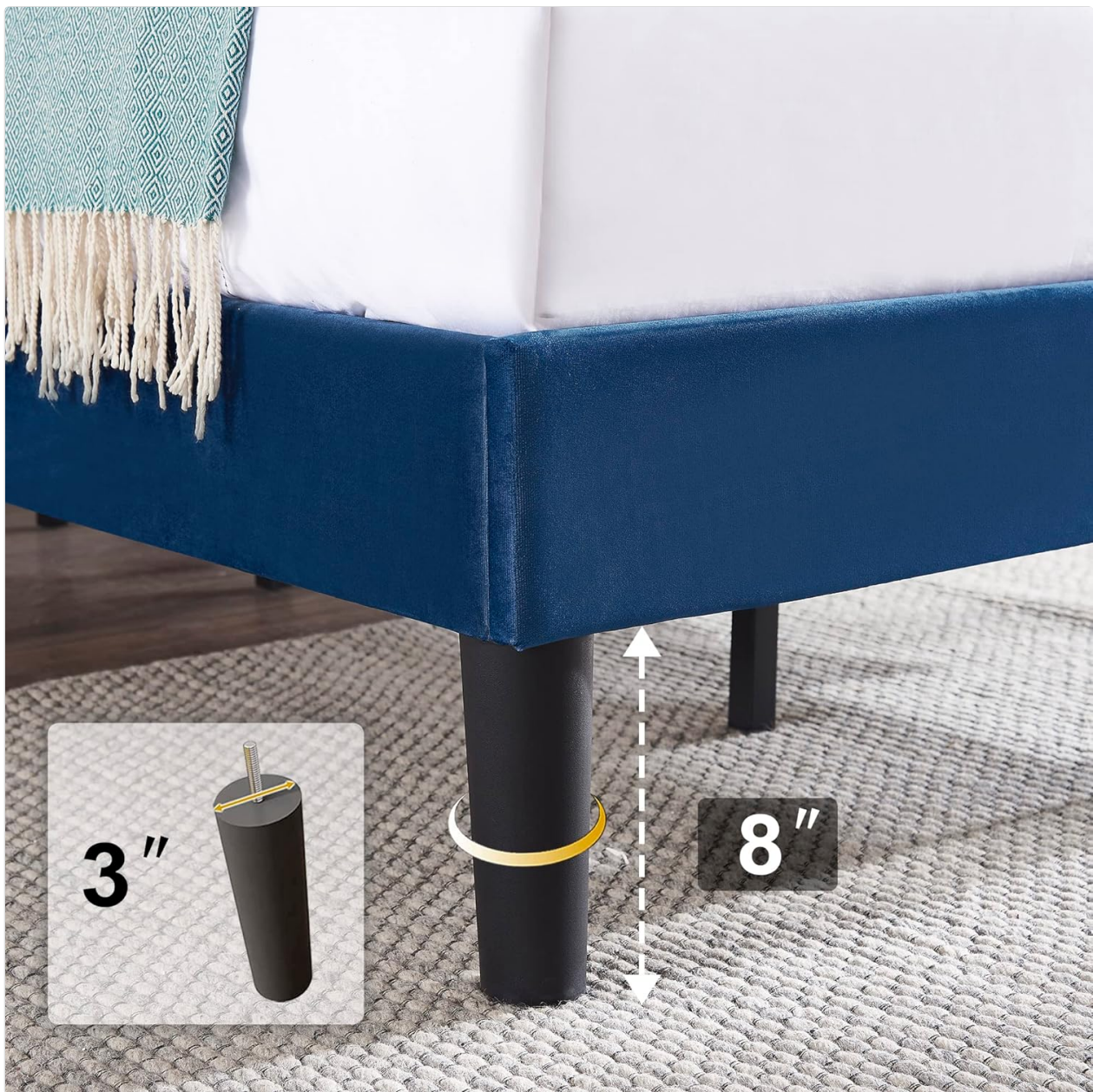
Image 5.3: Illustration of the bed leg height, indicating approximately 8 inches of under-bed clearance for storage or robotic vacuum access.