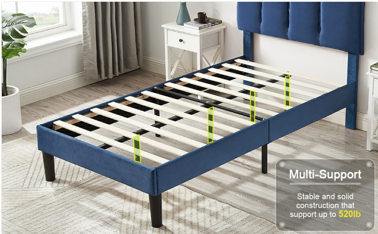
Image 4.4: Visual representation of the multi-support system, showing the robust wooden slats and central metal support designed to hold up to 520 lbs.