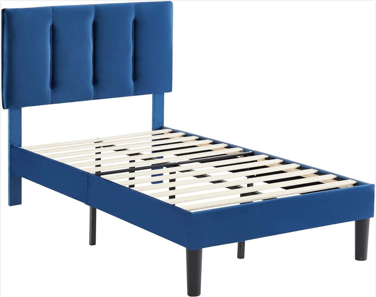
Image 4.2: The VECELO Twin Size Bed Frame structure, displaying the metal framework and wooden slats designed for mattress support without a box spring.