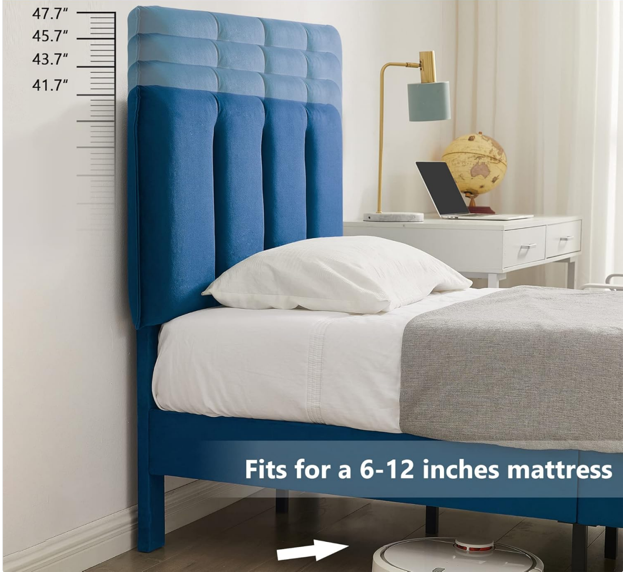
Image 5.1: Visual guide demonstrating the four adjustable height options for the upholstered headboard, accommodating various mattress thicknesses.