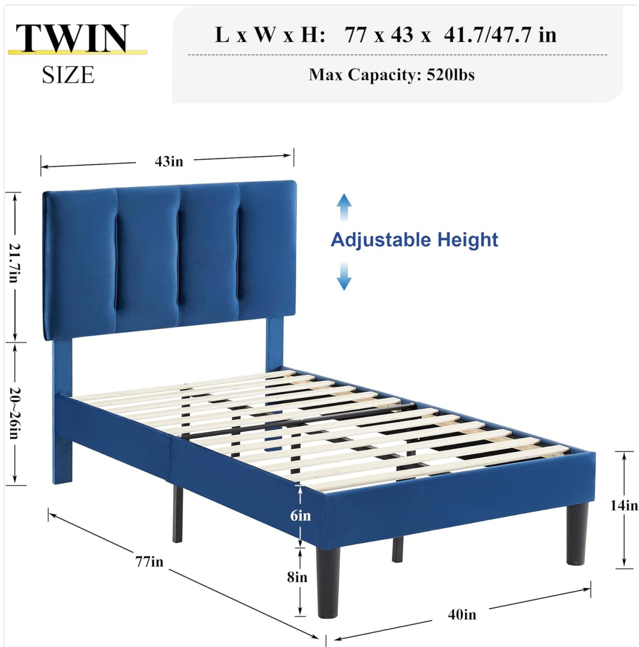
Image 4.1: Dimensional diagram of the VECELO Twin Size Bed Frame, illustrating overall length, width, height, and adjustable headboard range. Max capacity is 520 lbs.

Carefully unpack all components from the box. Lay them out on a soft, clean surface. Refer to the included assembly instruction sheet for a detailed list of parts and hardware.