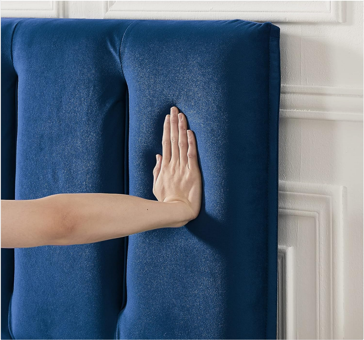
Image 5.2: A hand demonstrating the plush, high-resilience memory foam padding within the velvet upholstered headboard, emphasizing comfort.