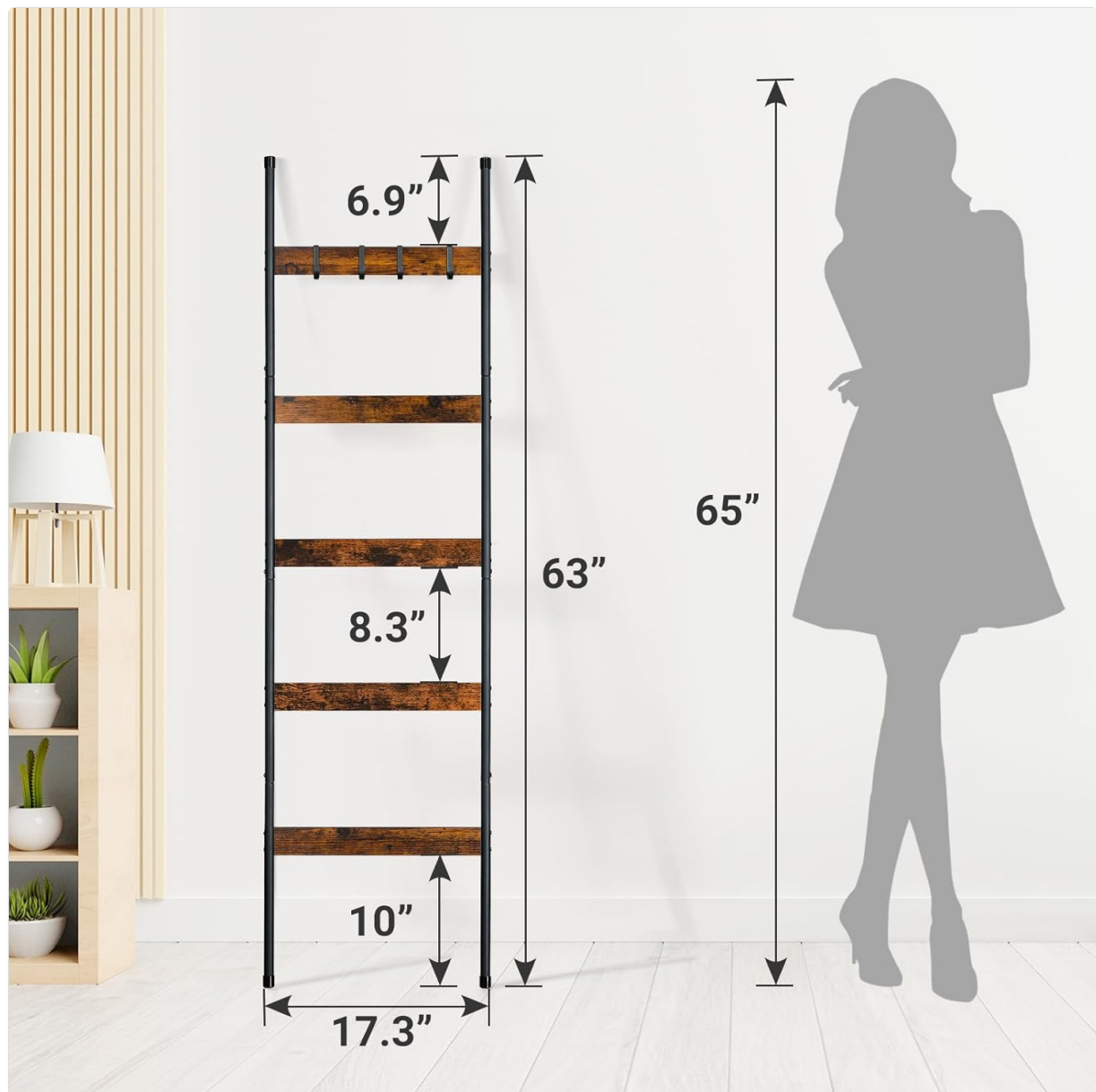
Image: Dimensional overview of the ELYKEN Blanket Ladder.