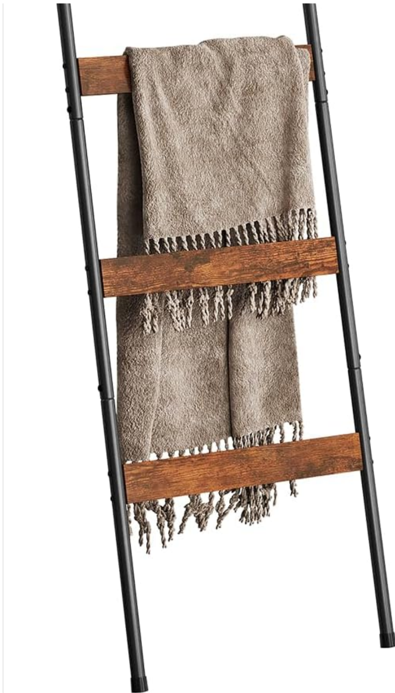
Image: The ELYKEN Blanket Ladder, Model HBL, showcasing its design and capacity for holding various items.