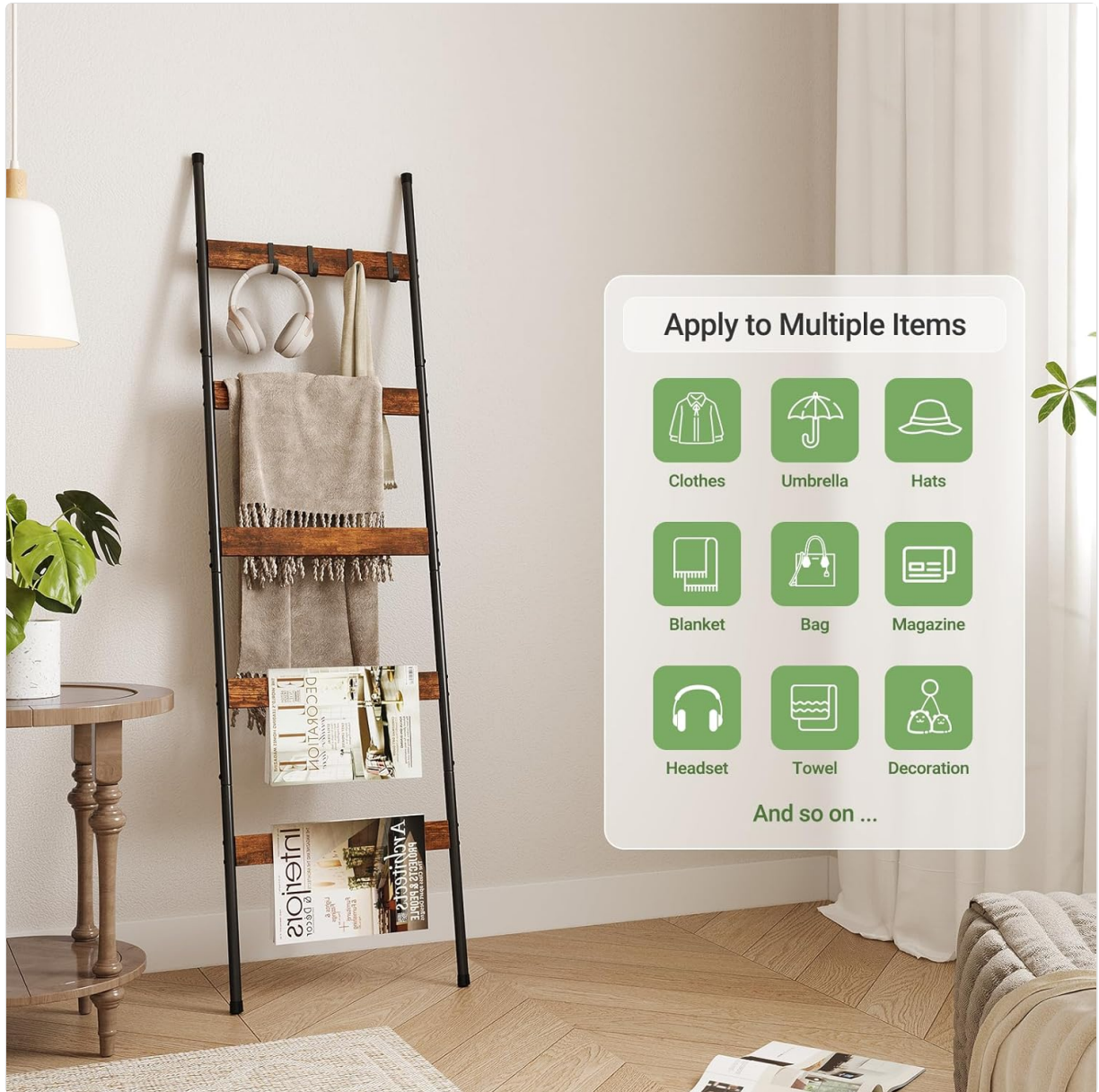
Image: Examples of multiple items that can be stored or displayed on the ELYKEN Blanket Ladder.