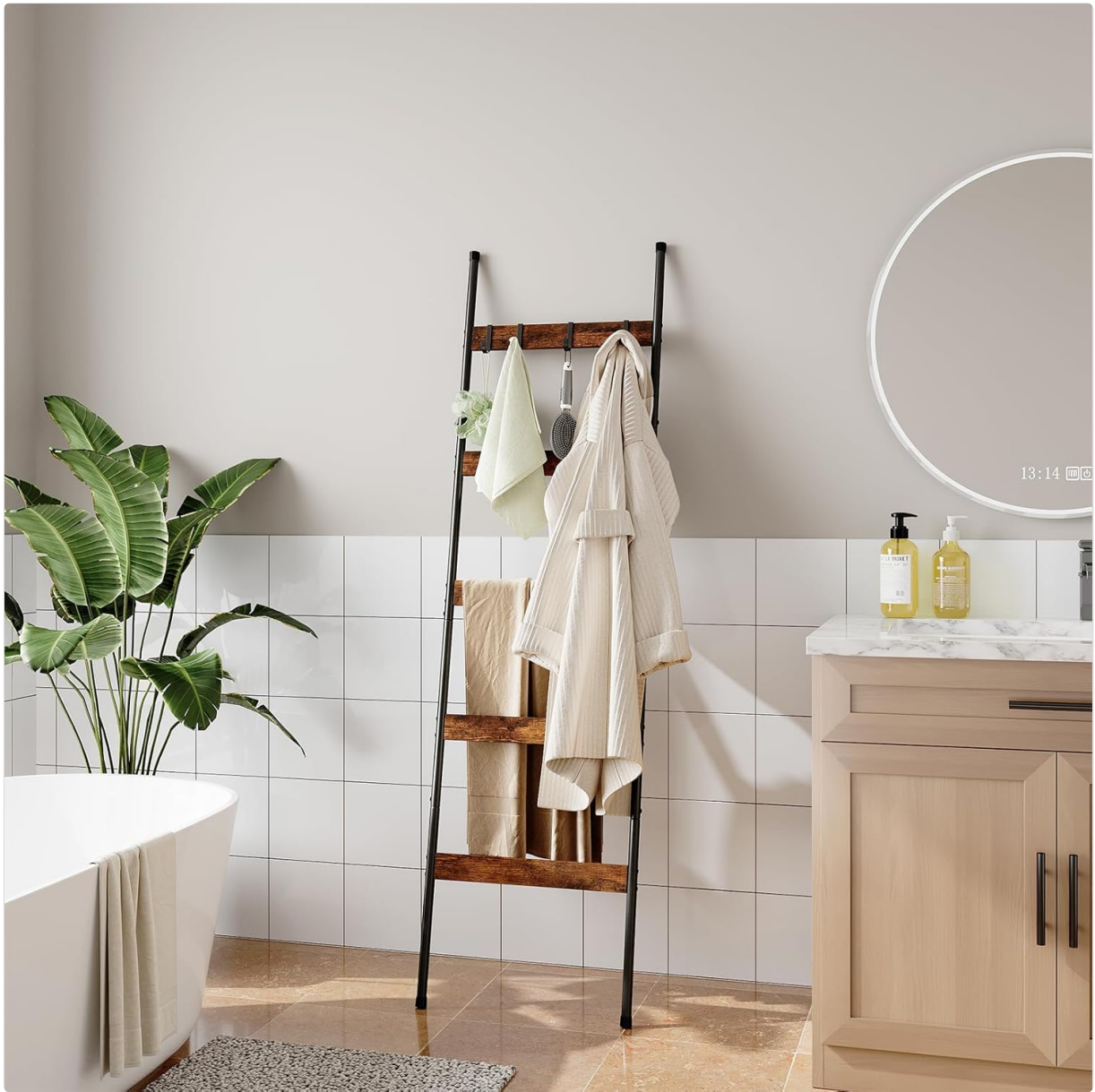
Image: The blanket ladder functioning as a towel rack in a bathroom environment.