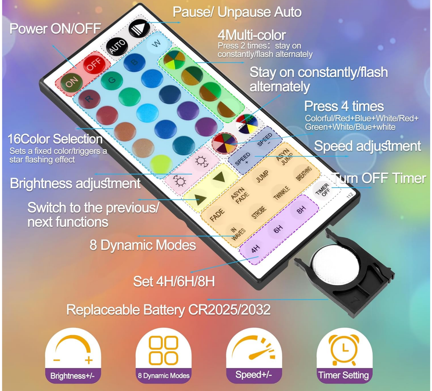
Figure 5.1: Remote Control Layout. This image illustrates the various buttons and functions available on the remote control.