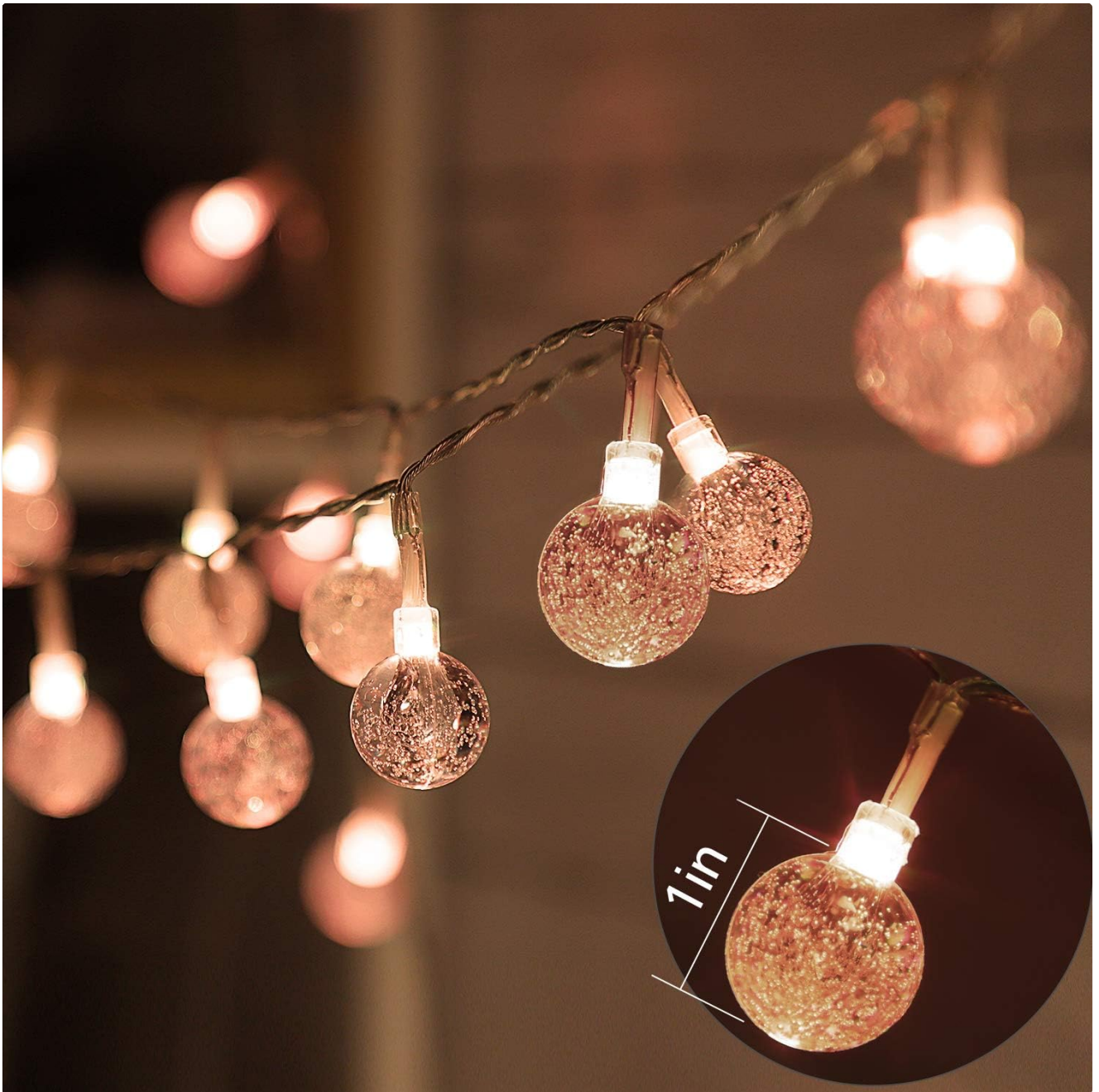
Figure 5.3: Crystal Globe LED. A detailed view of one of the 1-inch crystal globe LED bulbs.