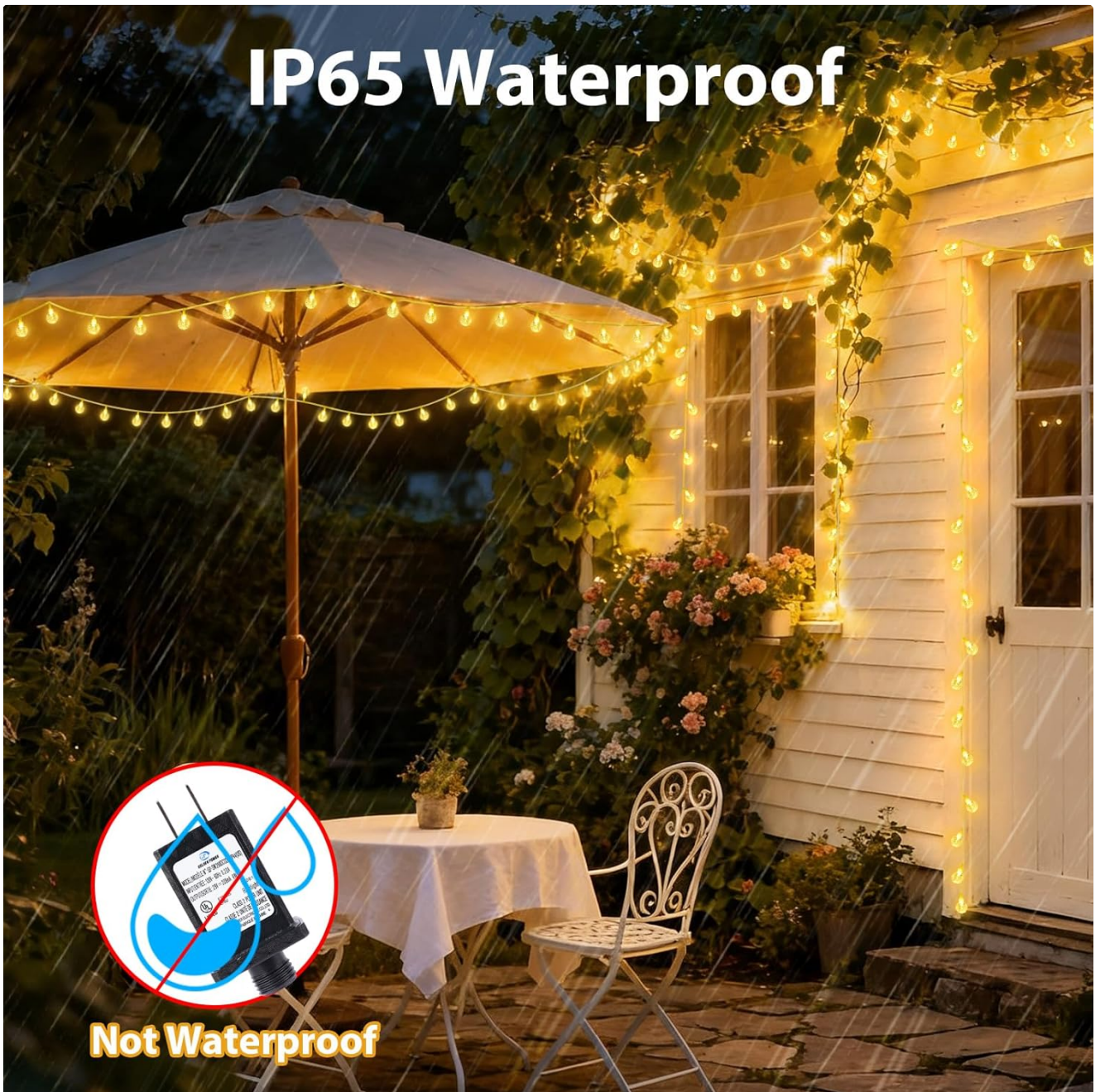
Figure 4.2: Waterproof Rating. This image shows the string lights in an outdoor, rainy environment, highlighting that while the lights are waterproof, the power adapter requires protection from water.