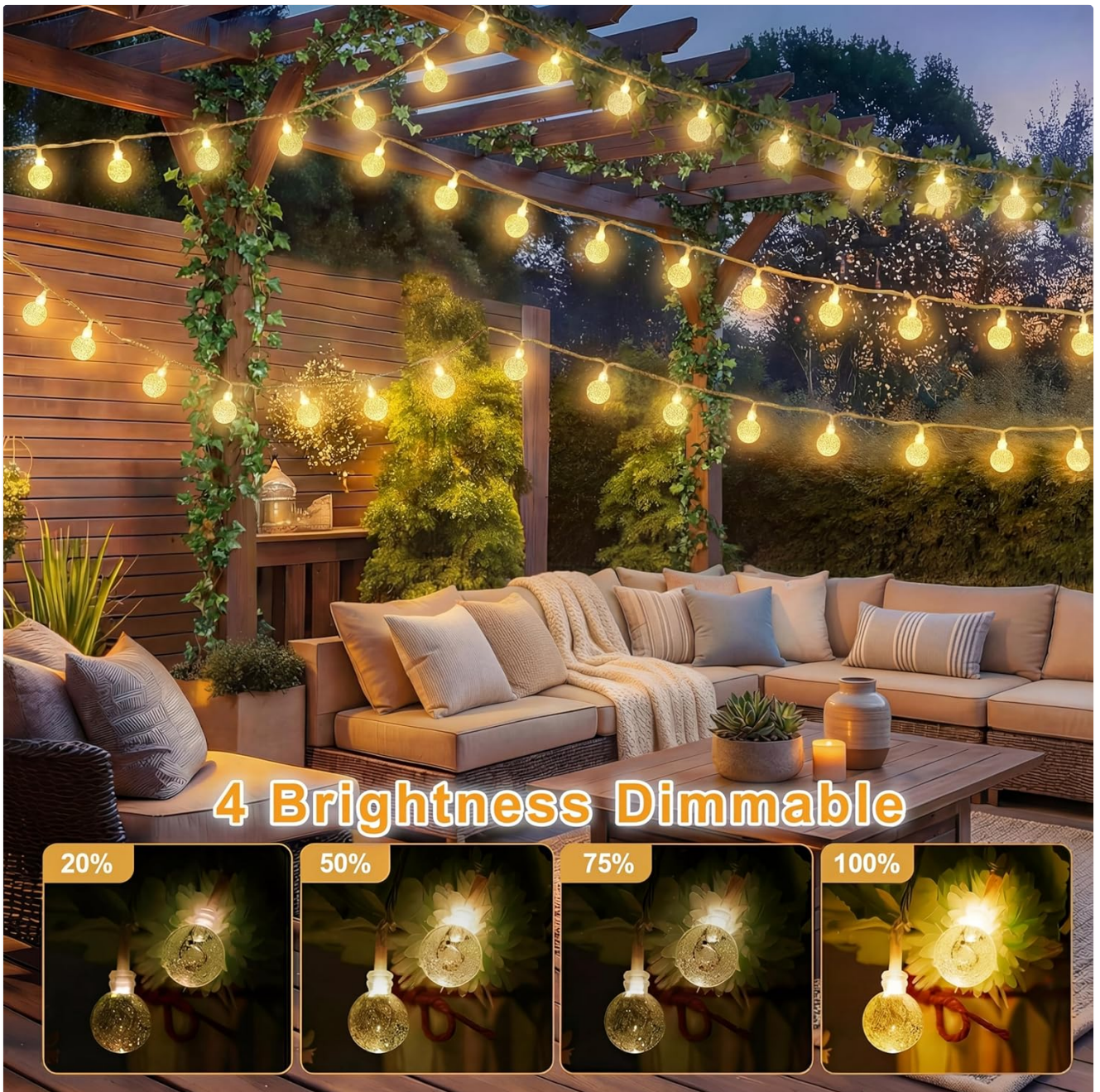
Figure 5.2: Brightness Levels. This image demonstrates the adjustable brightness settings of the string lights.