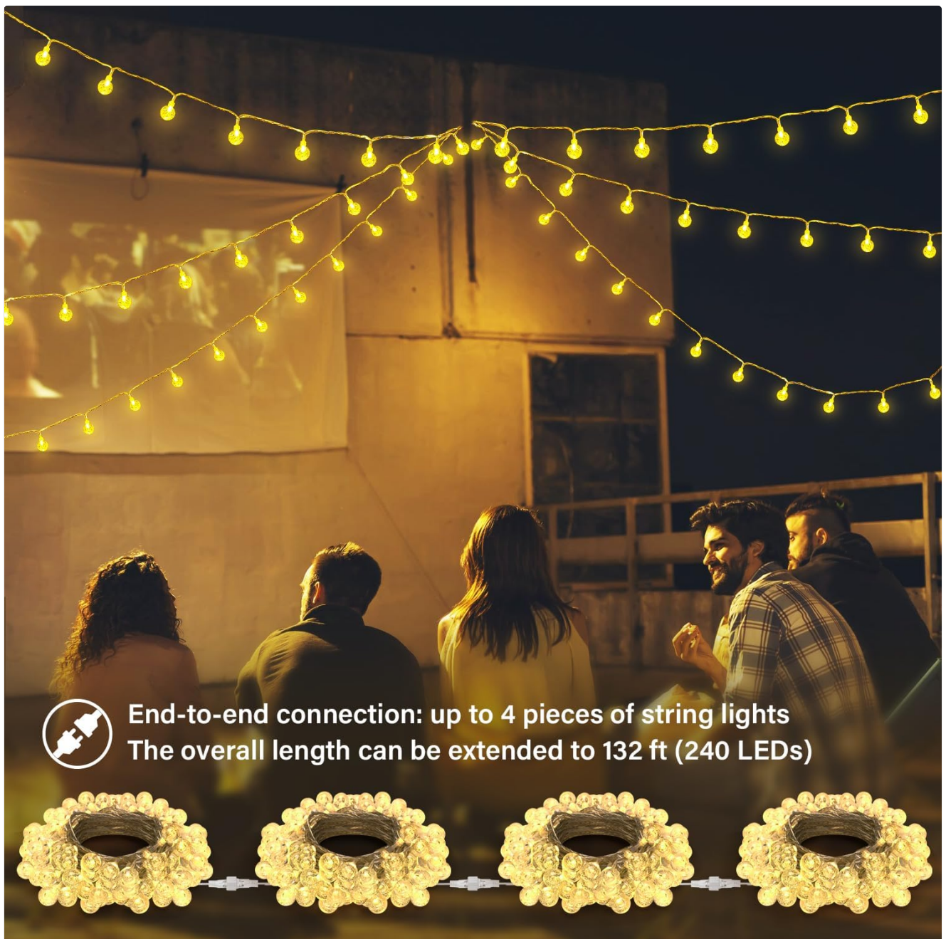
Figure 4.1: End-to-End Connection. This image illustrates how to connect multiple string light sets to extend their total length.