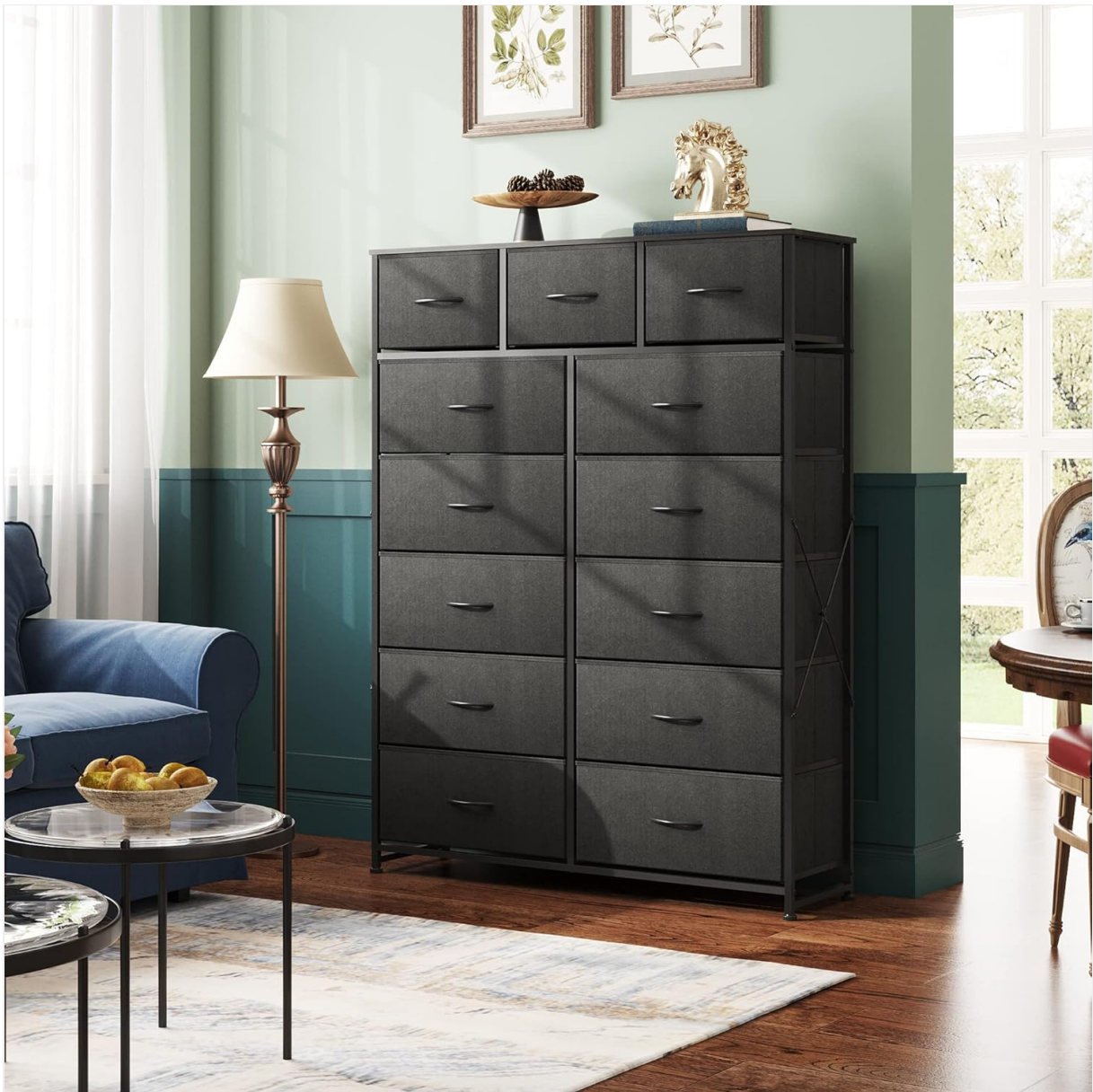
Image: The WLIVE 13-Drawer Storage Organizer Unit positioned in a living room, demonstrating its integration into a home environment.