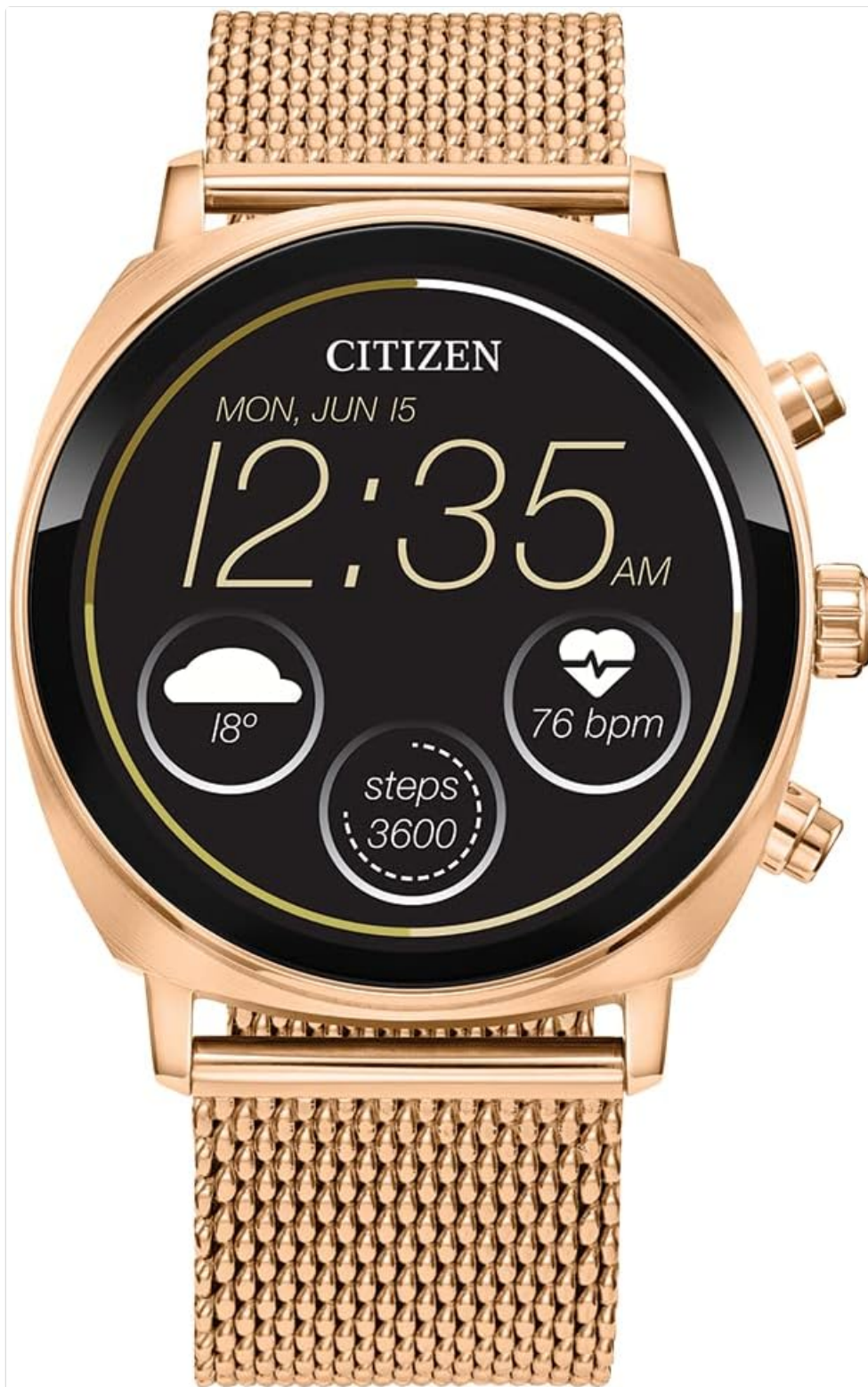
Image: The front view of the Citizen CZ Smart PQ2 Smartwatch, showing a digital watch face with current time, date, weather, step count, and heart rate.