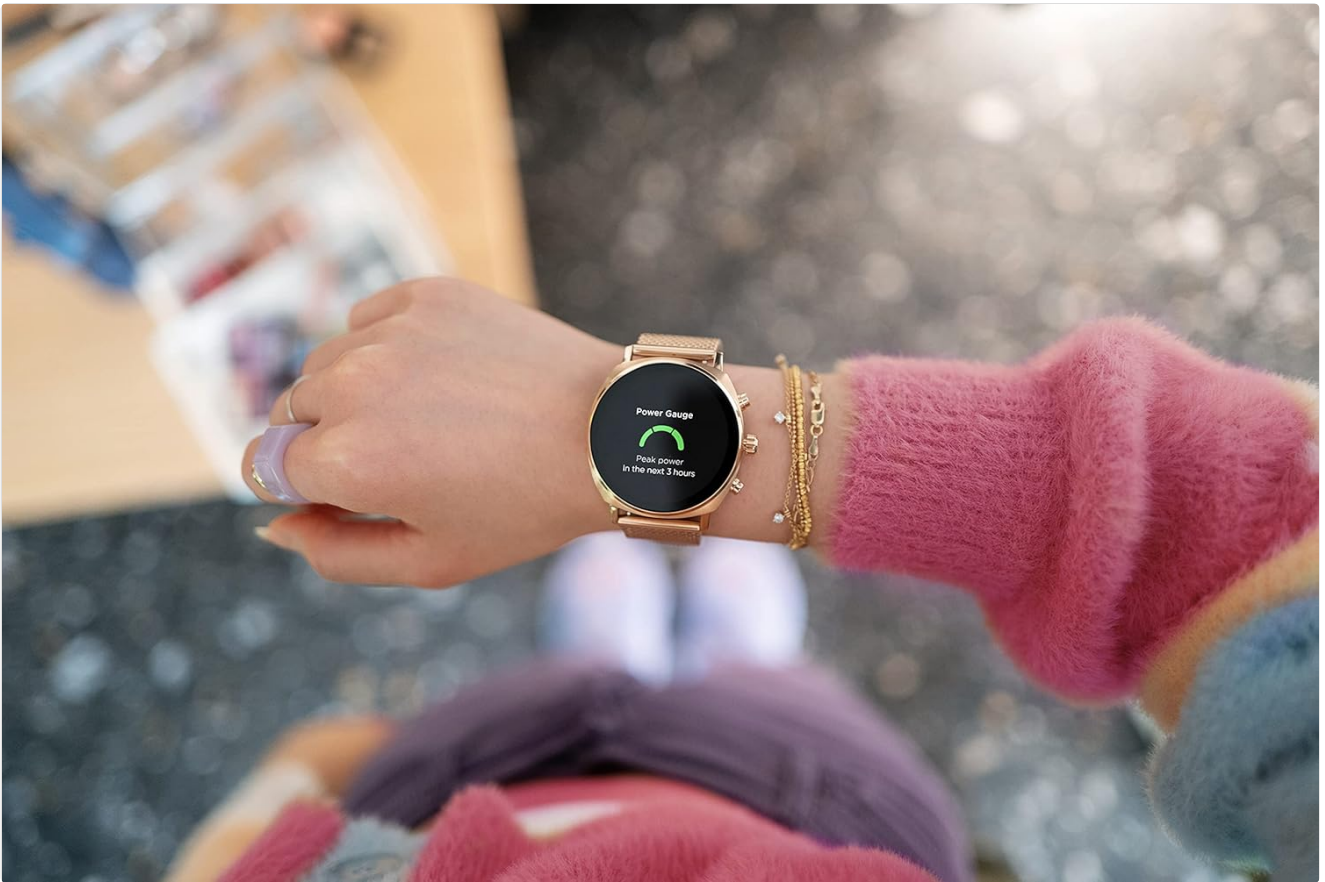
Image: A person wearing the Citizen CZ Smart PQ2 Smartwatch, which displays a 'Power Gauge' indicating 'Peak power in the next 3 hours'.