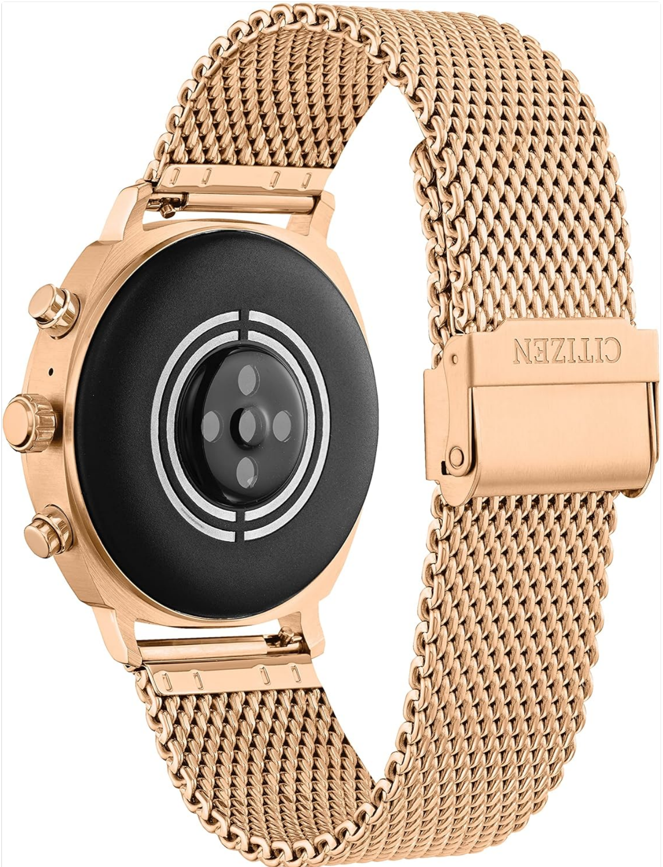
Image: The back view of the Citizen CZ Smart PQ2 Smartwatch, highlighting the heart rate sensor and charging contacts.