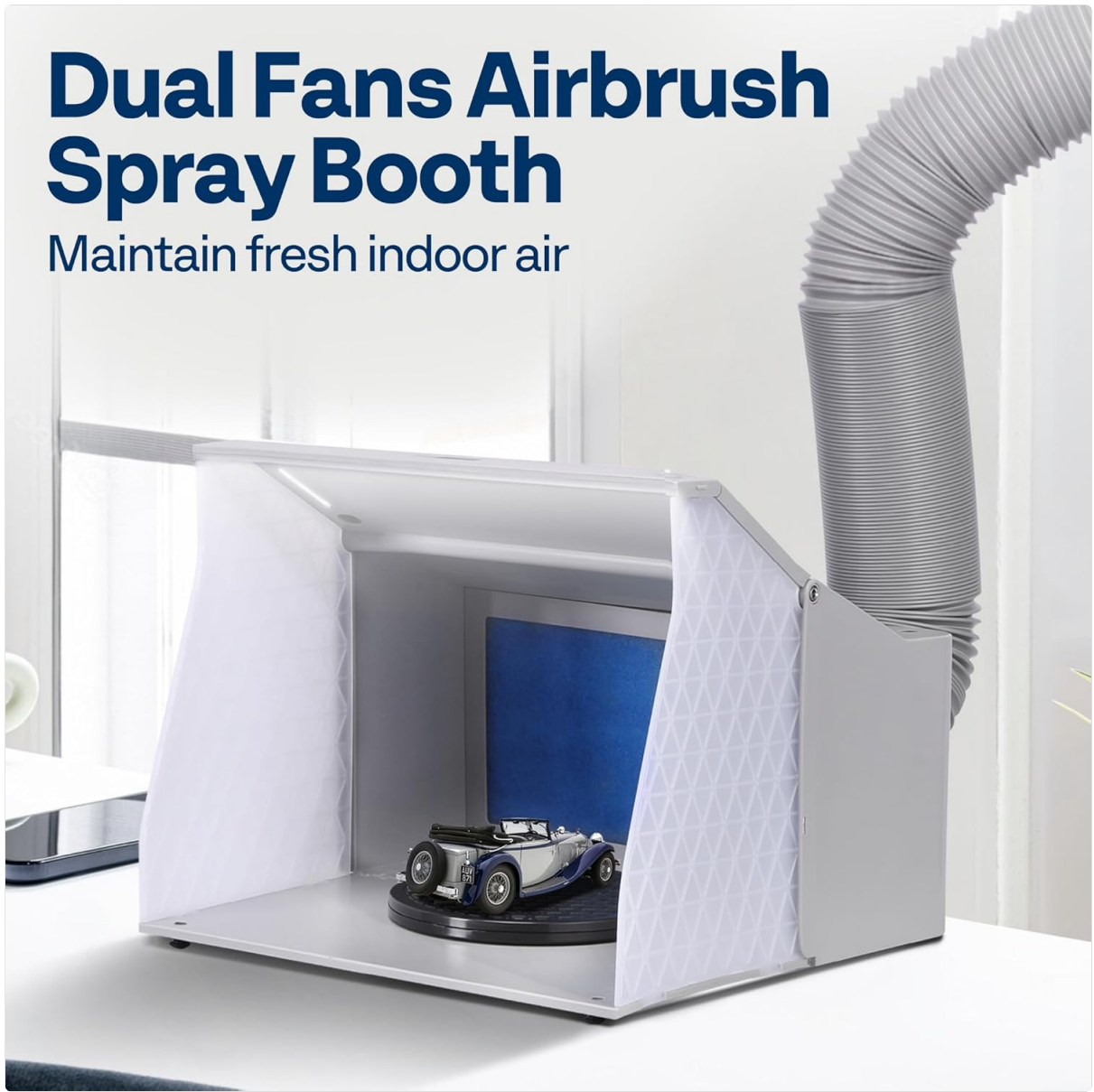
Figure 4.1: Fully assembled VIVOHOME Dual Fans Airbrush Paint Spray Booth with exhaust hose connected to a window. A model car is placed inside the booth on the turntable.