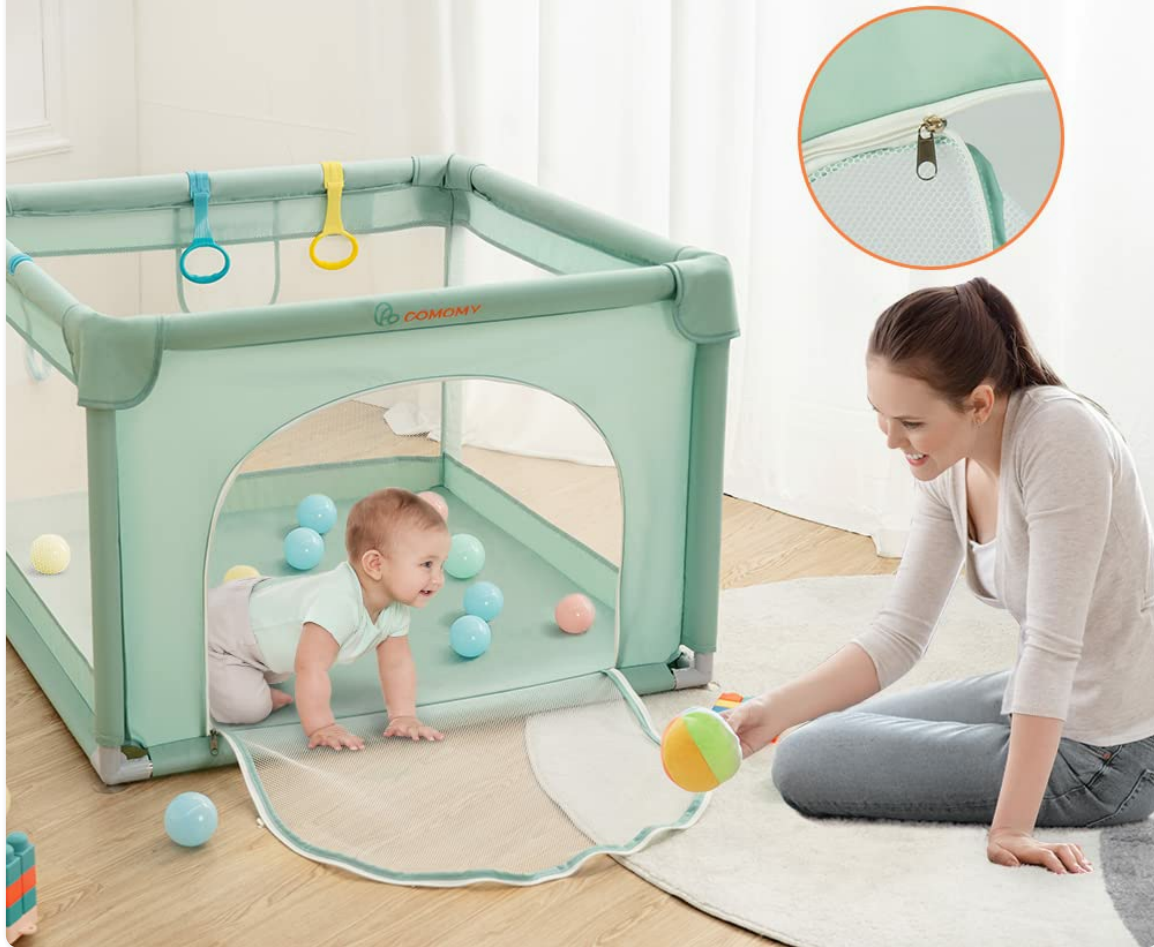
Figure 3: The external zipper door provides convenient access while ensuring child safety.

The door is easy to get in and out for your little one