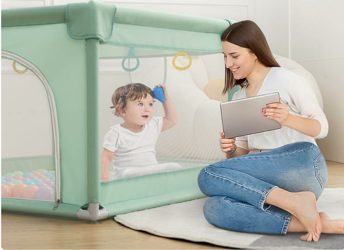
Figure 4: The full mesh design allows for clear visibility and interaction.

See each other through the mesh, your baby feels safer