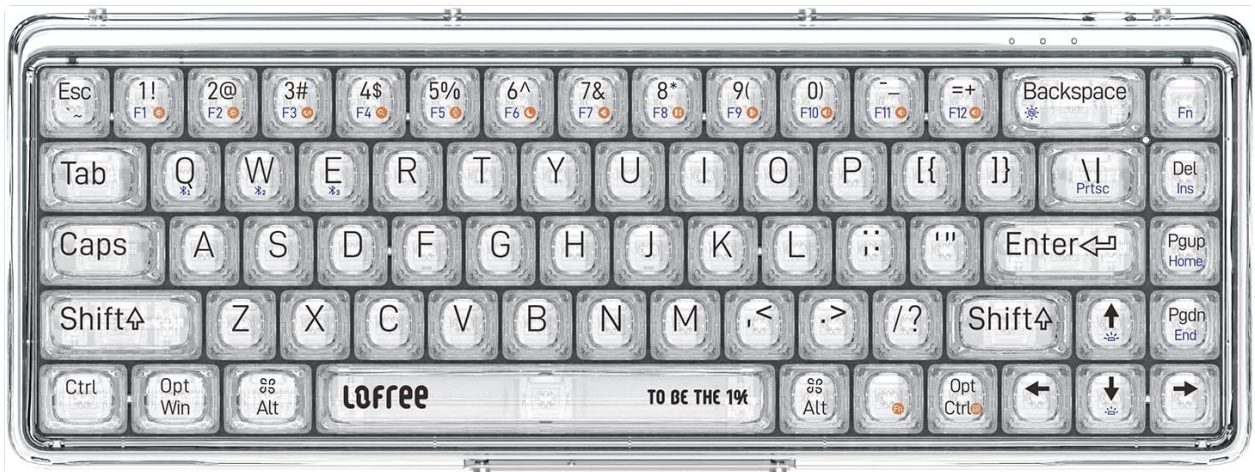
Figure 1.1: The LOFREE 1% Transparent Wireless Mechanical Keyboard, showcasing its full transparent design and 68-key layout.

The LOFREE 1% Transparent Wireless Mechanical Keyboard is a compact 68-key keyboard designed for both aesthetic appeal and high performance. Featuring a transparent PC material chassis and keycaps, it offers a unique visual experience while providing a comfortable and responsive typing experience with pre-lubed Kailh Jellyfish switches. This manual provides essential information for setting up, operating, and maintaining your keyboard.