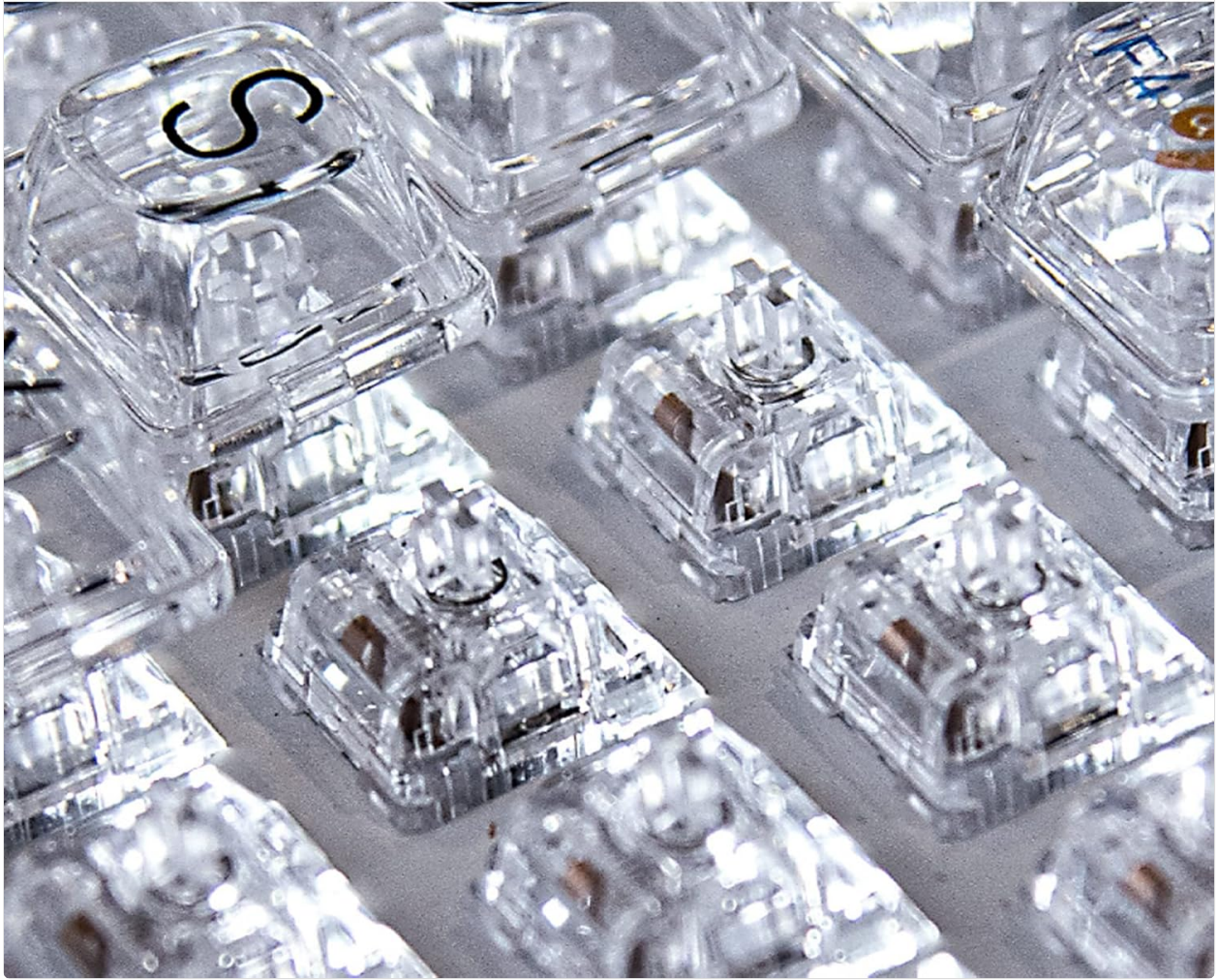
Figure 2.2: Detailed view of the pre-lubed Kailh BOX Jellyfish Switches, designed for smooth and quiet operation.