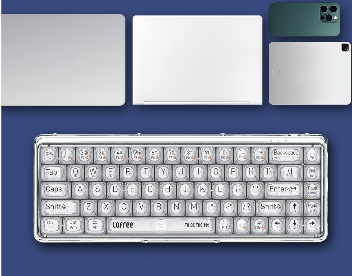
Figure 2.4: The LOFREE 1% keyboard demonstrating its compatibility with various devices, including laptops, tablets, and smartphones.

Your browser does not support the video tag.