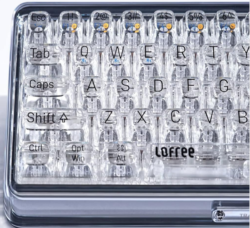
Figure 2.1: Close-up view of the transparent keycaps and switches, demonstrating the keyboard's unique see-through design.