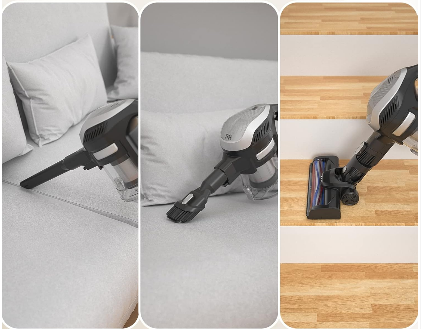
Image: Three panels illustrating the vacuum's versatility: cleaning a sofa with the handheld unit, using the 2-in-1 brush on upholstery, and cleaning stairs with the handheld unit and floor brush.