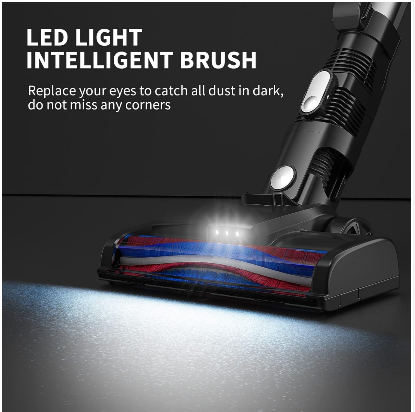
Image: Close-up of the motorized floor brush head, highlighting the integrated LED lights that illuminate the cleaning path, helping to spot dust in dark areas.

Replace your eyes to catch all dust in dark, do not miss any corners