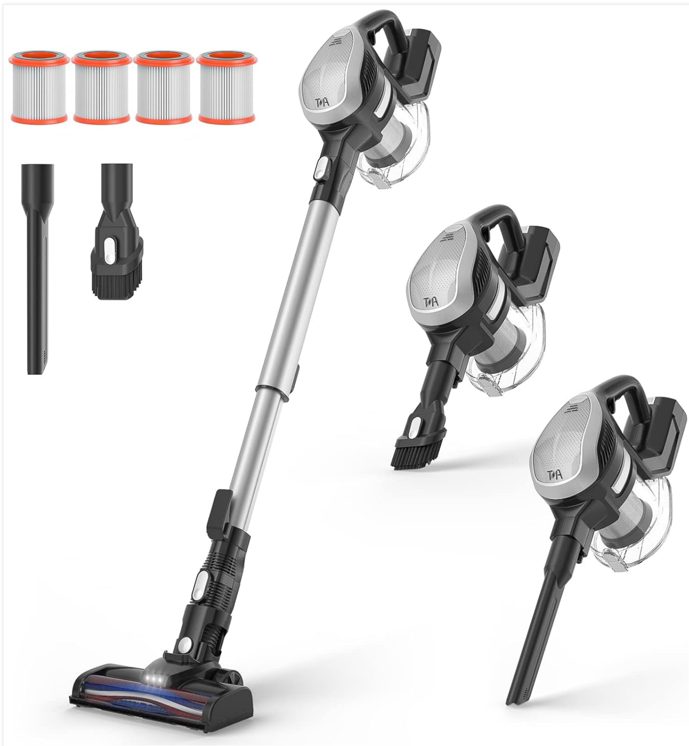
Image: The TMA Cordless Vacuum Cleaner shown with its main components including the main unit, extension wand, floor brush, and various attachments like the crevice tool and 2-in-1 brush, along with spare filters.