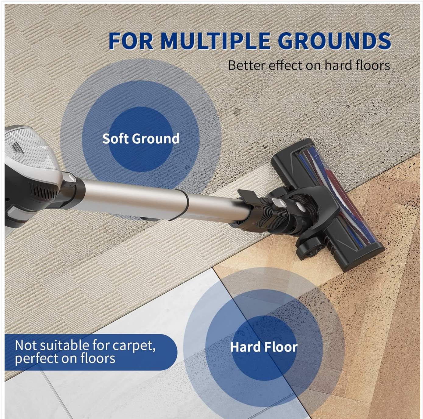
Image: Depiction of the vacuum cleaning different floor types, indicating better effect on hard floors and noting it is not suitable for all carpets but perfect for hard floors.