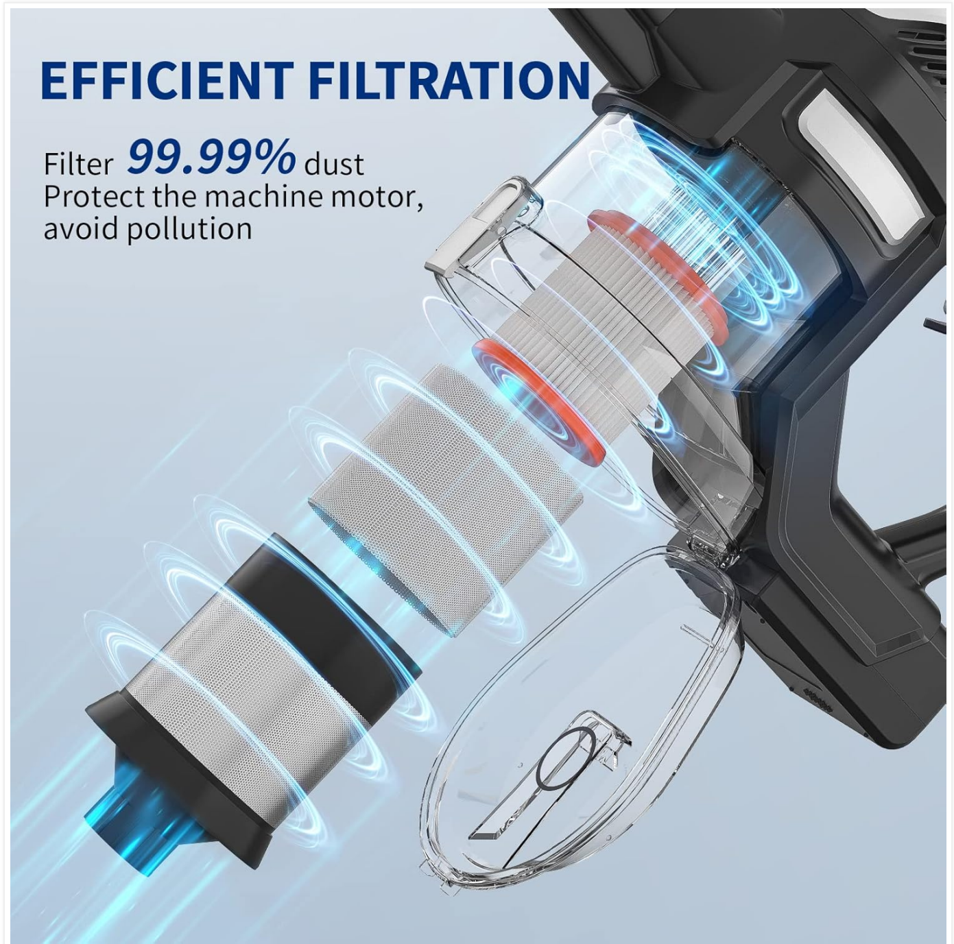
Image: Diagram illustrating the multi-stage filtration system, showing how air passes through different filter layers to capture 99.99% of dust and protect the motor.