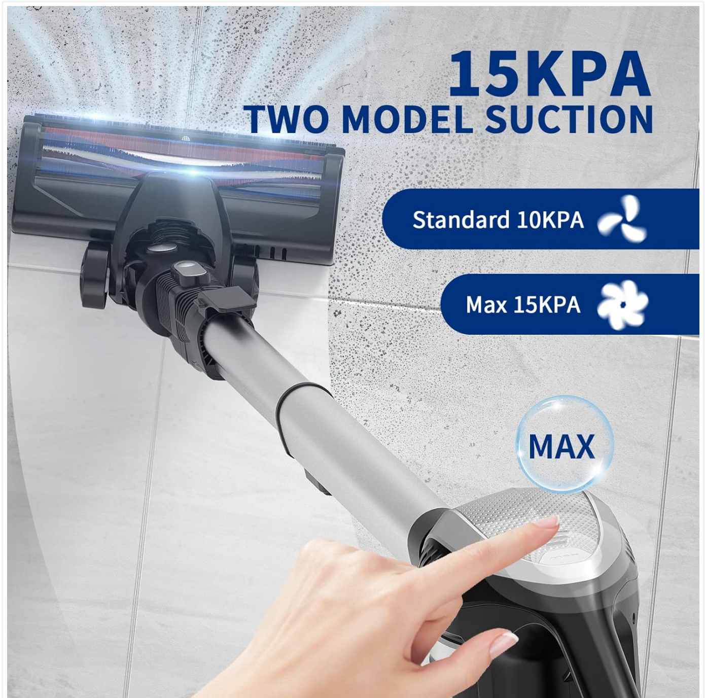
Image: Visual representation of the two suction modes: Standard (10KPA) and Max (15KPA), with a hand pressing the "MAX" button on the vacuum's main unit.