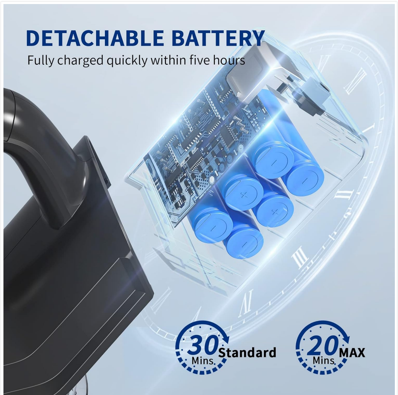
Image: Diagram showing the internal structure of the detachable battery pack and indicating charging time of approximately five hours for a full charge. It also shows approximate run times of 30 minutes in standard mode and 20 minutes in MAX mode.