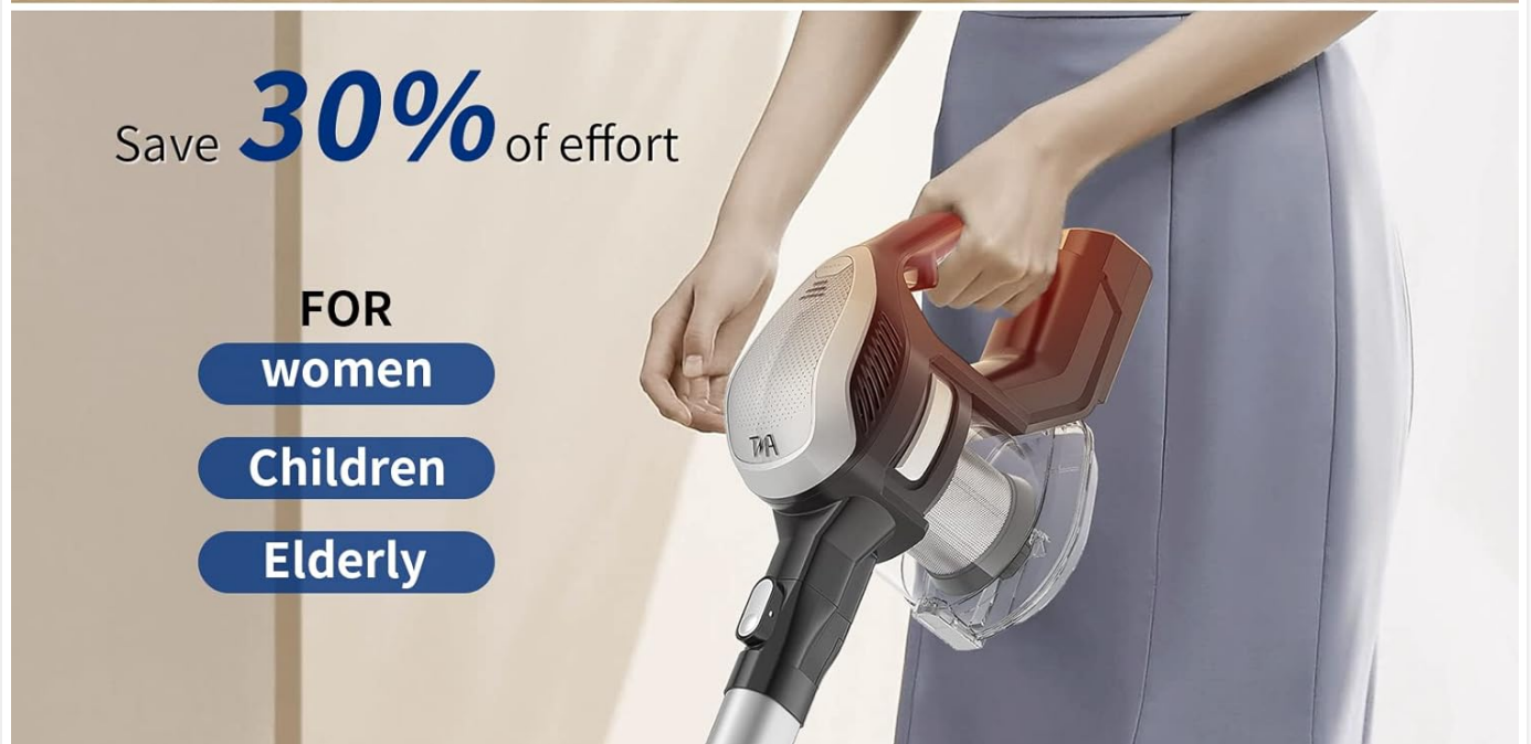
Image: A person using the stick vacuum to clean a floor, demonstrating its ease of use and lightweight nature, stating it saves 30% effort for women, children, and the elderly.