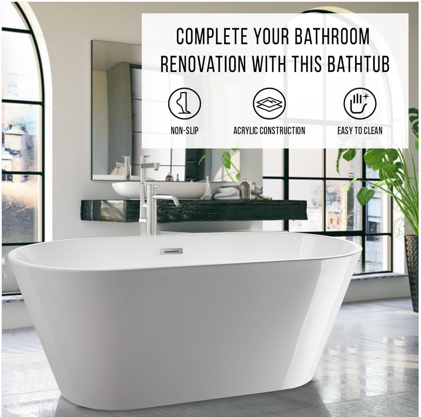
Image: The bathtub as a centerpiece in a modern bathroom, highlighting its practical features.