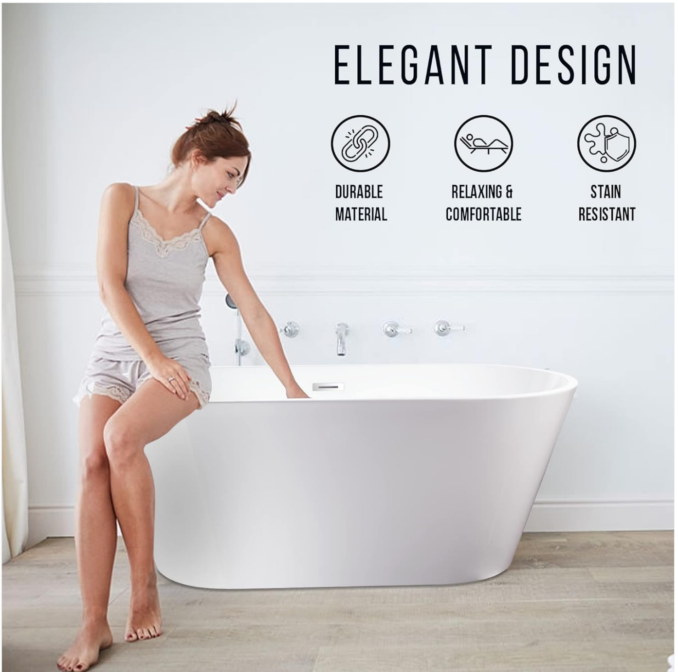
Image: The Vanity Art freestanding bathtub, showcasing its elegant design and key features.