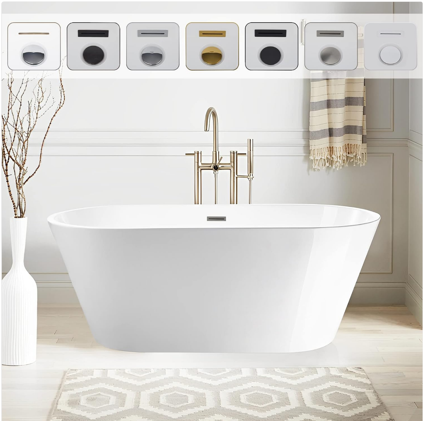
Image: The Vanity Art 59-inch freestanding bathtub in a modern bathroom setting, showcasing its sleek design.