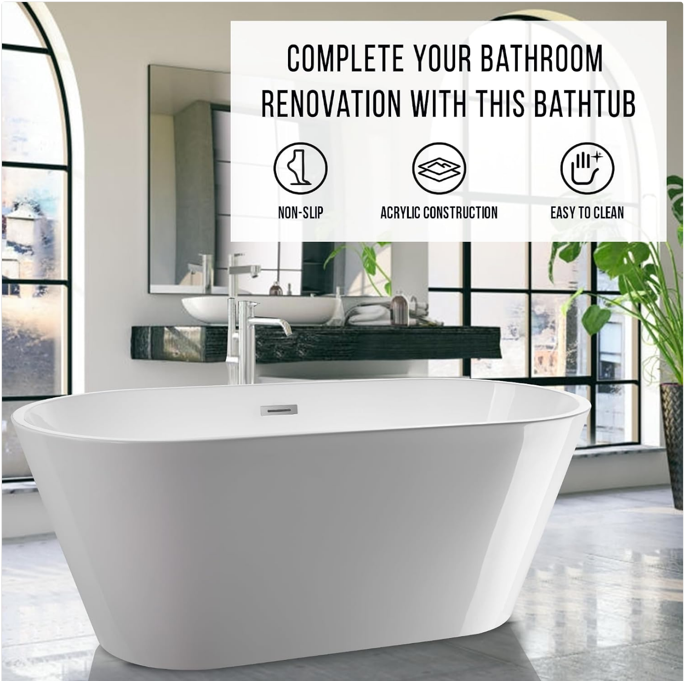
Image: Features of the bathtub including non-slip surface, acrylic construction, and ease of cleaning, set against a modern bathroom backdrop.