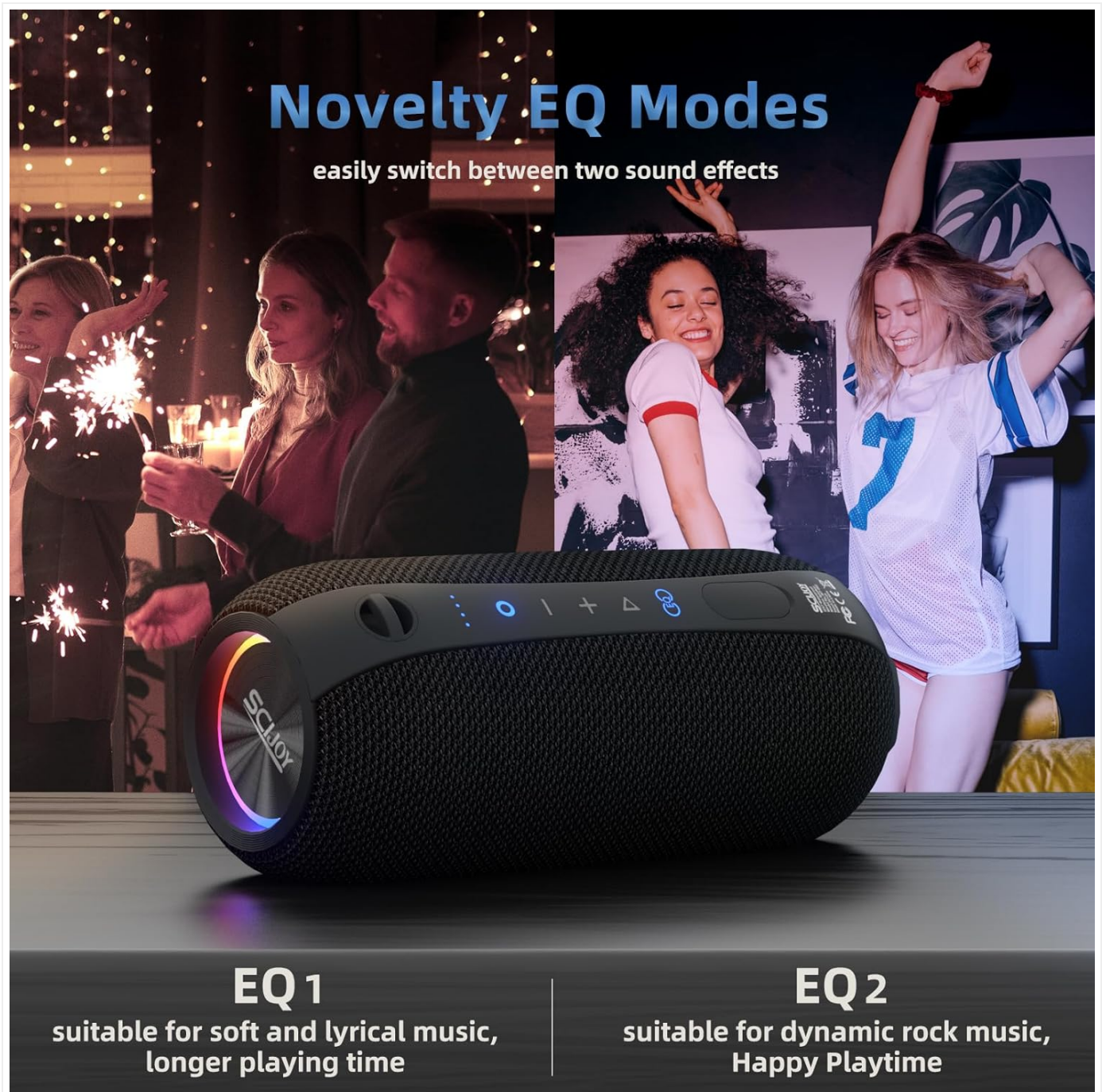
Image: A depiction of the two EQ modes available on the SCIJOY Bluetooth Speaker, illustrating EQ1 for soft and lyrical music and EQ2 for dynamic rock music with enhanced bass.