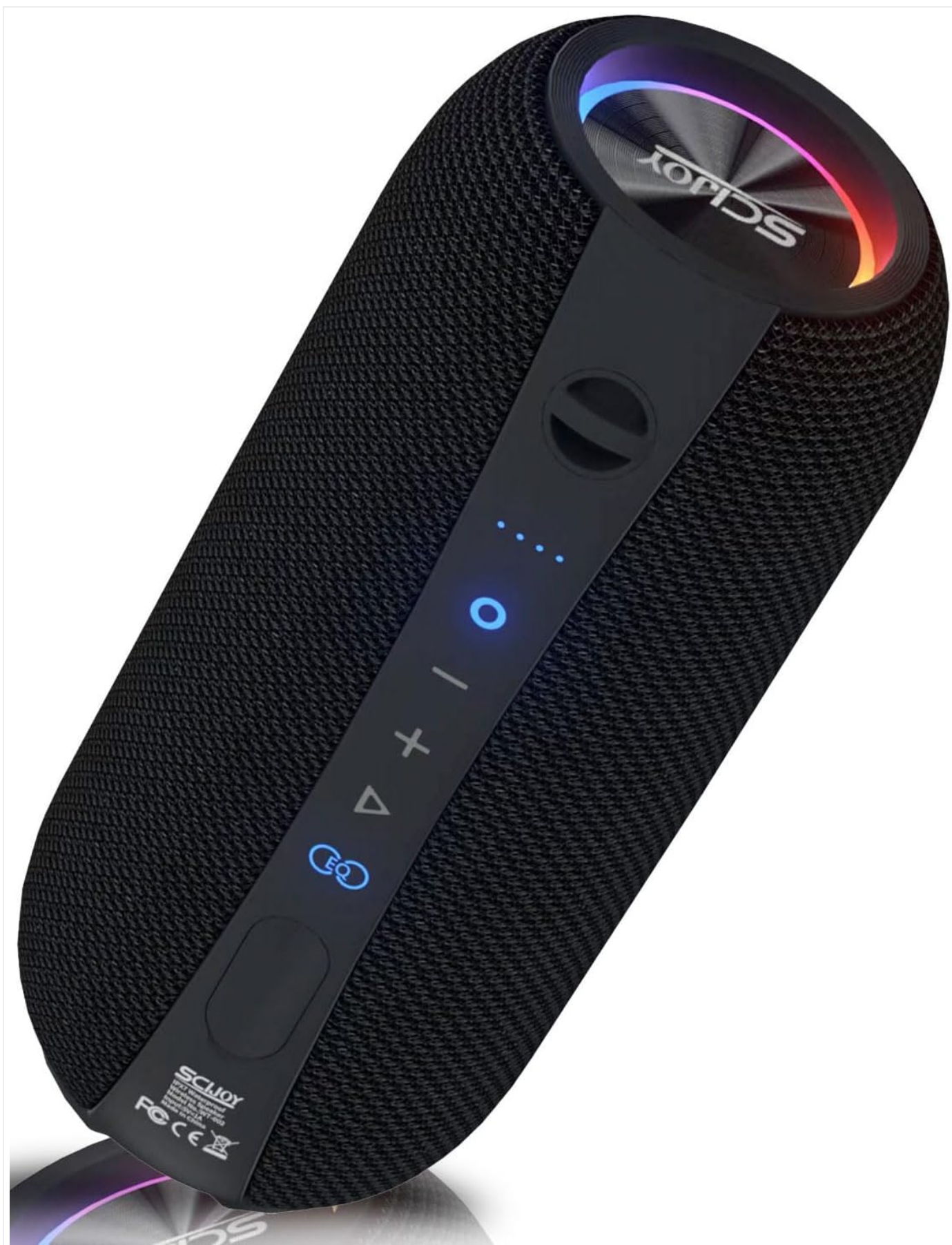
Image: The SCIJOY Bluetooth Speaker SCIJOY-002, showcasing its sleek black design and integrated RGB lighting.