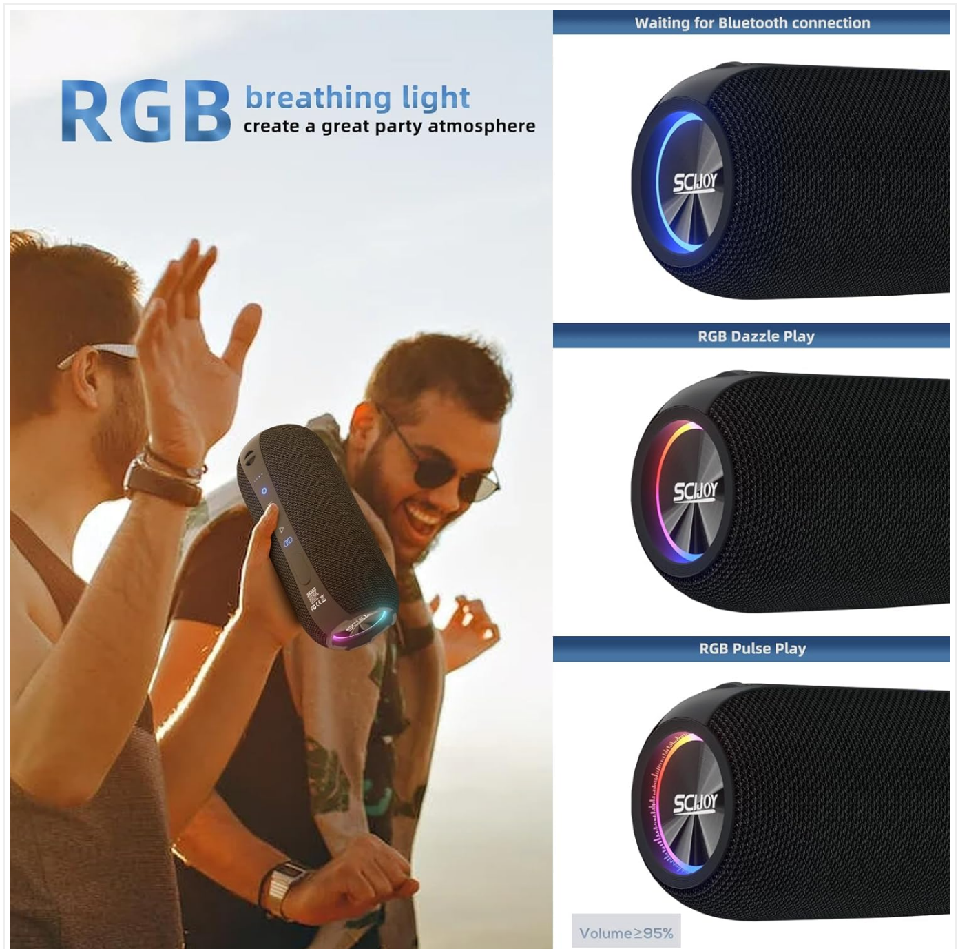
Image: The SCIIJOY Bluetooth Speaker displaying its RGB breathing light feature, creating a vibrant atmosphere. Examples of different light patterns are shown.