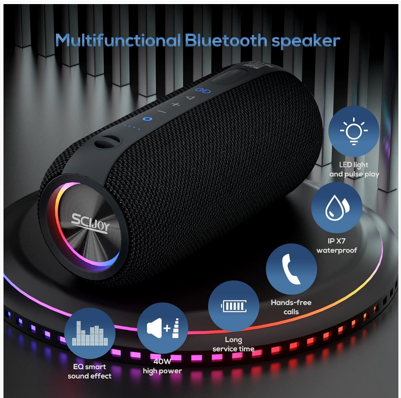
Image: An overview of the SCIJOY Bluetooth Speaker highlighting its multifunctional features including LED light, IPX7 waterproof rating, hands-free calls, EQ smart sound effect, 40W high power, and long service time.