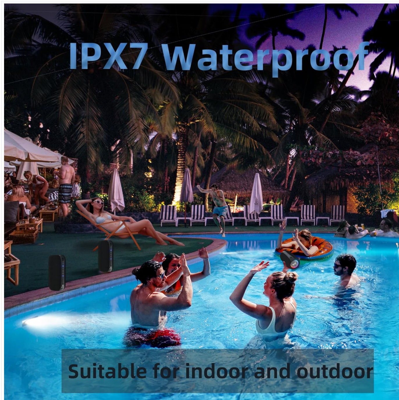
Image: The SCIIJOY Bluetooth Speaker submerged in water, demonstrating its IPX7 waterproof capability, suitable for use near pools or in wet environments.