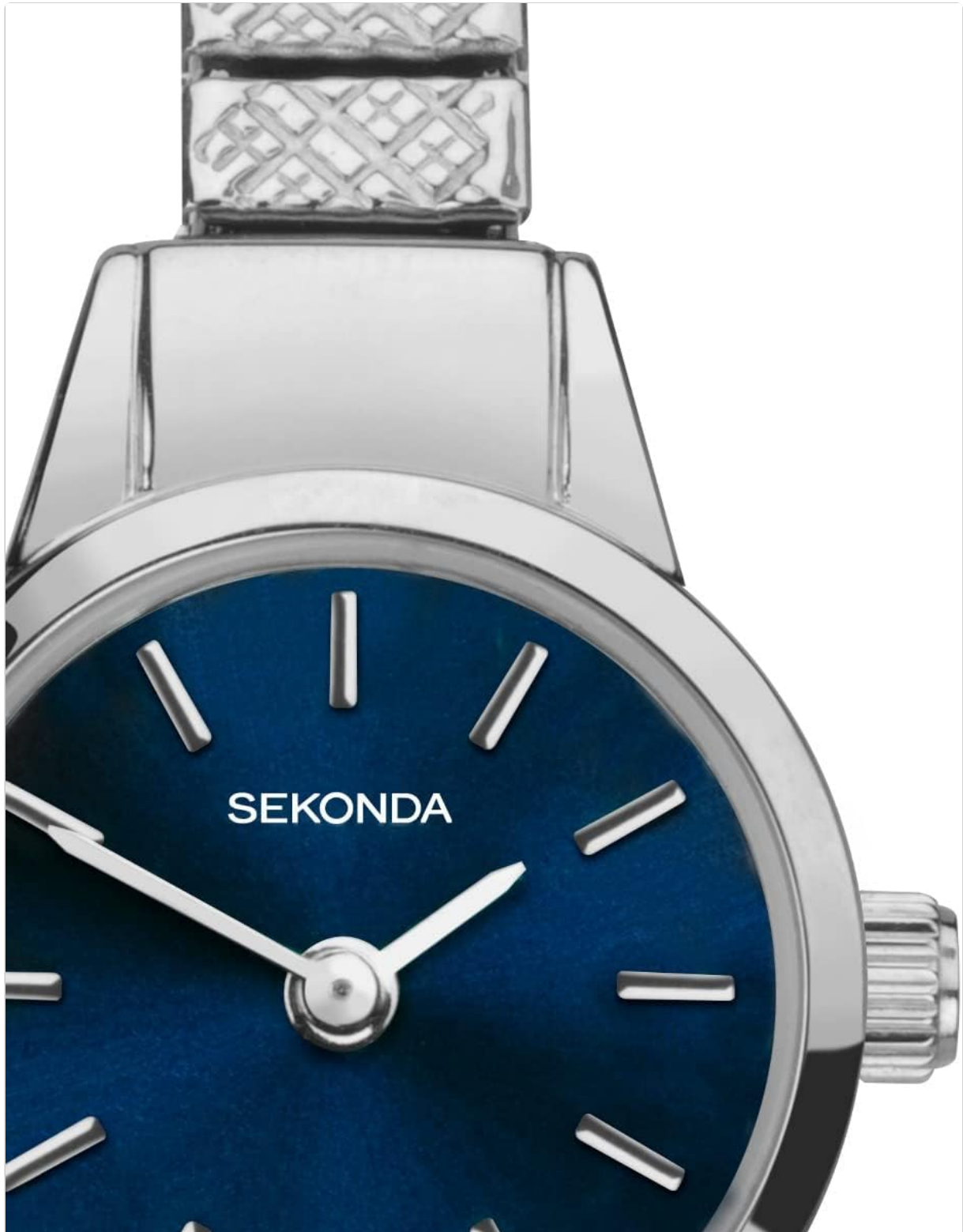
Figure 4: Close-up view of the watch dial, showing the hour, minute, and second hands against the blue background with

The watch displays time using three hands: the shorter hand indicates the hour, the longer hand indicates the minute, and the thin sweeping hand indicates the seconds. The blue dial features clear silver markers for easy readability.