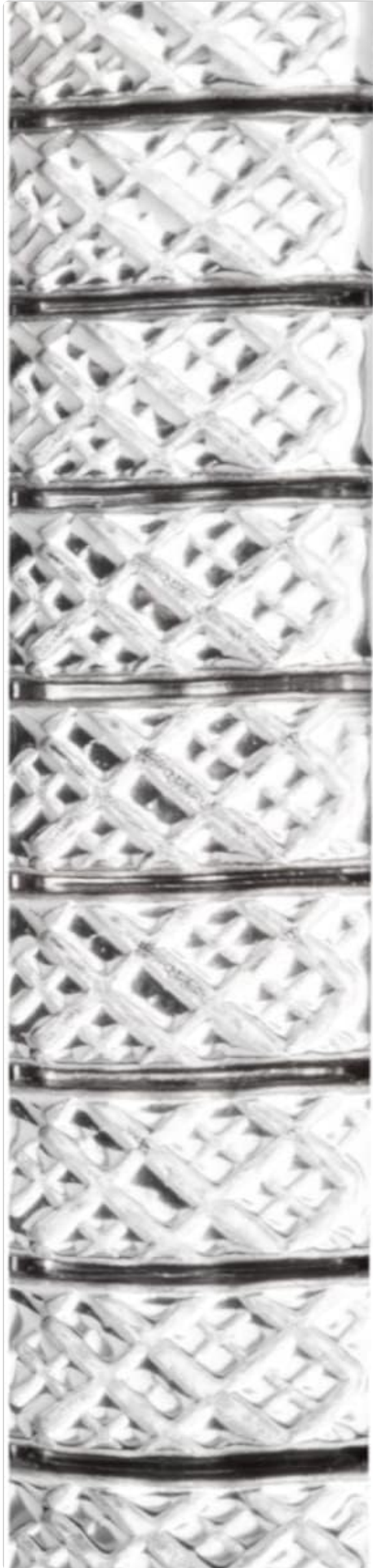
Figure 3: Detail of the expandable silver-tone bracelet. This design allows for easy donning and removal without manual clasp adjustments.