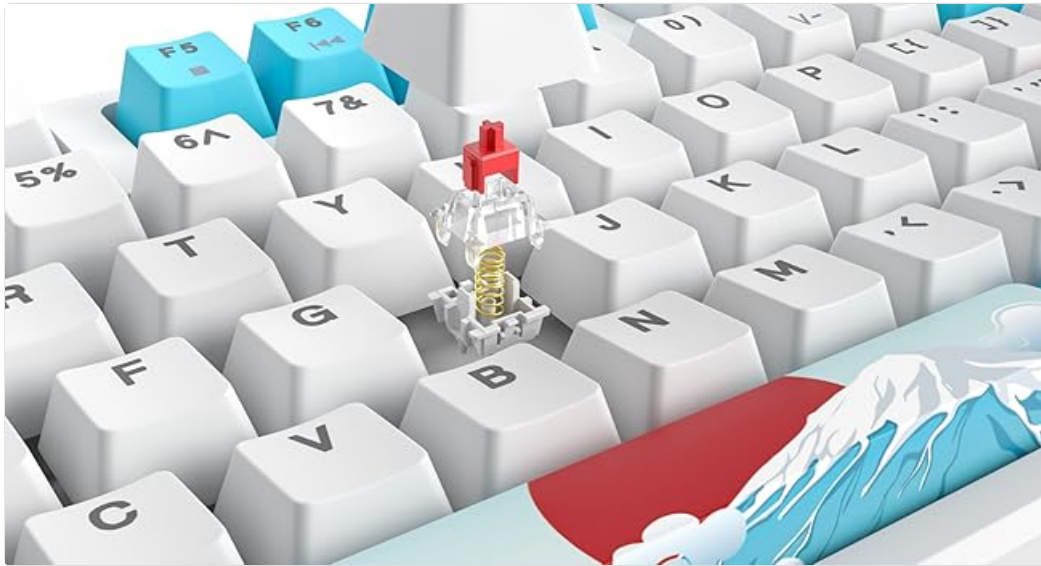
Image: Close-up view of the keyboard's mechanical Red Switches, highlighting their linear design.