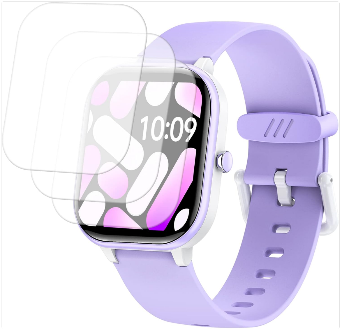
Image: HENGTO Smartwatch Screen Protector applied to a purple smartwatch, showcasing its transparent design.