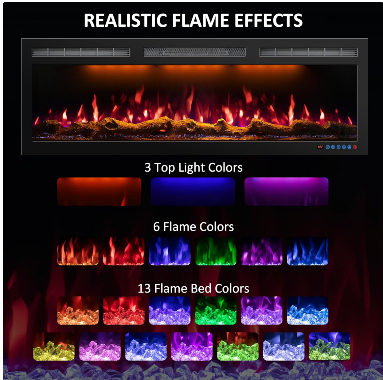
Image 3.1: Visual representation of the various customizable flame, flame bed, and top light color options.