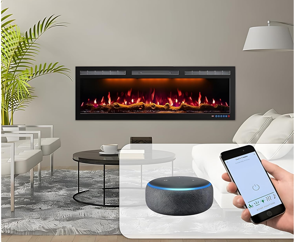
Image 5.2: The electric fireplace being controlled wirelessly via a smartphone application and Amazon Alexa.