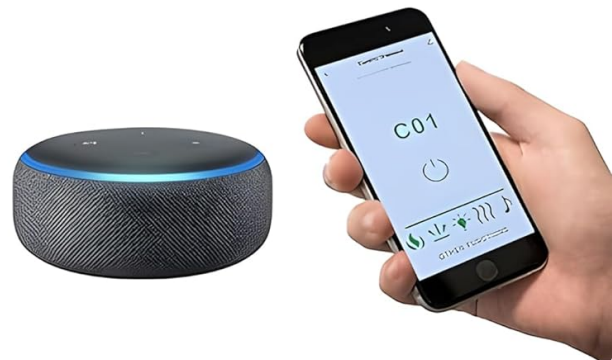
Image 1.1: The Mystflame 88 Inch Electric Fireplace, showcasing its sleek design, remote control, and compatibility with smart home devices like Amazon Alexa.