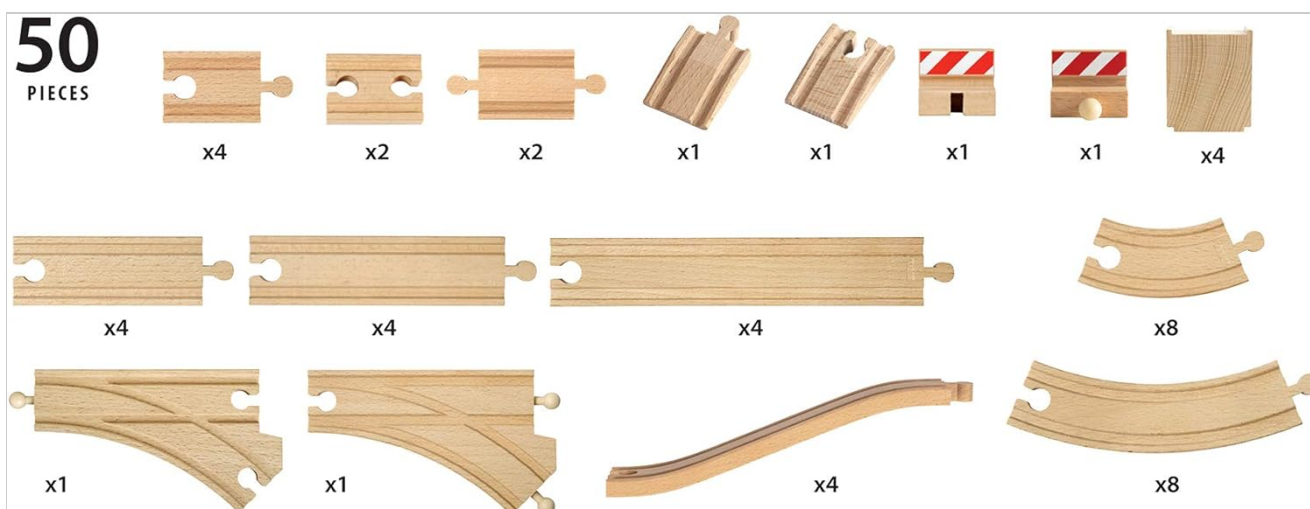
Image: Individual components of the BRIO 50-Piece Track Pack. This image details each type of track piece and accessory included in the 50-Piece Special Track Pack, along with their respective quantities.