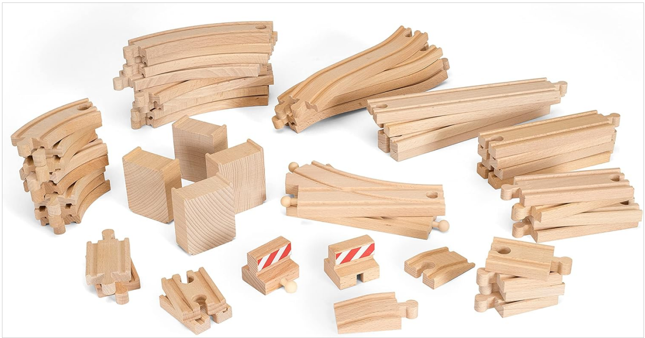
Image: BRIO 50-Piece Track Pack components laid out. This image shows all the track pieces and accessories from the 50-Piece Special Track Pack spread out, demonstrating the variety available for track building.