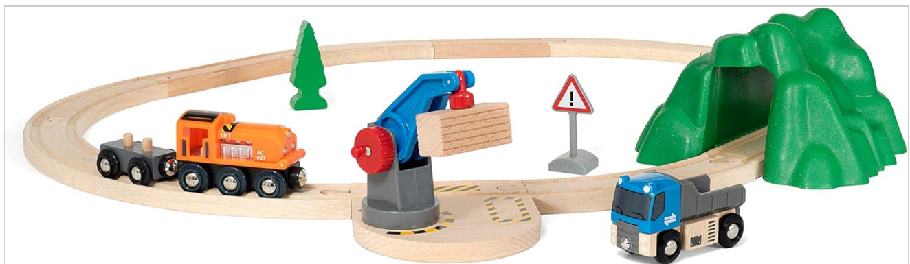
Image: BRIO Starter Lift&Load Set assembled. This image displays the Starter Lift&Load Set fully assembled with the train, crane, truck, and track forming a complete layout.