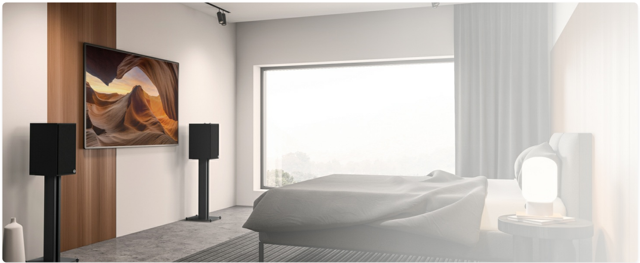
Image: Klipsch The Sevens speakers in a living room setup, demonstrating typical placement next to a television.

Optimal speaker placement is crucial for sound quality. Position the speakers equidistant from your primary listening position. The Klipsch The Sevens are designed for versatile placement, including on stands, shelves, or a media console. Ensure adequate space around the speakers for proper ventilation and cable management.