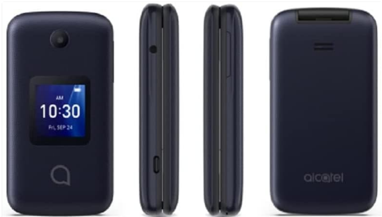
Image: Multiple views of the Alcatel Go Flip 4 4056W, illustrating the phone's form factor and potential SIM tray location.