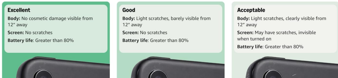
Image: Explanation of Amazon Renewed product conditions (Excellent, Good, Acceptable) regarding cosmetic damage, screen, and battery life.

Example body scratches and dents – not actual products