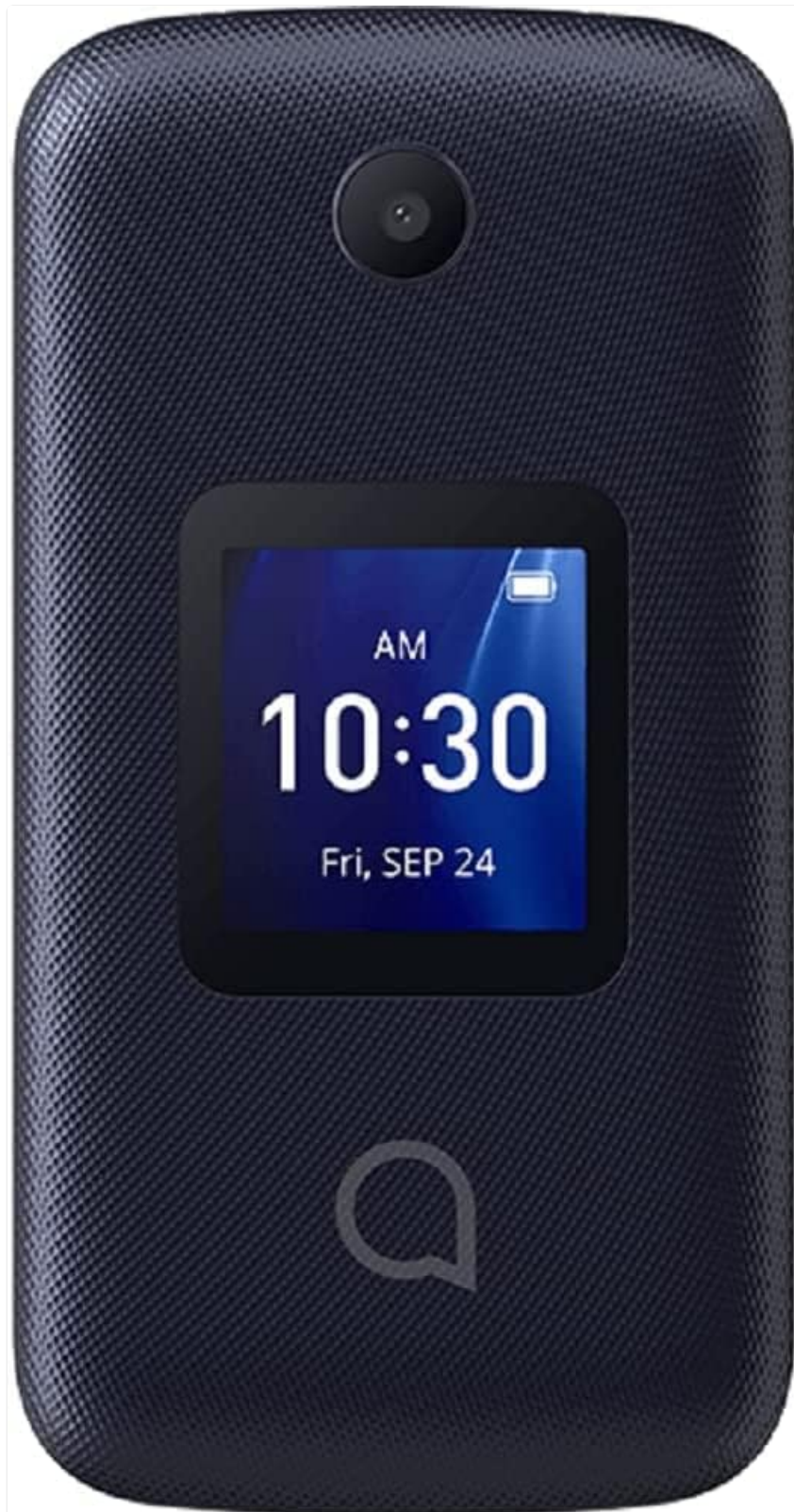
Image: The Alcatel Go Flip 4 4056W in a closed position, displaying the external screen with time and date.