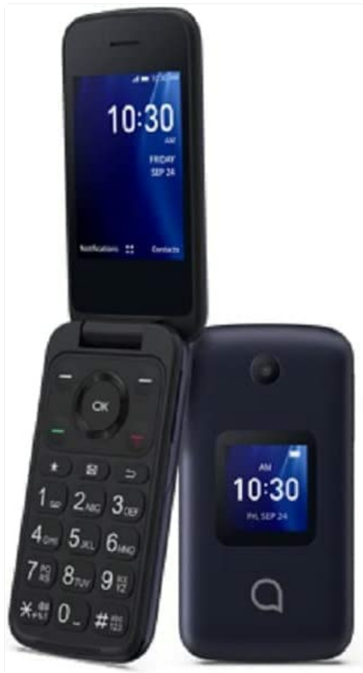
Image: The Alcatel Go Flip 4 4056W in an open position, displaying the internal screen and the physical keypad.