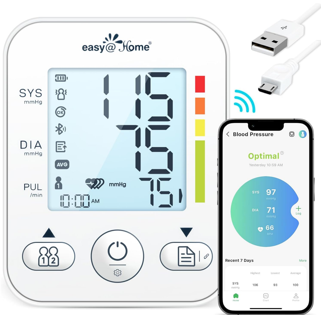
Image 1.1: Easy@Home EBP08B Blood Pressure Monitor and accessories.