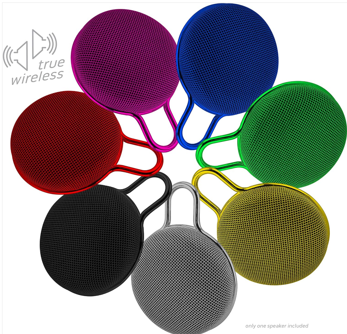
Figure 5.4: Illustration of True Wireless Stereo (TWS) capability. This image displays several speakers of different colors, emphasizing the "True Wireless" feature which allows two speakers to connect for enhanced audio.

The COOLBUDS CSPTW310 supports True Wireless Stereo (TWS) functionality, allowing you to pair two CSPTW310 speakers together for a stereo sound experience.