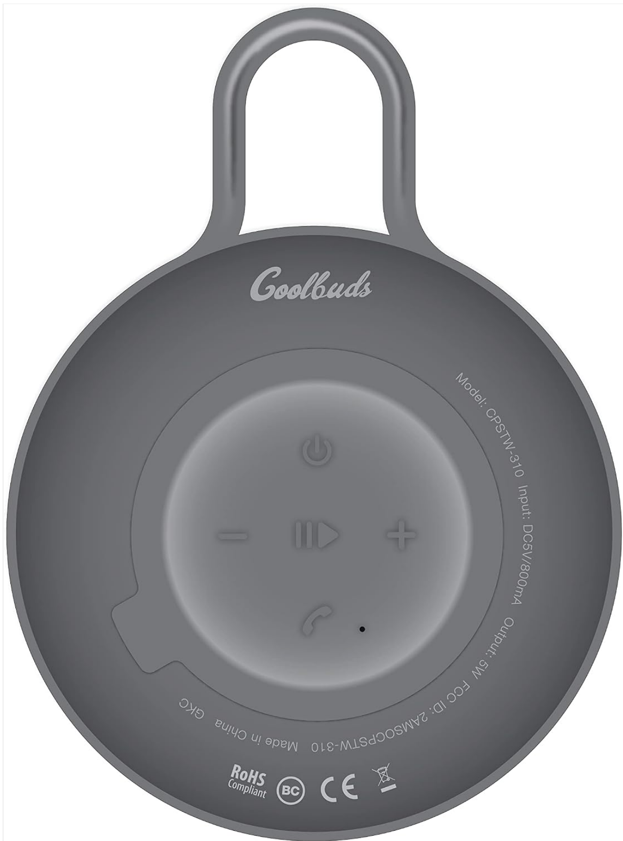
Figure 4.2: Rear view of the speaker, displaying the rubberized control panel. Visible elements include the power button, play/pause button, volume controls, call answer/hang-up button, and the integrated microphone. Regulatory information is also printed on the back.