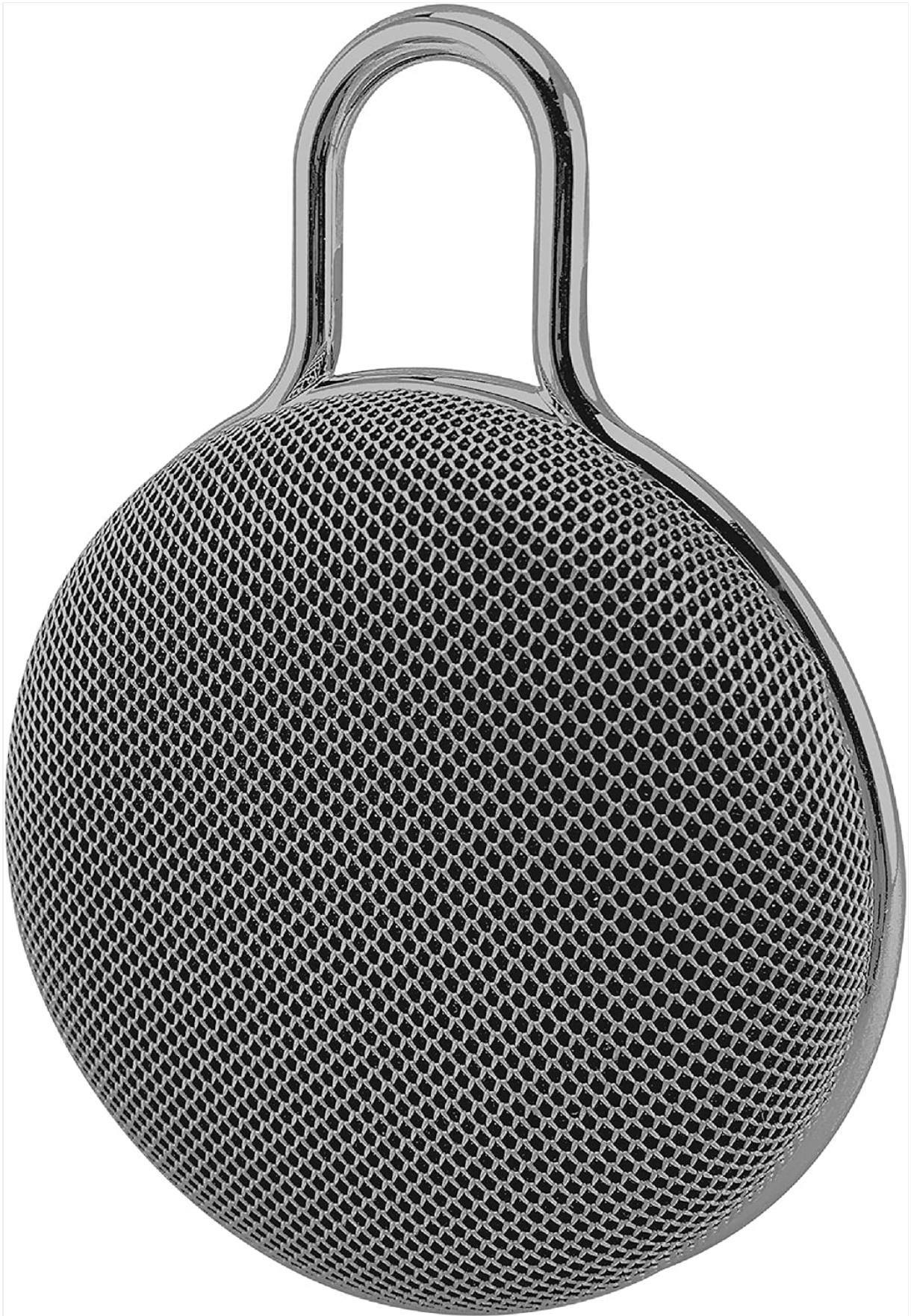
Figure 4.1: Front view of the COOLBUDS CSPTW310 Mini Bluetooth Speaker. This image shows the circular speaker with its mesh grille and the attached metal carabiner, highlighting its compact and portable design.