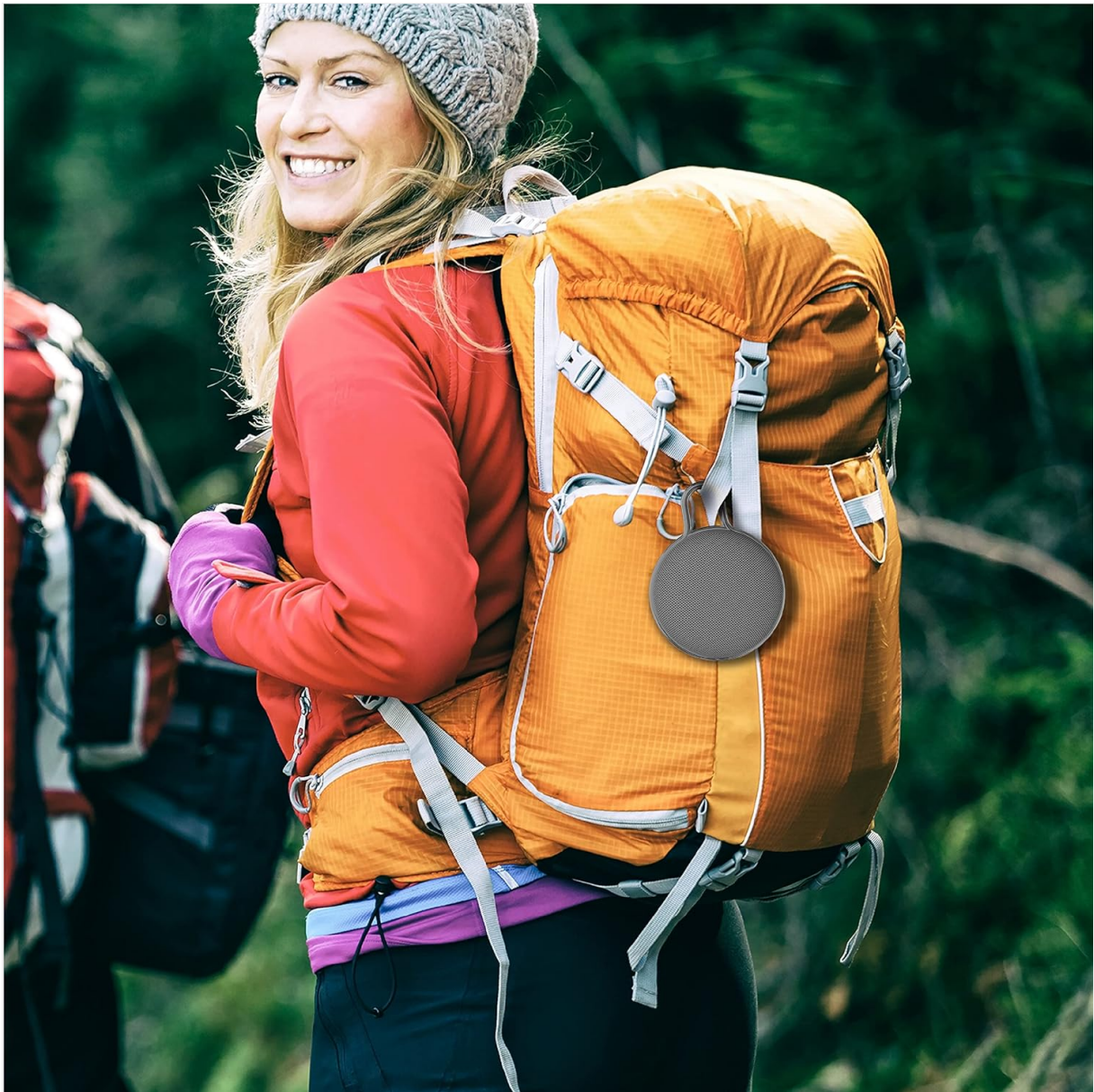
Figure 6.2: Speaker attached to a backpack. This image demonstrates the portability and convenience of the built-in carabiner, allowing users to easily attach the speaker to bags or other gear for outdoor activities.