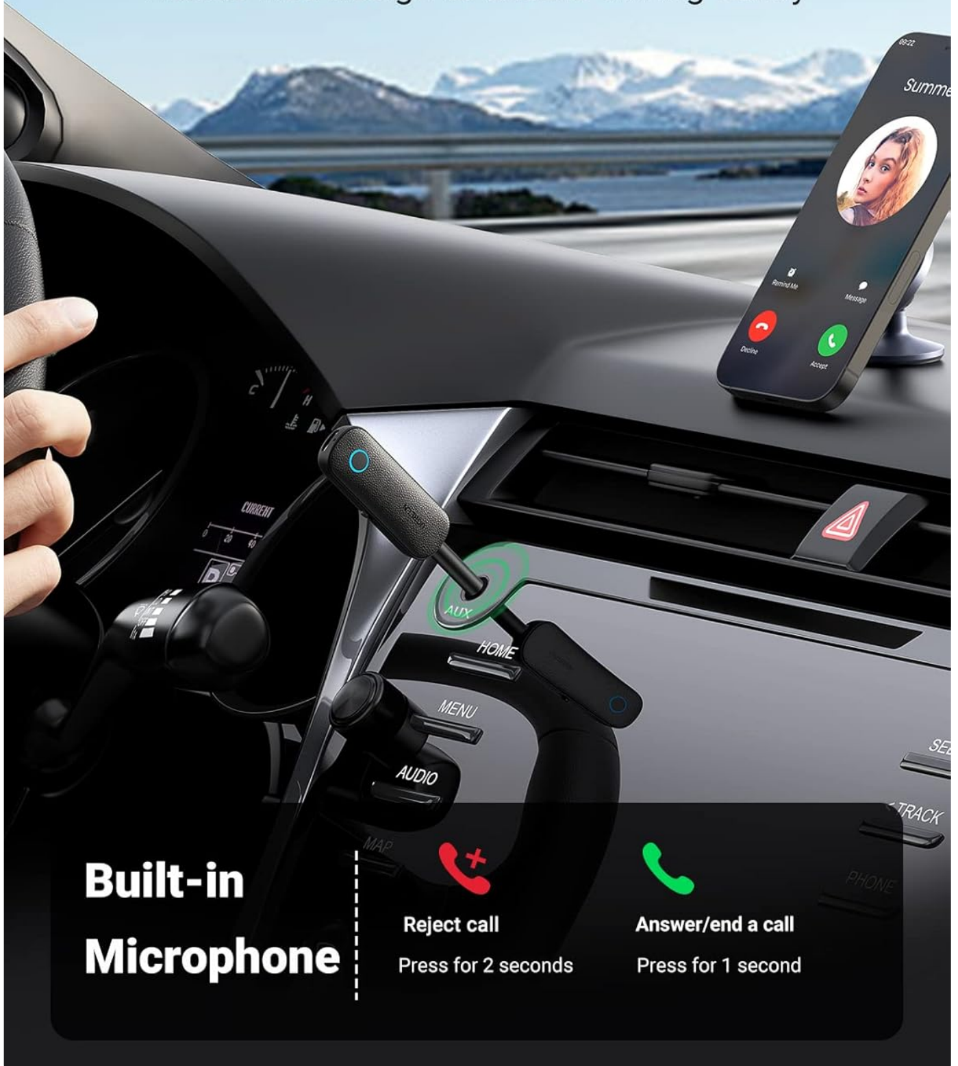
Image 1.2: UGREEN Bluetooth 5.3 Car Adapter. This adapter is designed for in-car use, featuring a built-in microphone for hands-free calling.

Hands-free design to ensure driving safely