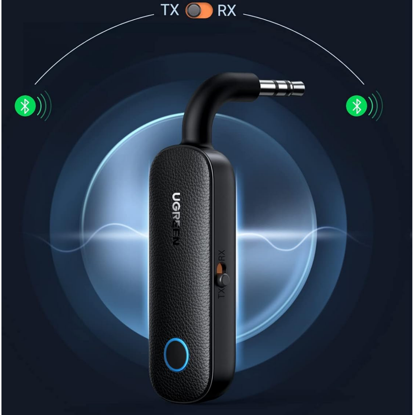
Image 3.1: Toggle the switch to select TX (Transmitter) or RX (Receiver) mode.

Toggle the button to choose TX or RX Mode