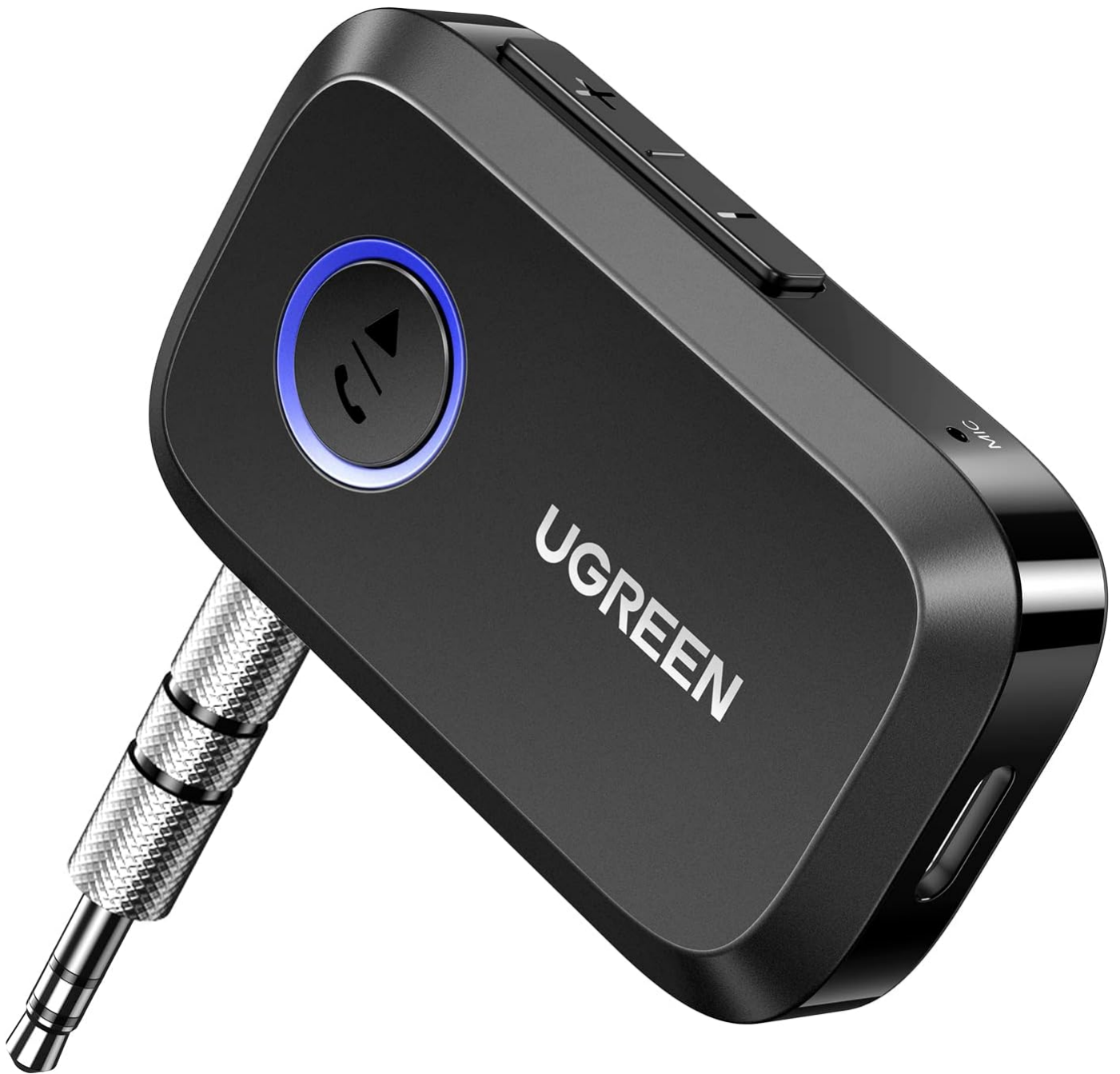
Image 1.1: UGREEN Bluetooth 5.0 Transmitter and Receiver (TX/RX) adapter. This compact device features a 3.5mm audio jack and control buttons.