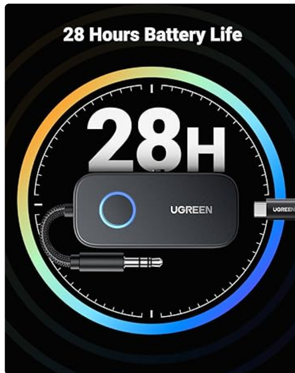
Image 3.2: The 2-in-1 adapter can be used to connect Bluetooth headphones to in-flight entertainment systems.