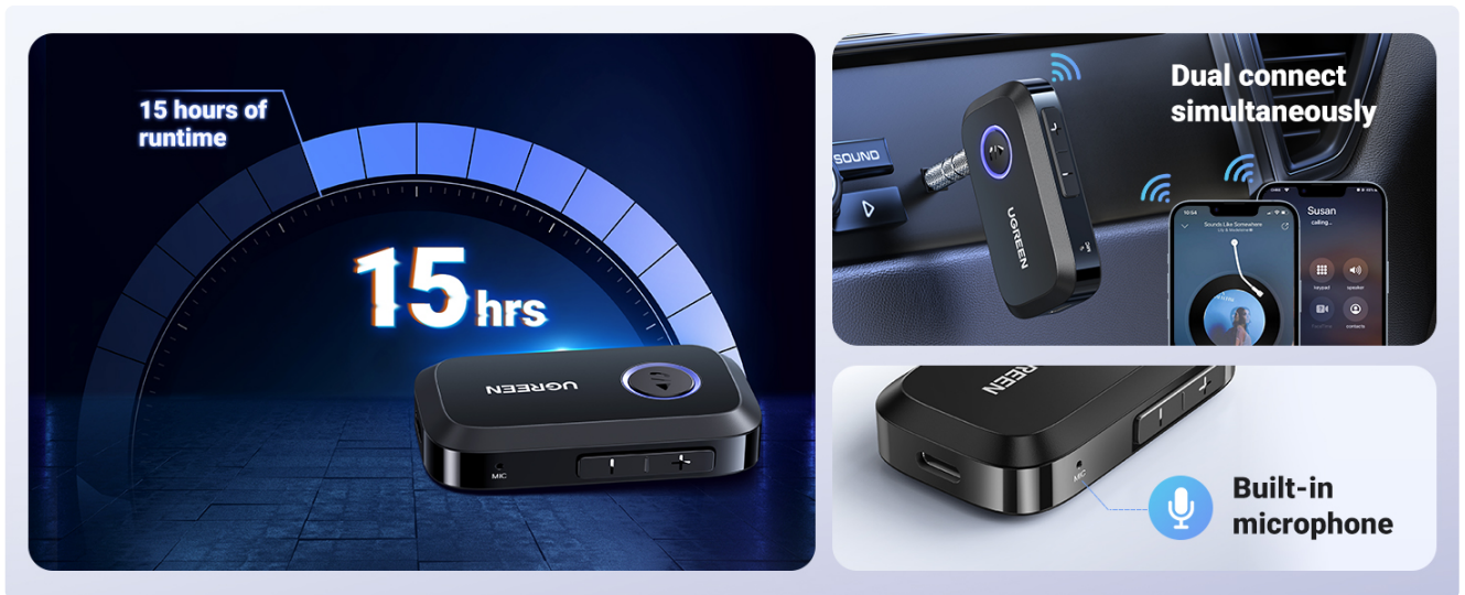
Image 3.3: Visual guide for pairing the UGREEN Bluetooth Car Adapter with a smartphone.