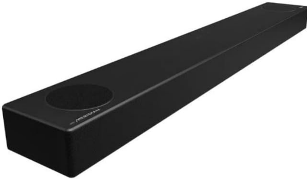
Image: LG SPM7A Sound Bar and Wireless Subwoofer components.