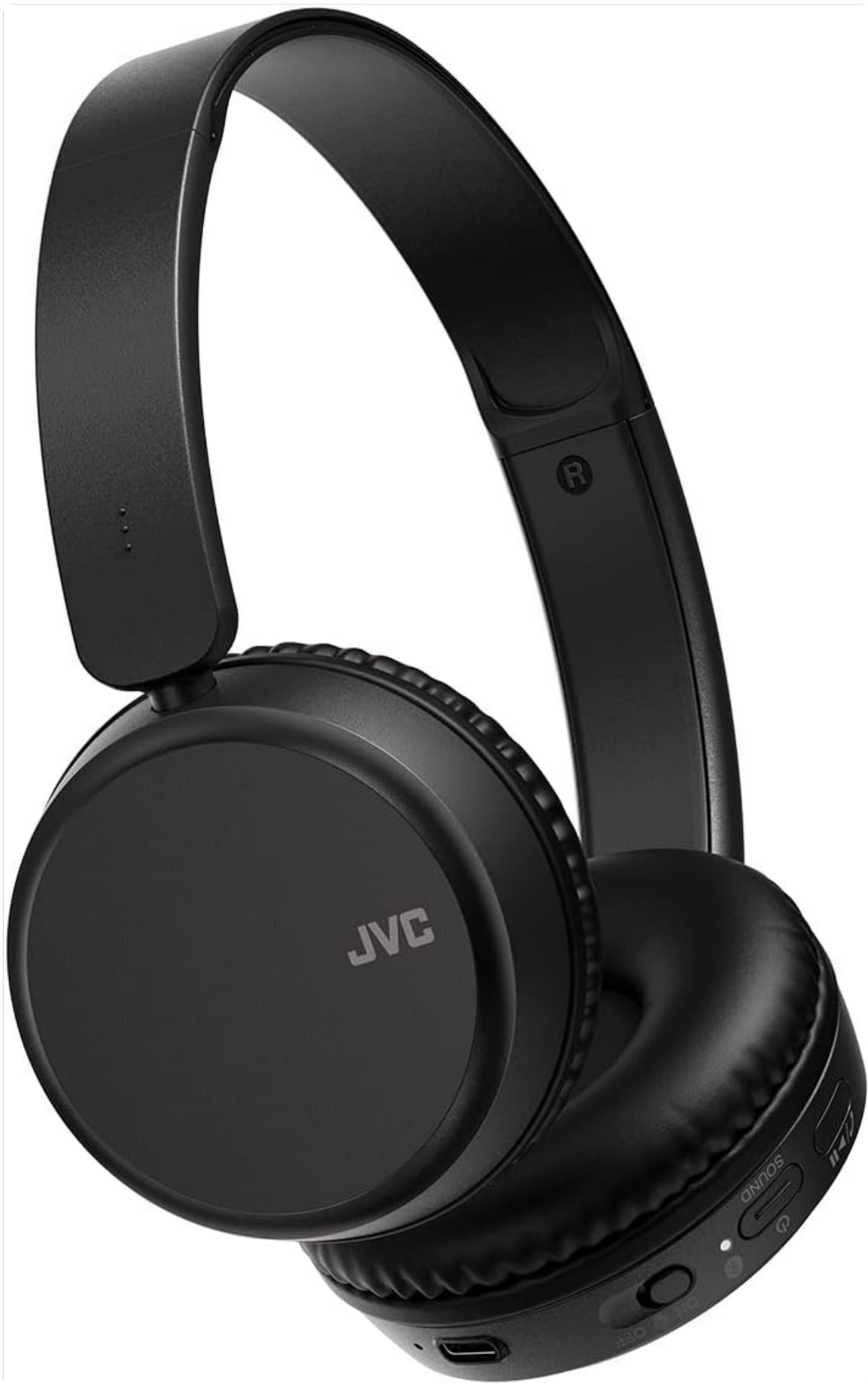
Image: Overview of the JVC Deep Bass Wireless Headphones, highlighting their sleek black design.