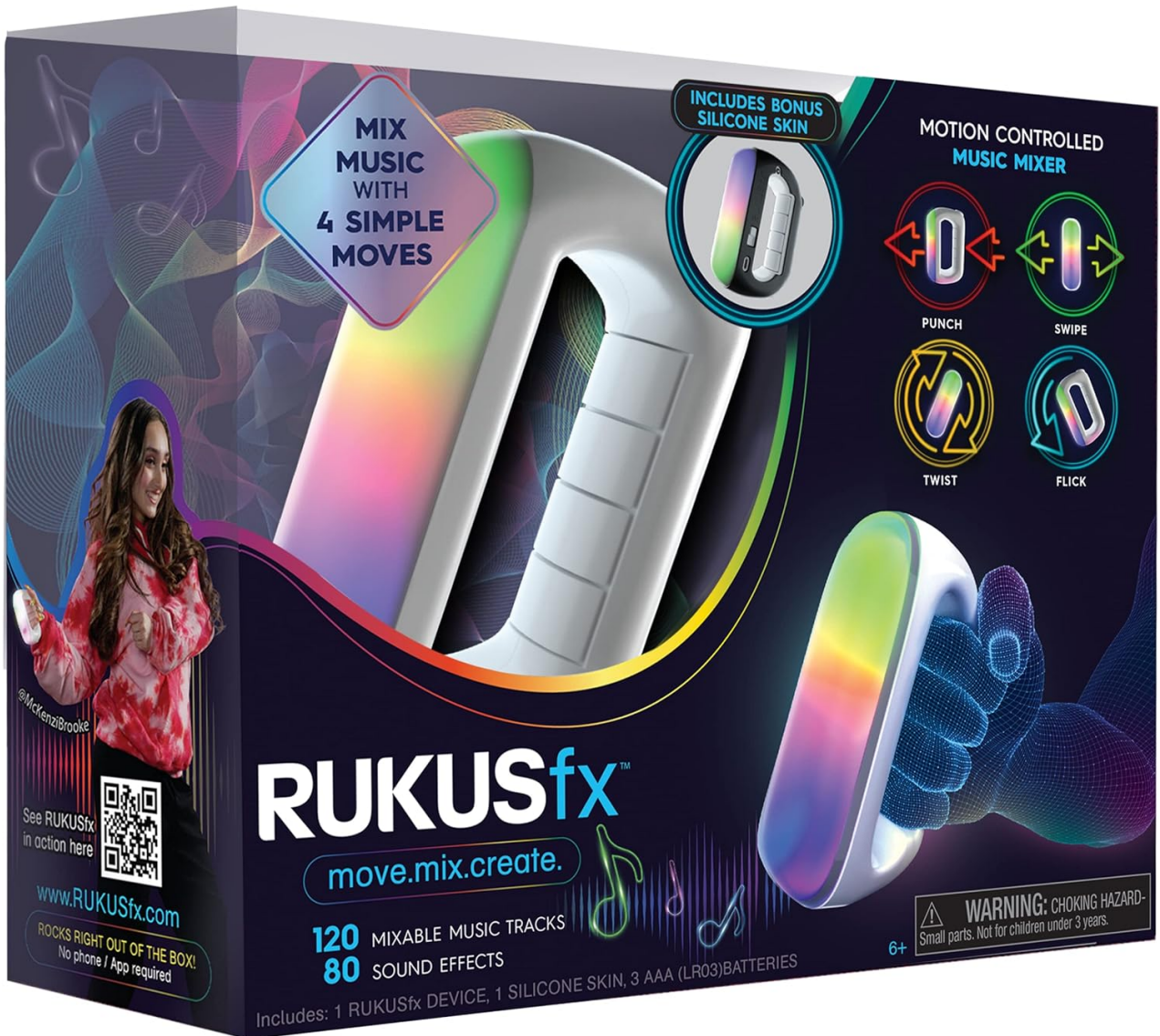
Image: The RUKUSfx device and its packaging, highlighting included items.