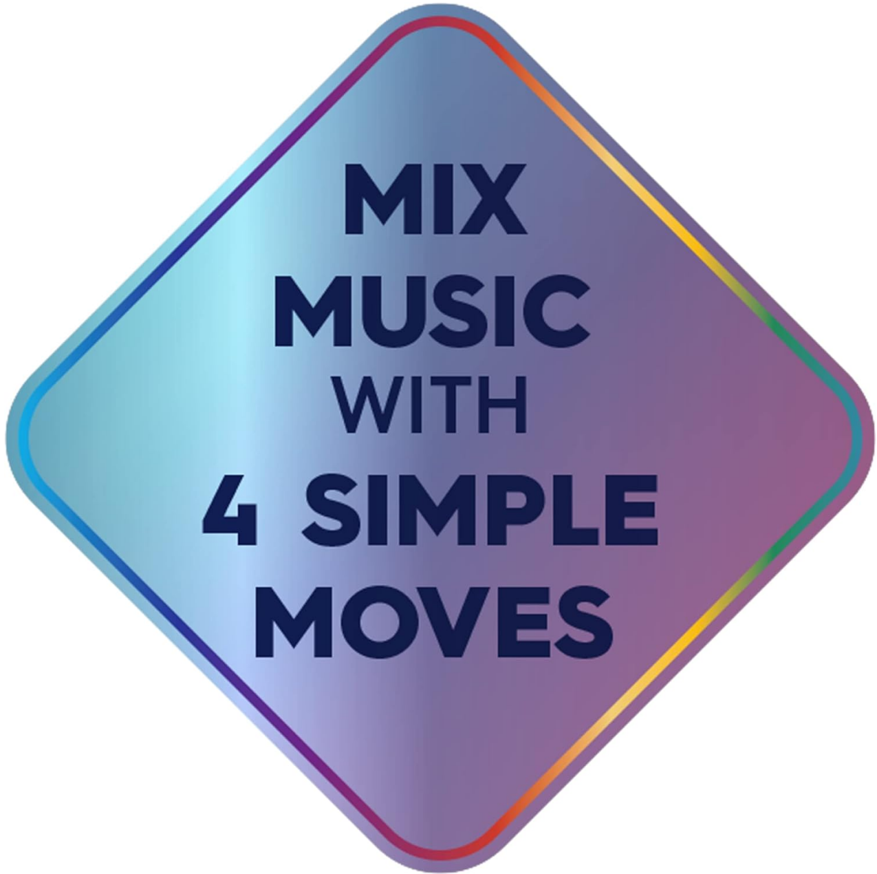
Image: Visual representation of the four motion controls: Punch, Swipe, Twist, and Flick.