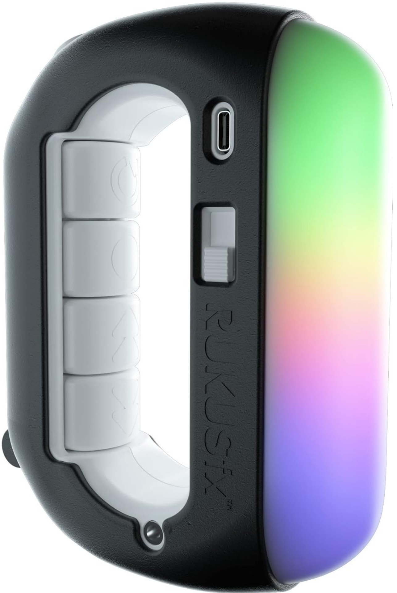
Image: Side view of the RUKUSfx device, highlighting the USB-C port for connectivity.