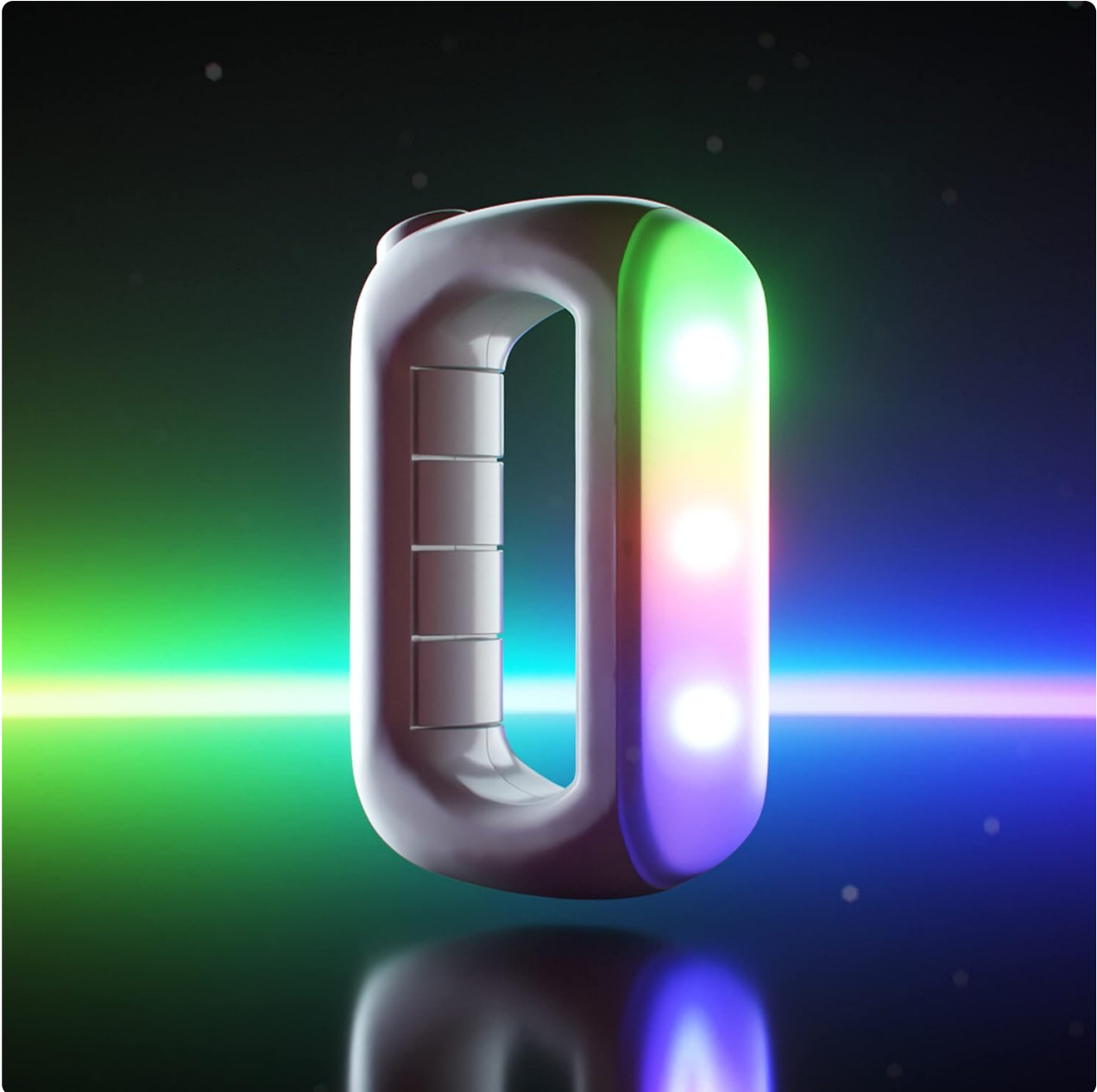
Image: The RUKUSfx device showcasing its vibrant LED light display.

The RUKUSfx features a built-in LED display that pulses and changes colors in sync with your movements and the music, providing a dynamic visual experience.