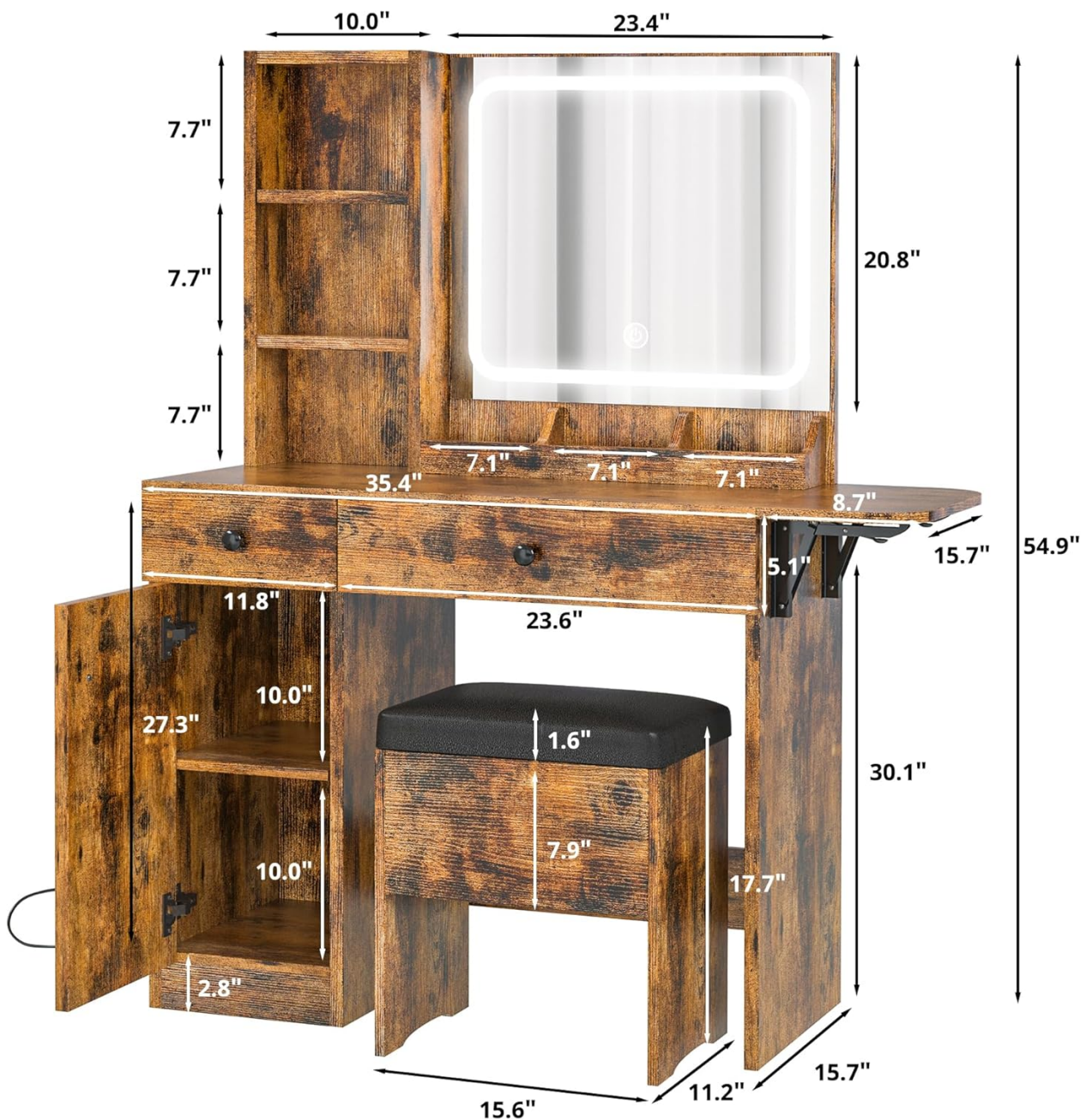
Figure 2: Detailed dimensions of the vanity desk and stool.