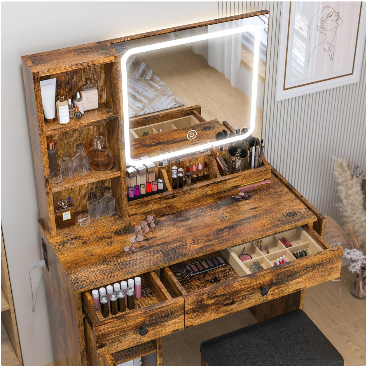
Figure 5: Drawers providing ample space for makeup and accessories.