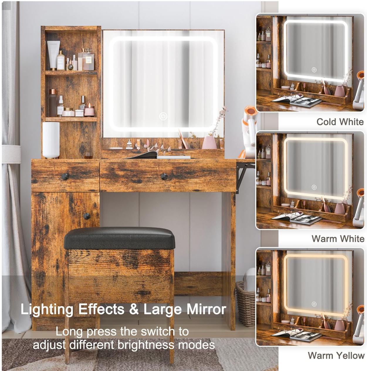
Figure 3: LED mirror lighting effects and touch control.