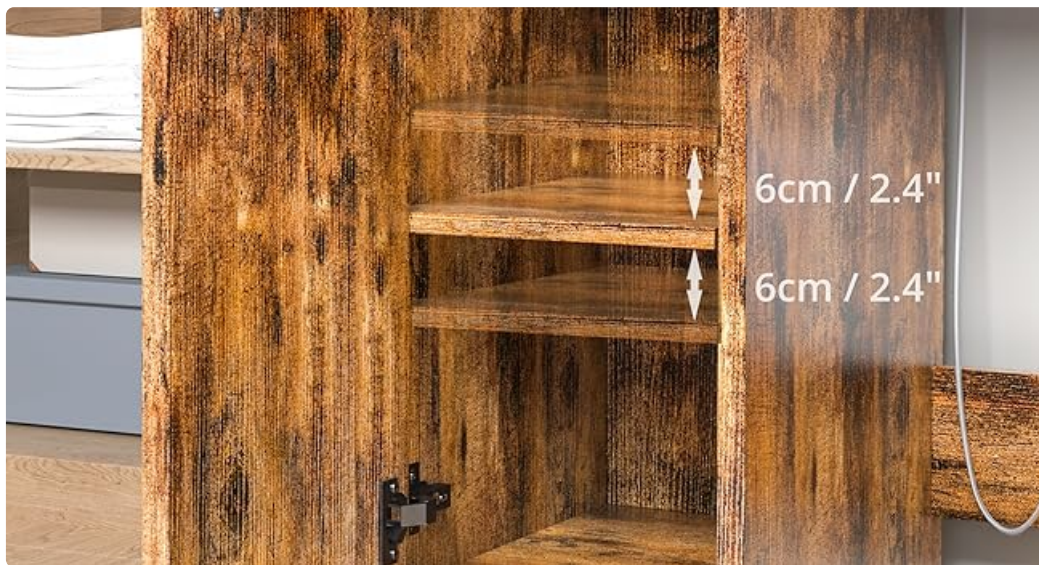
Figure 6: Side cabinet with adjustable shelving for various product heights.