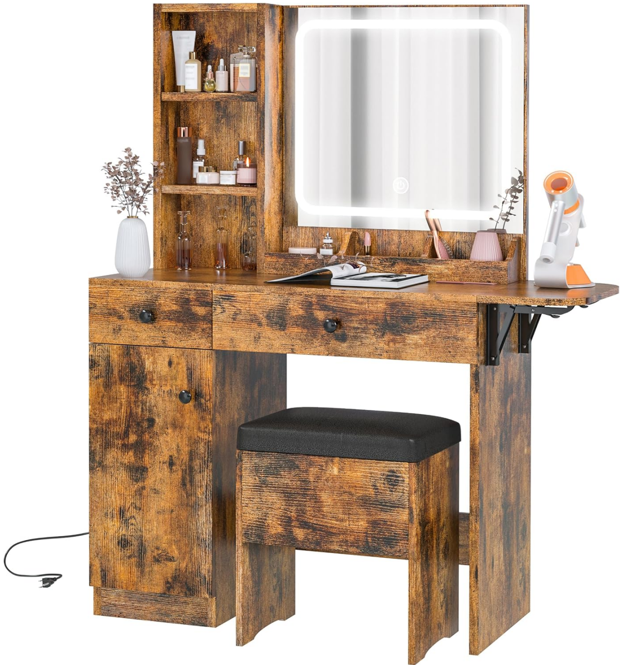
Figure 1: Fully assembled IRONCK Vanity Desk.