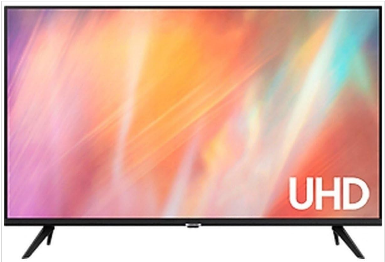
Figure 1: Front view of the Samsung UE55AU7022K 4K UHD Smart TV, showcasing its flat screen and slim design.

Your TV can be placed on a stand or mounted on a wall. For wall mounting, ensure you use a VESA-compliant mount (400 x 400 mm) and follow the mount manufacturer's instructions carefully.