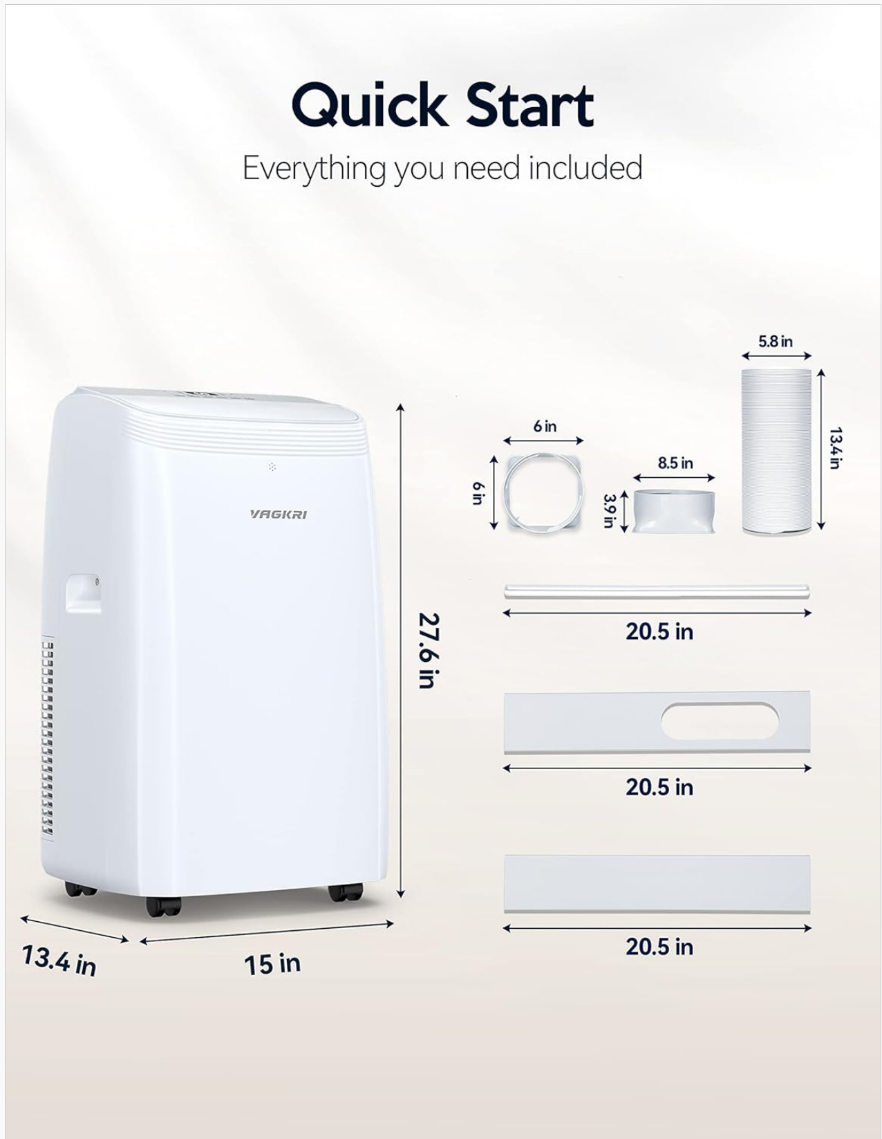
Image: Quick Start guide with all included components and dimensions.