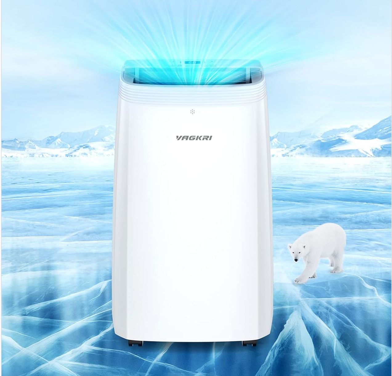
Image: Flexible airflow control with multiple fan speeds and wind modes.