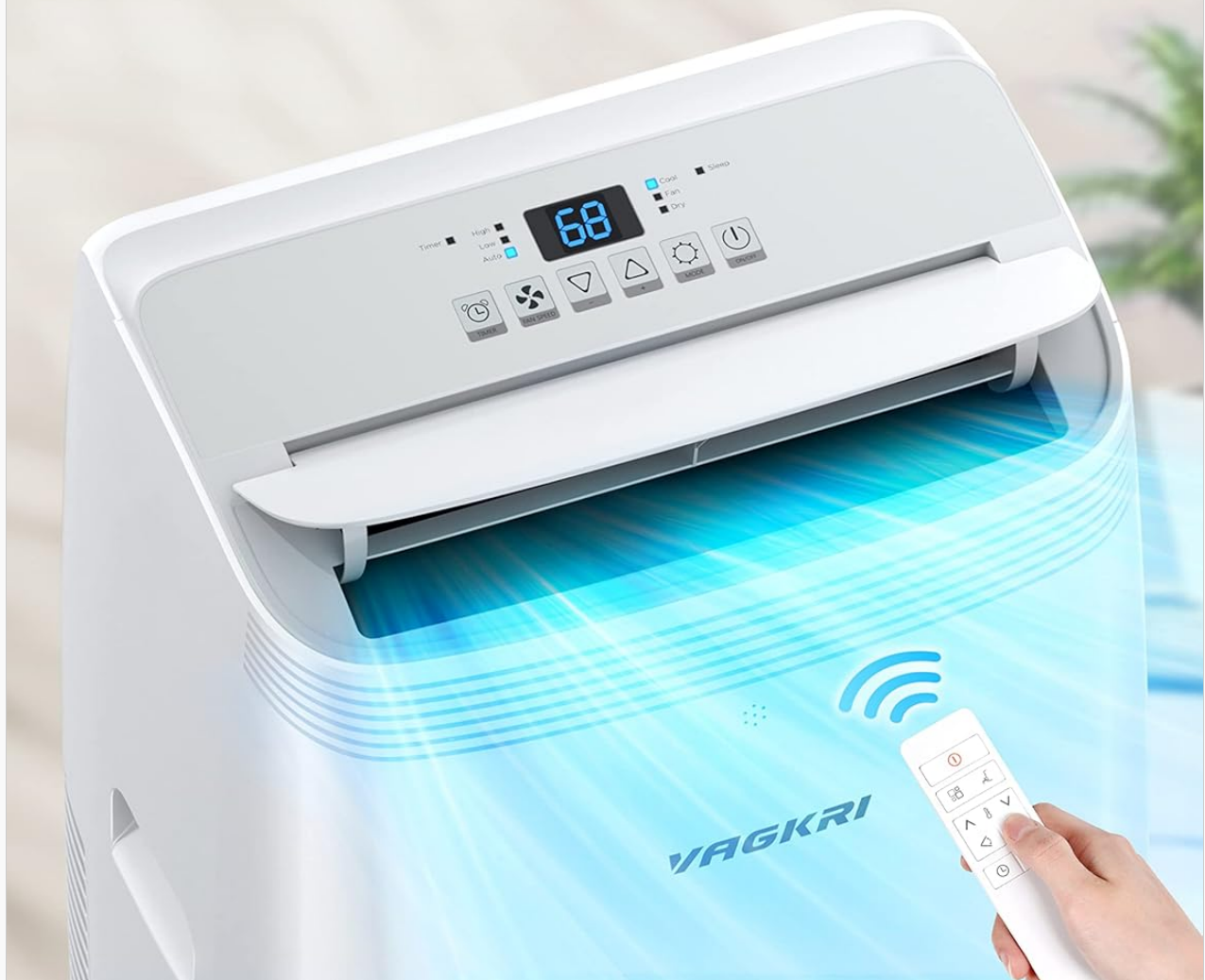
Image: LED panel and full-function remote control for convenient operation.