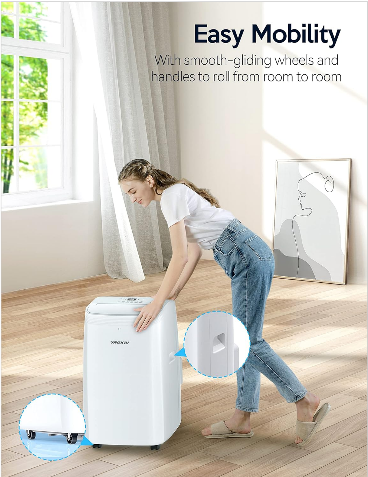
Image: Easy mobility with smooth-gliding wheels and handles.

With smooth-gliding wheels and handles to roll from room to room