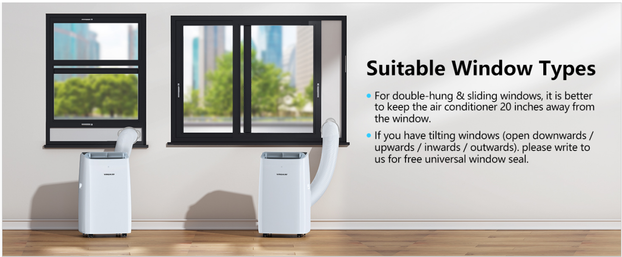
Image: Examples of suitable window types for installation.