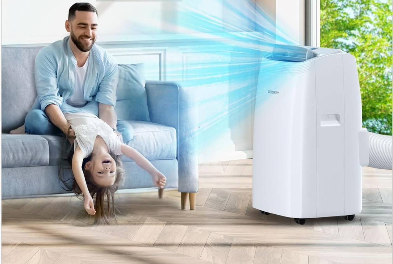
Image: Powerful cooling efficiency for spaces up to 450 sq.ft.