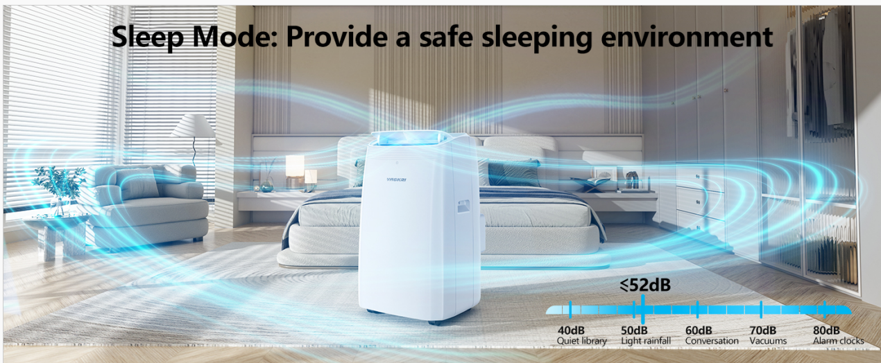
Image: Sleep Mode provides a safe sleeping environment with low noise.