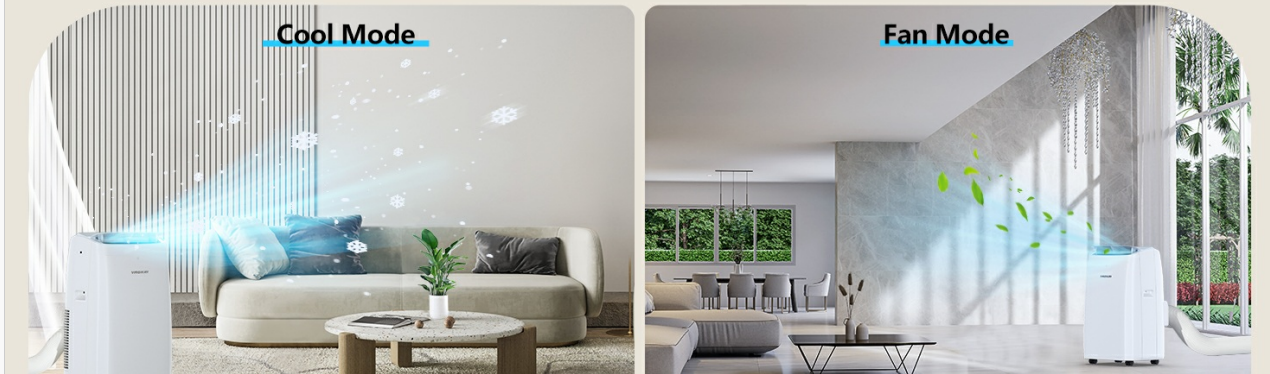
Image: Four modes to meet your various needs: Cool, Fan, Smart, Dry.