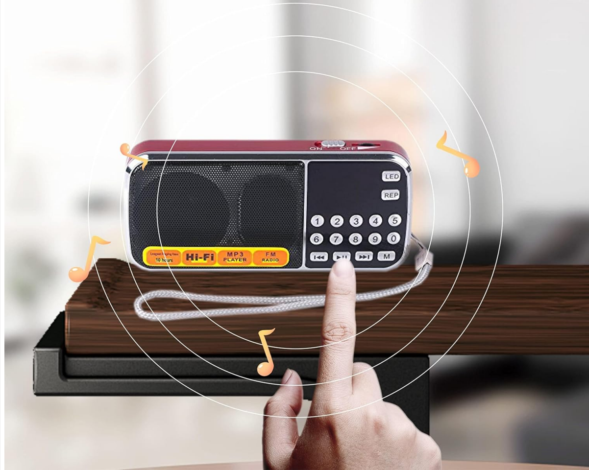
Figure 5: Auto Scan and Memory Function