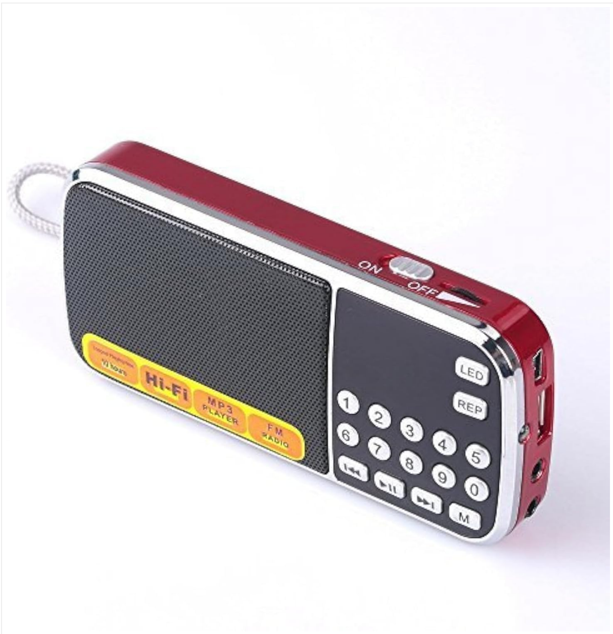
Figure 1: Leting Portable AM/FM Radio and MP3 Speaker (Model 088)