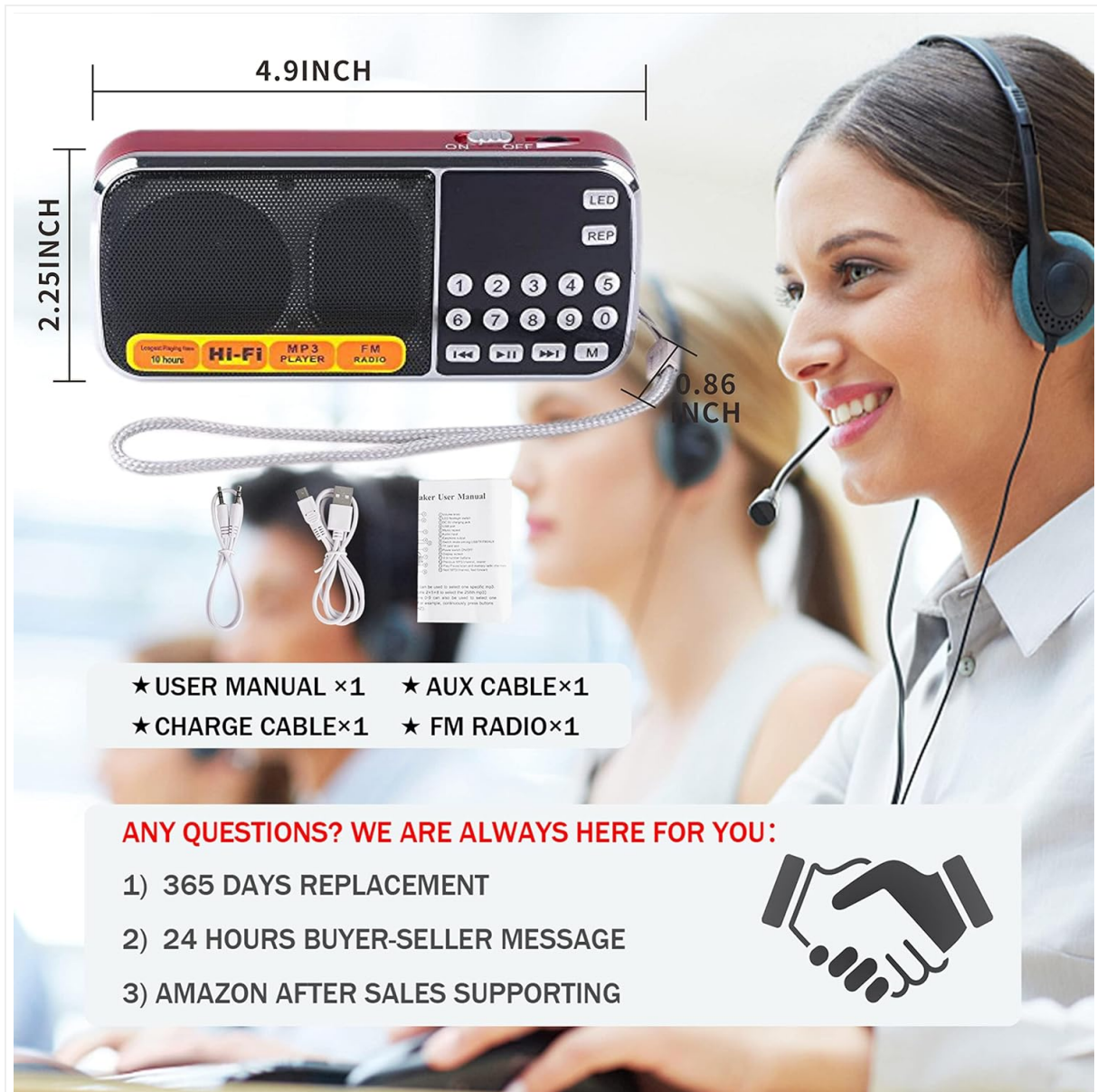
Figure 2: Included Accessories and Dimensions