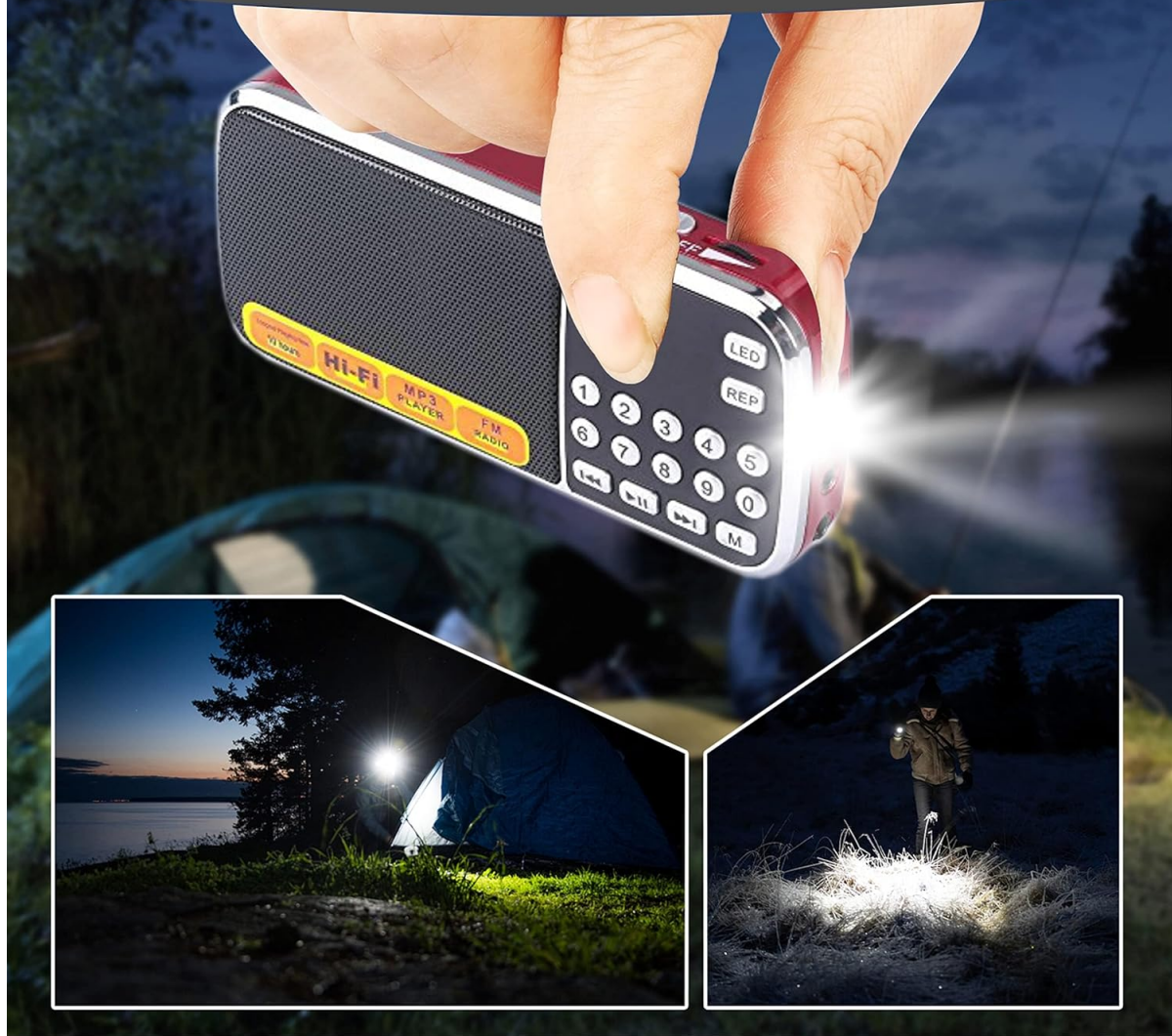
Figure 7: Emergency Flashlight