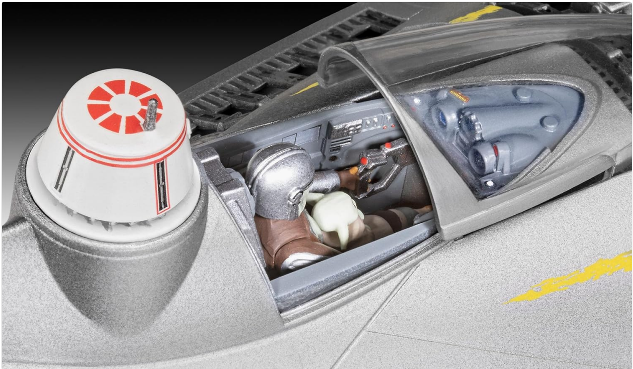
Image: A close-up view of the N1 Starfighter's cockpit, showing the detailed interior and the seated 'Mando' figurine.

Follow the numbered steps provided in the kit's diagrammatic instructions. Pay close attention to part orientation and adhesive application. Allow sufficient drying time for all glued joints before proceeding to the next step.