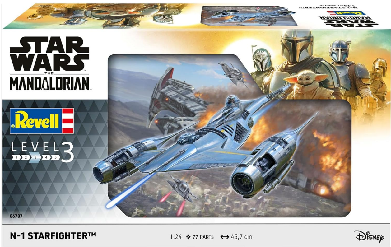
Image: The product box art for the Revell 06787 Star Wars: The Mandalorian N1 Starfighter model kit, showing the assembled starfighter and characters from the series.