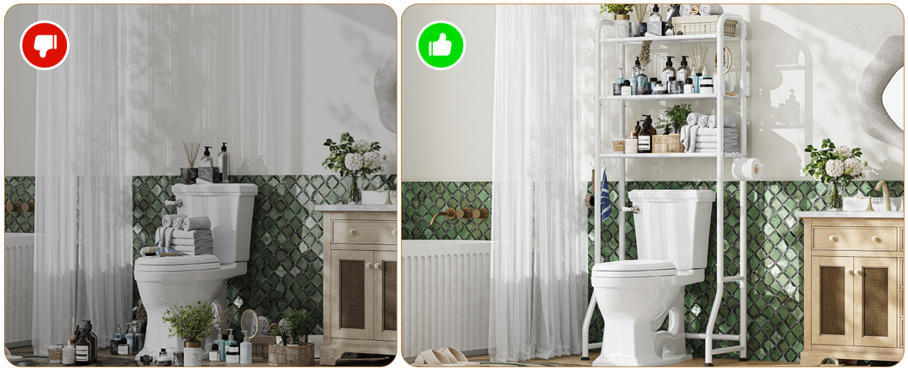
Figure 2: The storage rack efficiently organizing a bathroom with toiletries and towels.