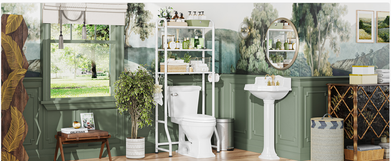
Figure 3: The rack providing additional storage for laundry supplies.