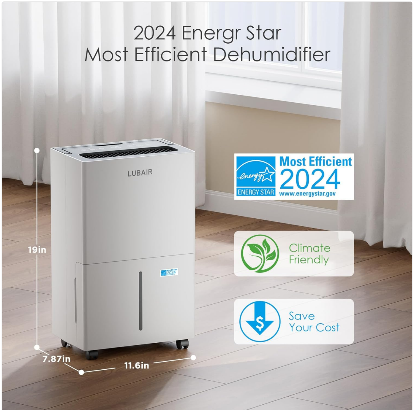
Figure 2: Dimensions of the LUBAIR 52-Pint Dehumidifier, highlighting its compact size.