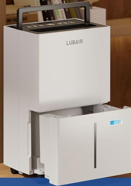
Figure 4: Illustration of the two drainage methods: manual water tank and continuous drainage via hose.

Manual Drainage 0.66 Gallon Water tank auto shut-off when the Water tank is Full