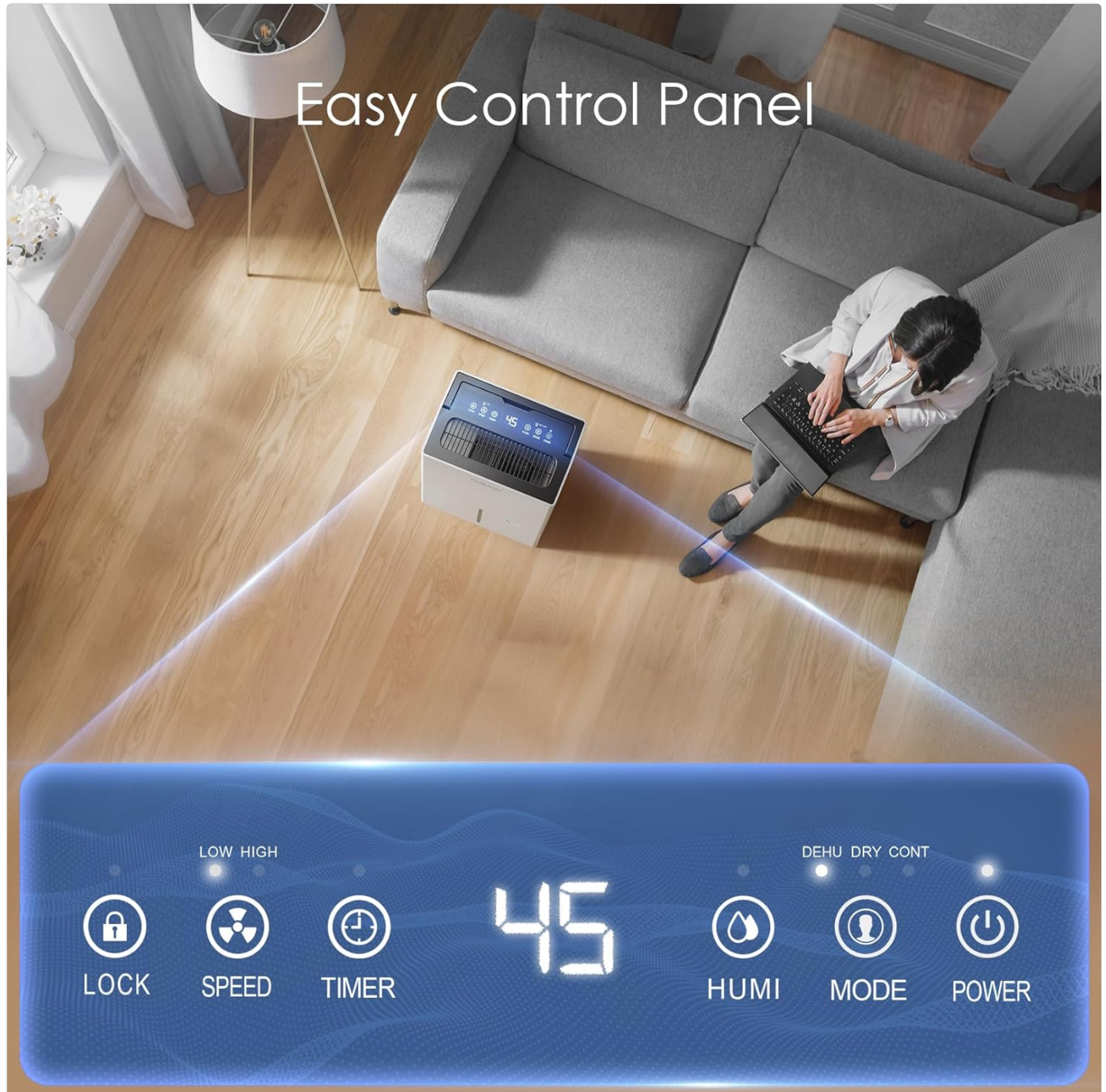
Figure 6: Detailed view of the control panel, showing various buttons and the digital display.