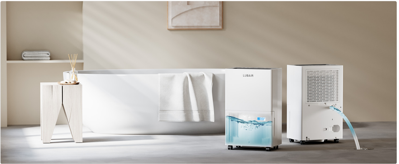
Figure 3: Examples of suitable placement for the dehumidifier in different home environments like basements, bathrooms, living rooms, laundry rooms, and cloakrooms.